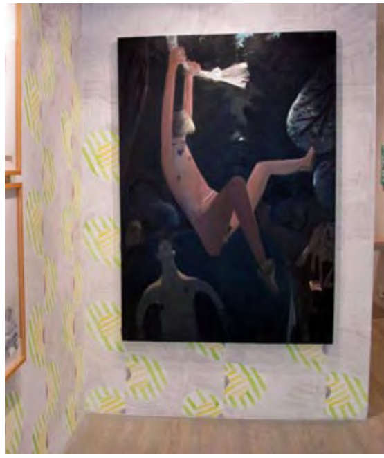
Kyle Staver The Boys of Pinetop Pond, 2011 oil on canvas, 70 x 50 in