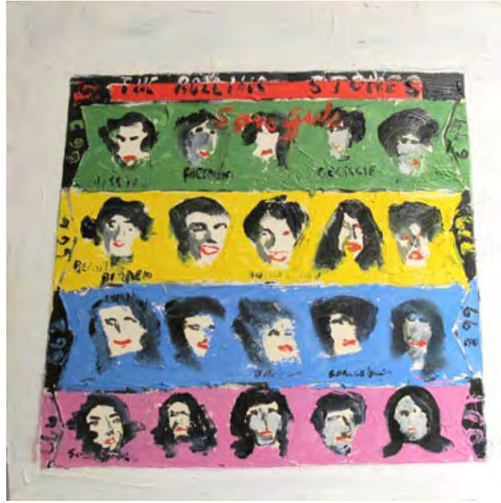
Gideon Bok Rolling Stones: Some Girls, 2012 oil on mdf panel, 12 1/4 x 12 1/4 in