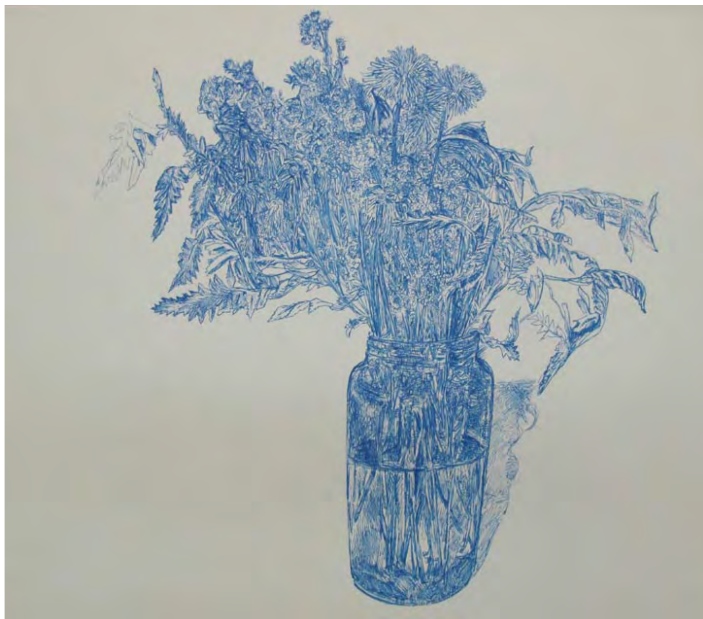
Peter LaBier Blue Flowers, 2011 ink on paper, 22 x 30 in