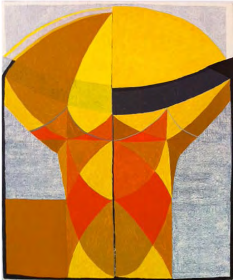
Matt Phillips Fish Out of Water, 2012 oil on canvas over panel, 24 x 20 in