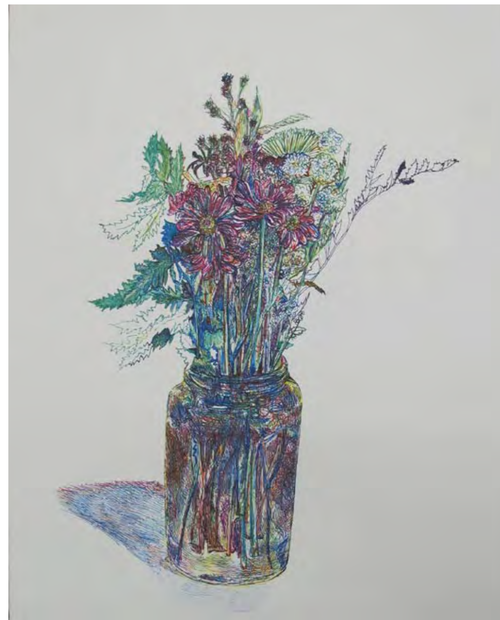
Peter LaBier Flowers, 2011 ink on paper, 28 3/8 x 22 1/2 in