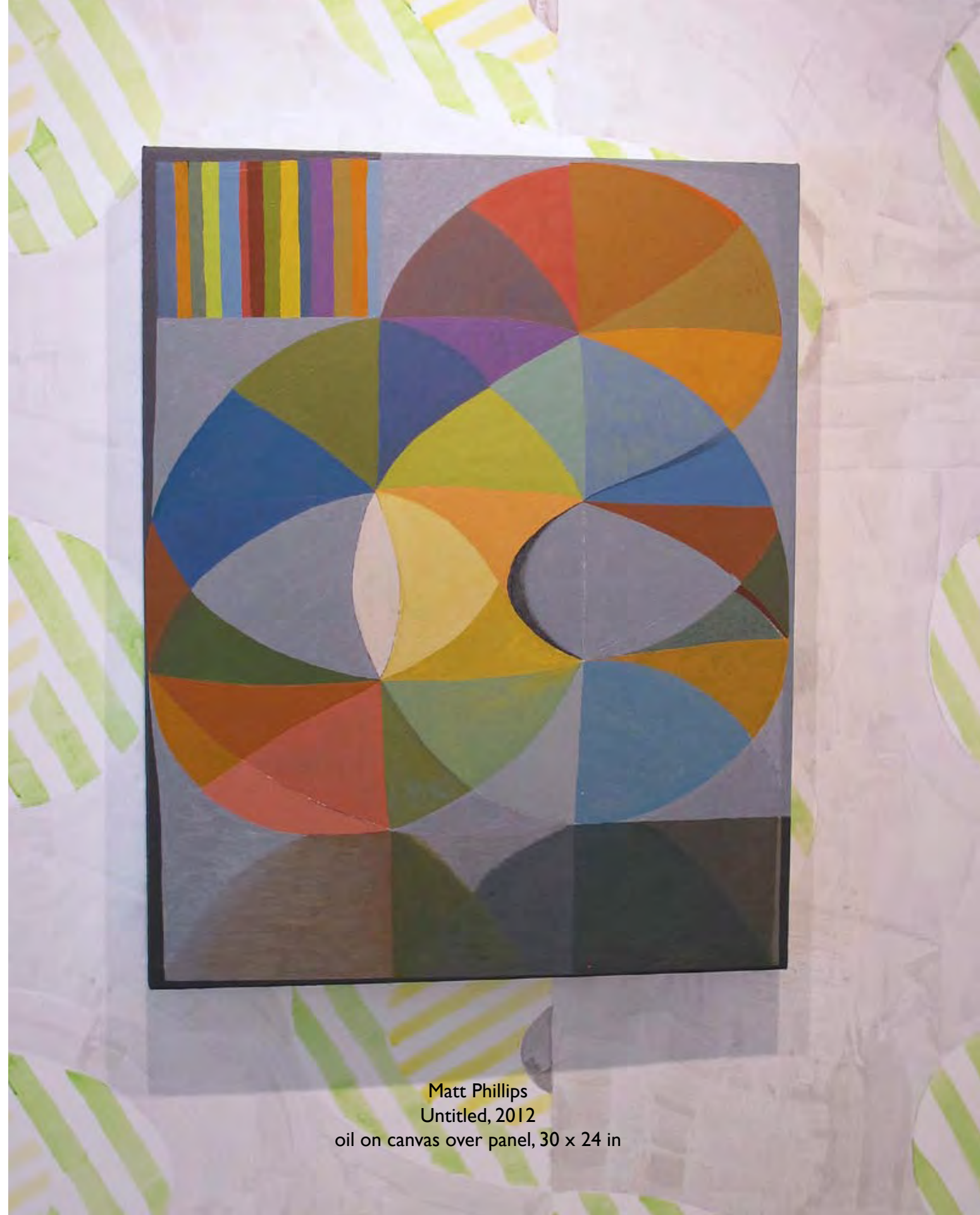
Matt Phillips Untitled, 2012 oil on canvas over panel, 30 x 24 in