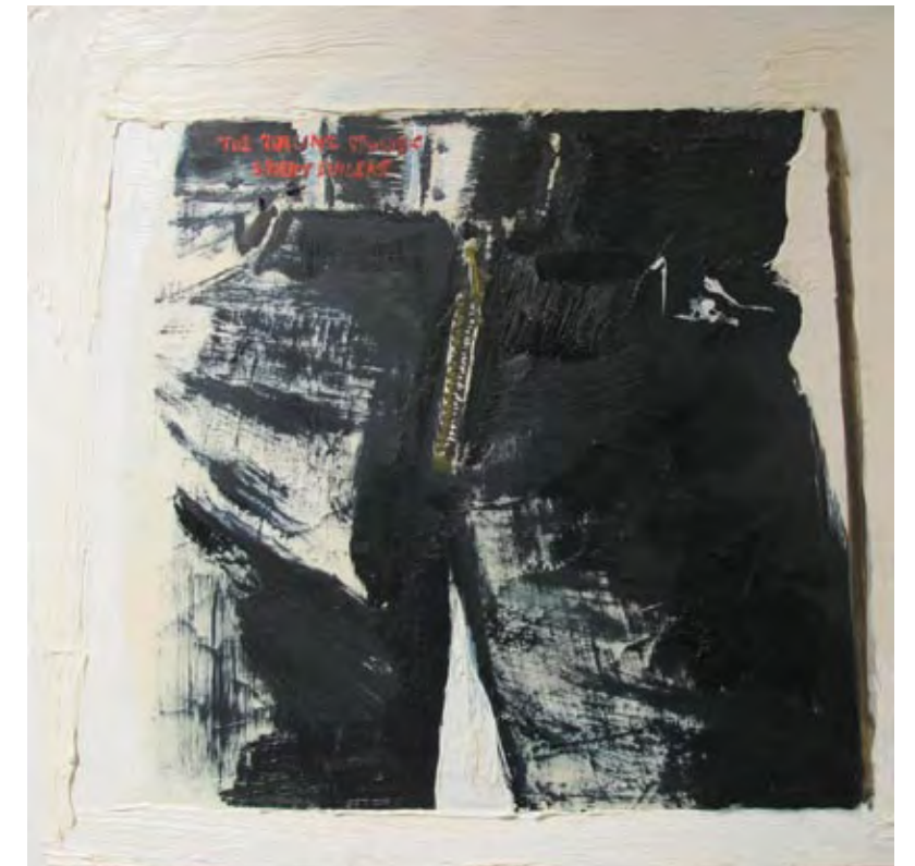
Gideon Bok Rolling Stones: Sticky Fingers, 2012 oil on mdf panel, 12 1/4 x 12 1/4 in