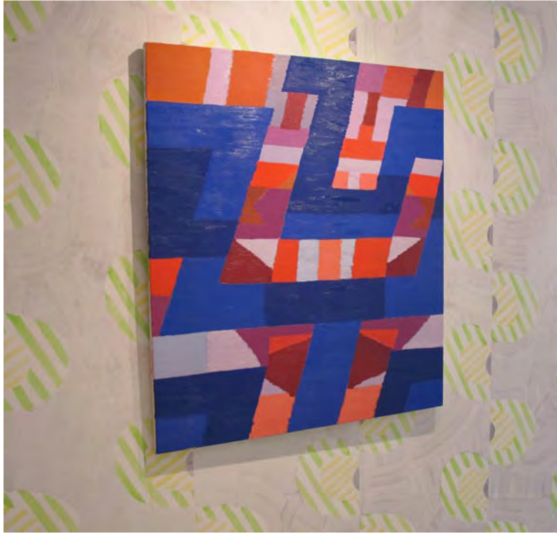
Meghan Brady Untitled, 2012 oil on canvas, 48 x 44