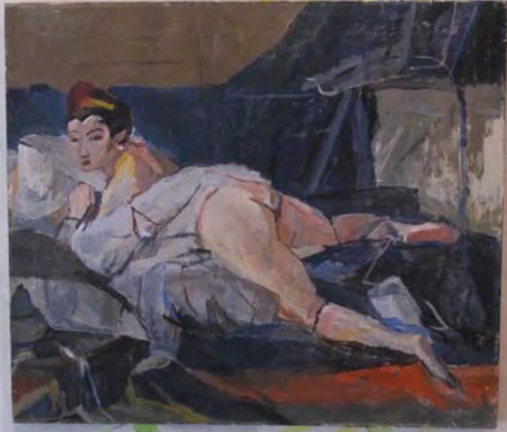
Janice Nowinski Recumbent I, 2001 oil on linen, 20 x 24 in