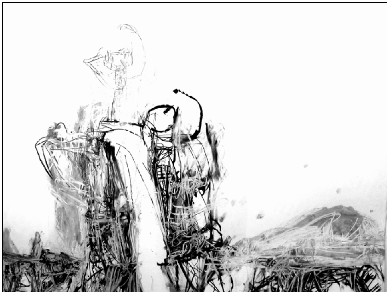
Tara Geer Outcropping, 2012 mixed media on paper, 22 x 30 in