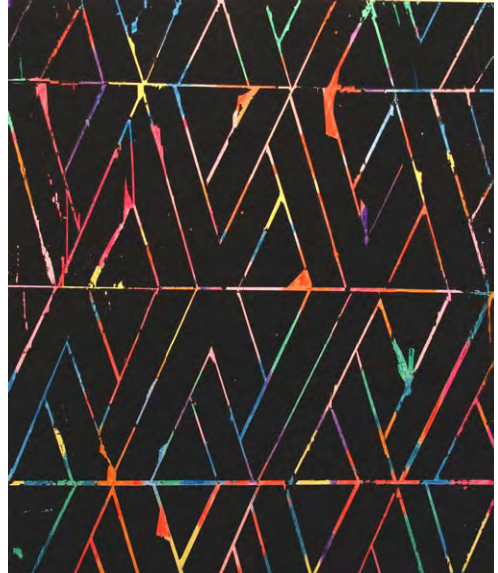
Andrea Bergart Double V, 2012 crayon and acrylic on paper mounted on panel, 14 x 17 in