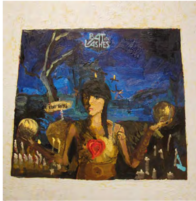
Gideon Bok Bats for Lashes: Two Suns, 2012 oil on mdf panel, 12 1/4 x 12 1/4 in