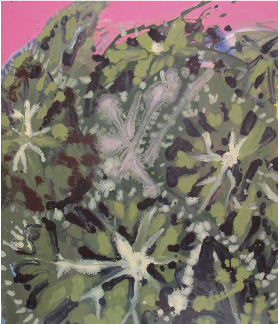
Lauren Luloff Green Begonia on Pink, 2013 oil on fabric, 21 x 18 inches