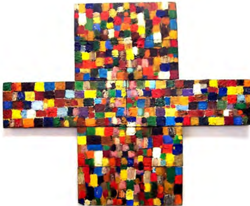
Jan Muller Cross Mosaic, 1953 oil on wood panels, 26 x 31 inches