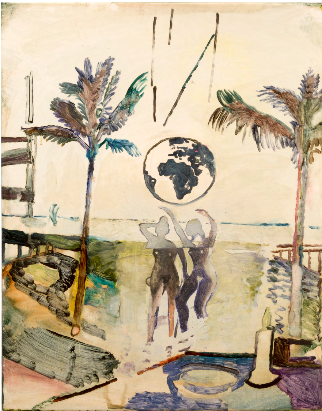
Tim Lokiec Untitled-Balearic Painting I, 2013 oil on canvas, 28 x 22 inches