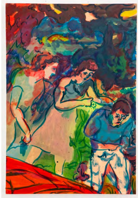
Jackie Gendel The Cold Open, 2012 oil on panel, 19 x 13 inches