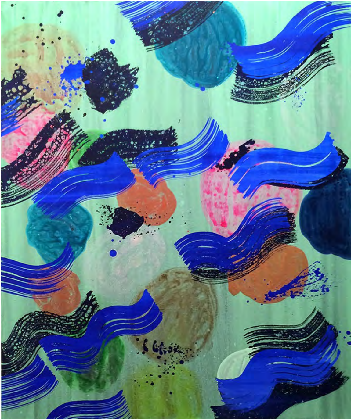
Andrea Bergart Water and Wax, 2014 acrylic on canvas, 61 x 50 inches