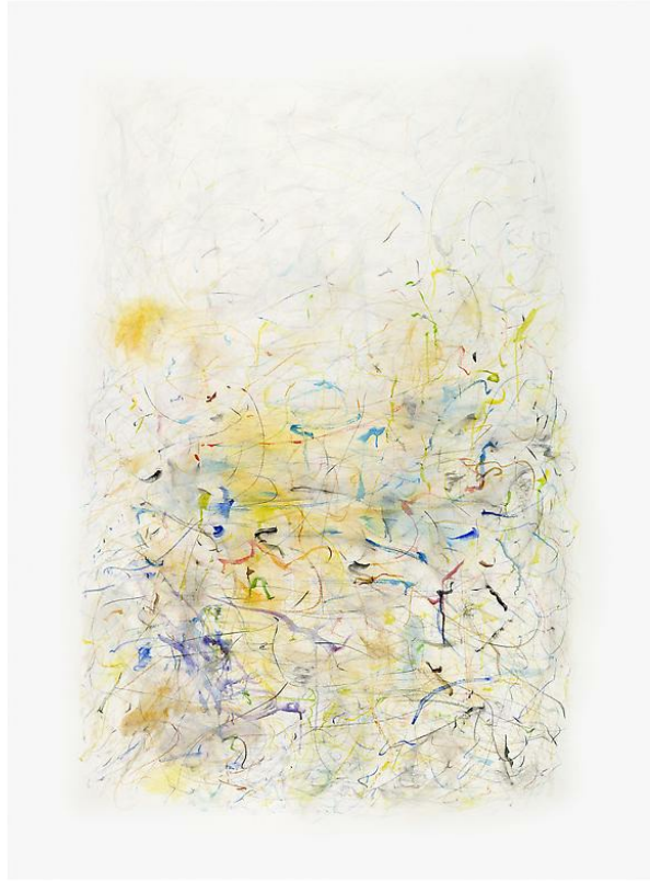
Robert Harms Tom , 2013 oil on canvas 62 x 46 in $16,000