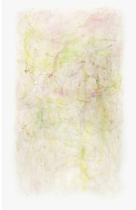
Robert Harms The Younger , 2014 oil on canvas 62 x 40 in $16,000