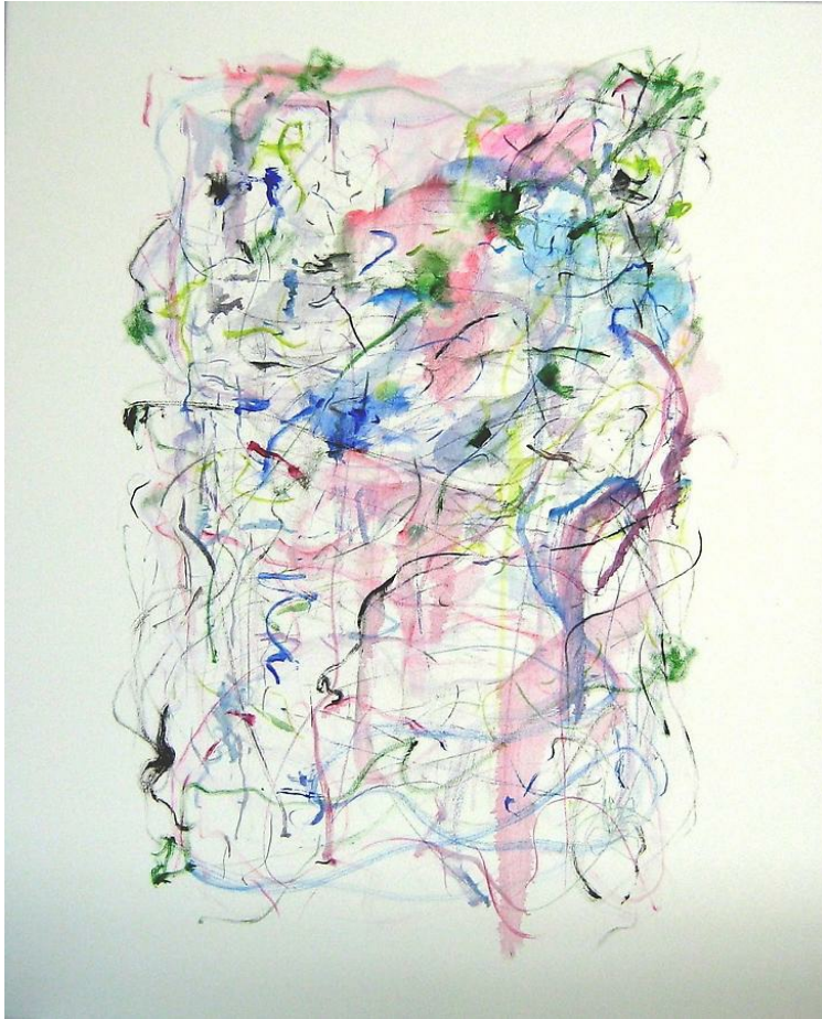
Robert Harms August Pink , 2010 oil on canvas 42 x 38 in $10,000