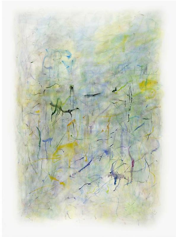
Robert Harms Other Flowers , 2013 oil on canvas 62 x 46 in $16,000