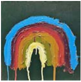
Todd Bienvenu Rainbow , 2015 Oil On Panel 54 x 46 1/2 in