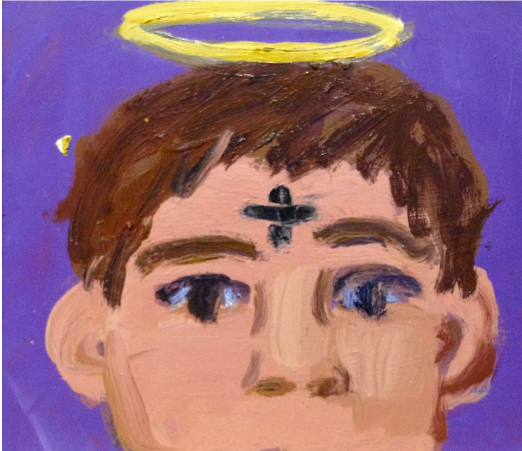
Todd Bienvenu Ash Wednesday , 2015 Oil On Panel 10 1/2 x 12 in