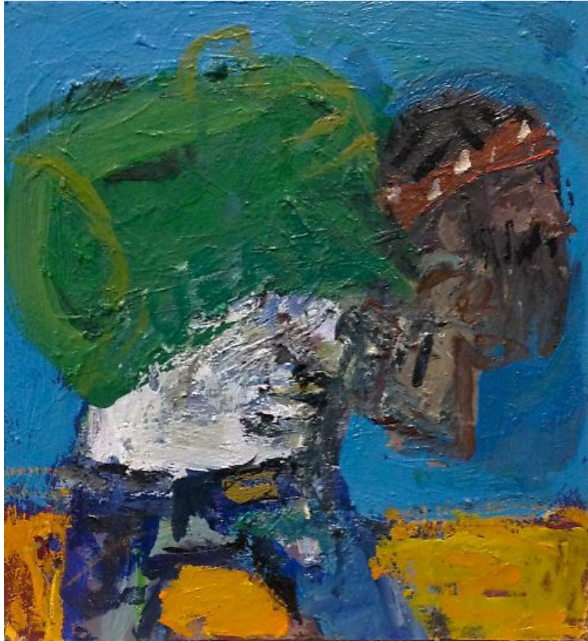
Todd Bienvenu On the Road Again , 2015 Oil On Panel 13 x 12 in