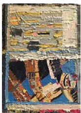
Clintel Steed Satellite and Glitch Screen , 2015 Oil On Panel 15 x 10 in