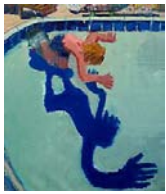
Todd Bienvenu The Deep End , 2015 Oil On Canvas 54 x 46 1/2 in