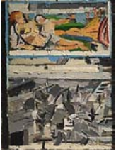
Clintel Steed Love and Destruction , 2015 Oil On Panel 19 1/4 x 15 in