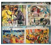
Clintel Steed Untitled Metaphor , 2015 Oil On Panel 84 x 96 in