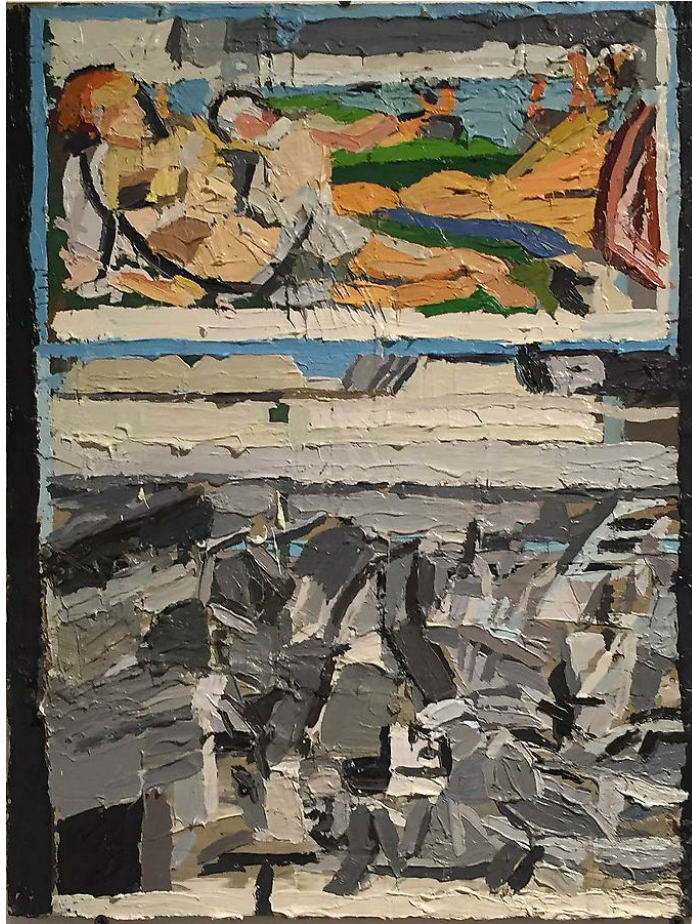
Clintel Steed Love and Destruction, 2015 Oil On Panel 19 1/4 x 15 in