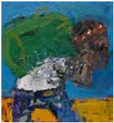
Todd Bienvenu On the Road Again , 2015 Oil On Panel 13 x 12 in