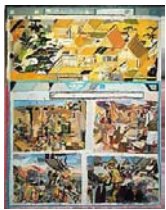
Clintel Steed Heaven and Hell , 2015 Oil On Panel 62 x 48 in