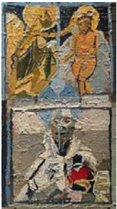
Clintel Steed Robots and Jesus Christ , 2015 Oil On Panel 24 1/2 x 13 3/4 in