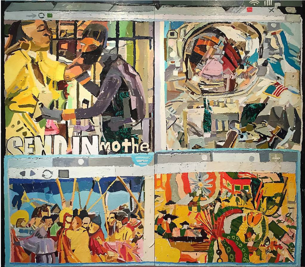
Clintel Steed Untitled Metaphor , 2015 Oil On Panel 84 x 96 in