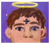
Todd Bienvenu Ash Wednesday , 2015 Oil On Panel 10 1/2 x 12 in