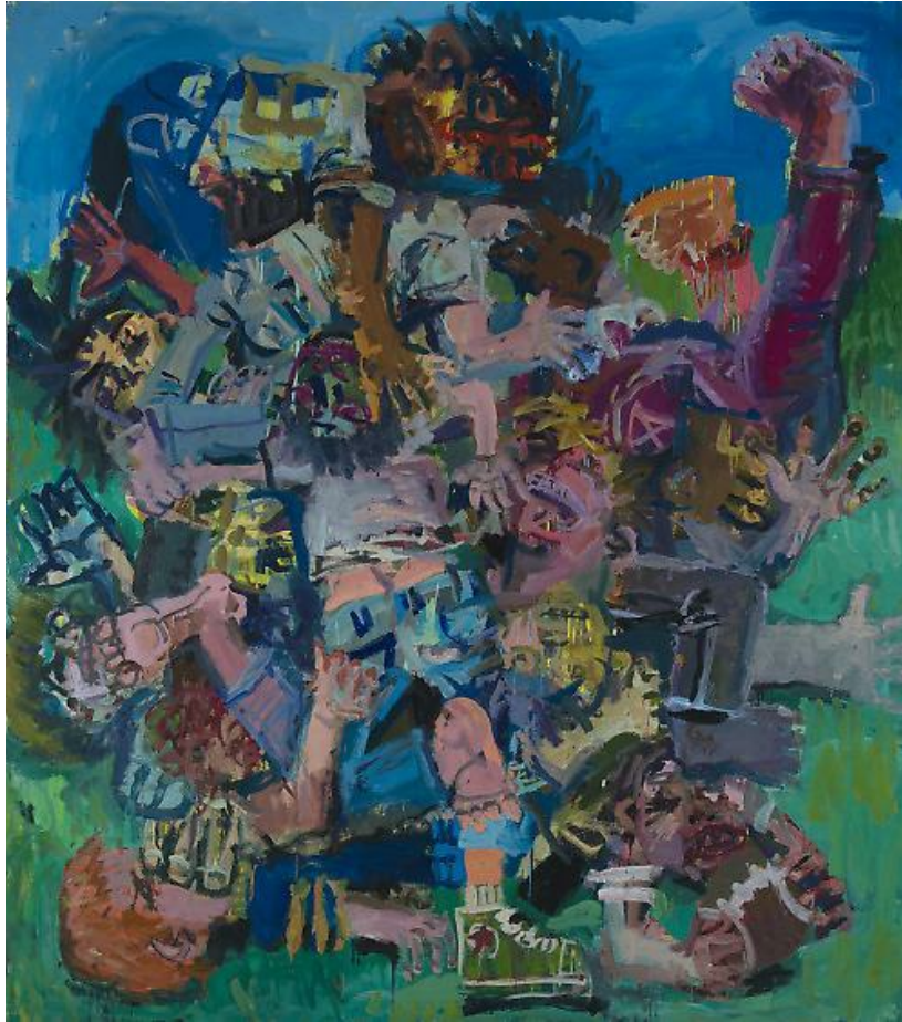
Todd Bienvenu Boys Will Be Boys , 2014 Oil On Canvas 76 x 67 in