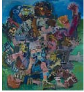
Todd Bienvenu Boys Will Be Boys , 2014 Oil On Canvas 76 x 67 in