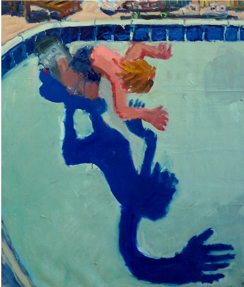
Todd Bienvenu The Deep End , 2015 Oil On Canvas 54 x 46 1/2 in