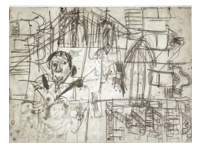
Figures with Manhattan Bridge and Tenements c. 1960, pencil on paper 17 ¾ x 23 ¾ in.