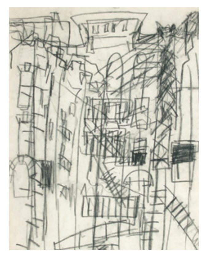
Untitled (Tenement) c. 1960, charcoal on paper 23 ¾ x 17 ¾ in.

City Anguish 1958, oil on canvas 84 ¼ x 72 in.