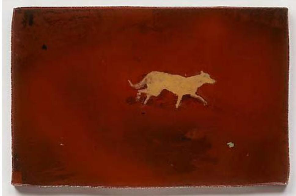
Anna Mendes The Red Dog , 2015 oil, enamel and epoxy on panel 7 1/2 x 11 3/4 in sold