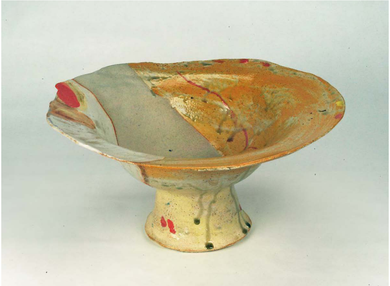
Beth Kaminstein Angelico's Lap , 2016 8 1/2 x 17 x 17 in $1,500