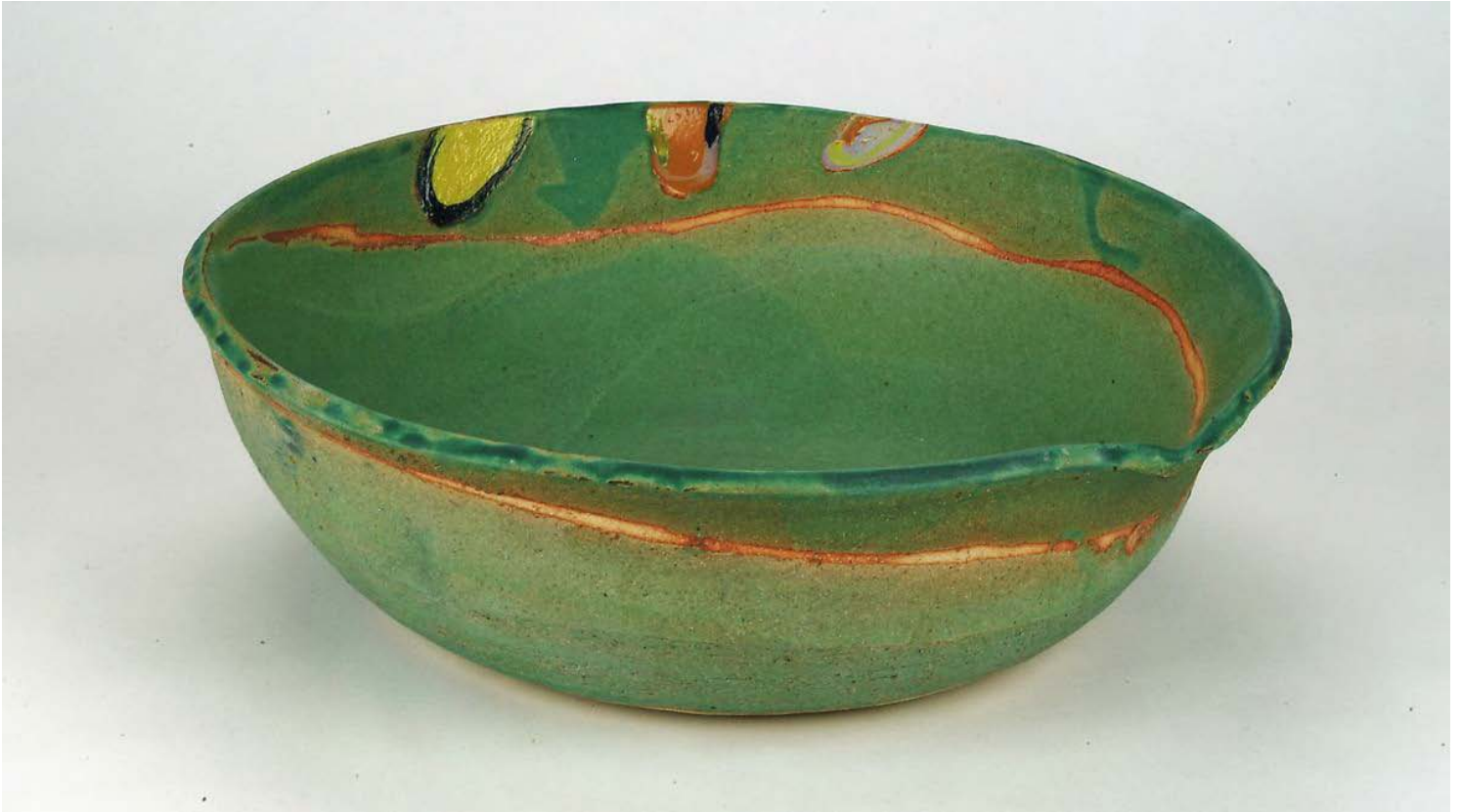
Beth Kaminstein Aura bowl remake 5 , 2015 4 x 13 x 13 in $800