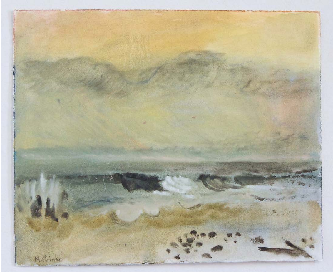
Paul Metrisko Ditch Plains , 2016 Oil on paper 11 x 13 in $1,200