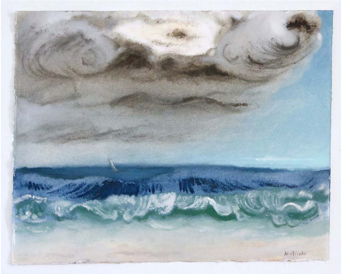
Paul Metrisko Eye of the Storm , 2016 oil on paper 12 x 15 in $1,200