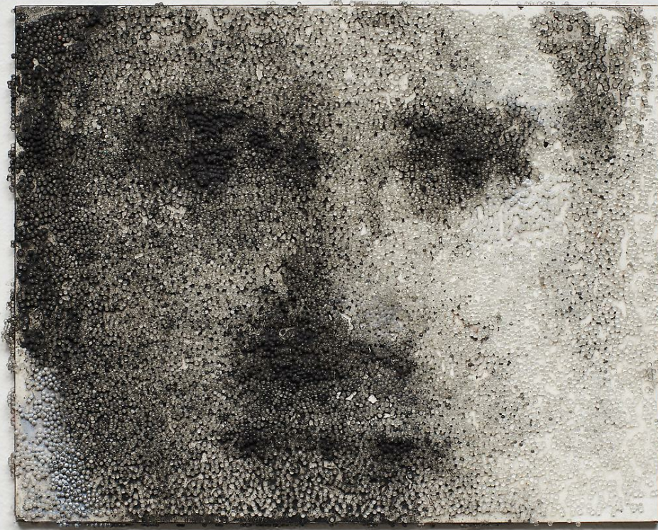
Anna Mendes Untitled , 2013 oil and glass beads on panel 11 1/4 x 12 1/4 in $800