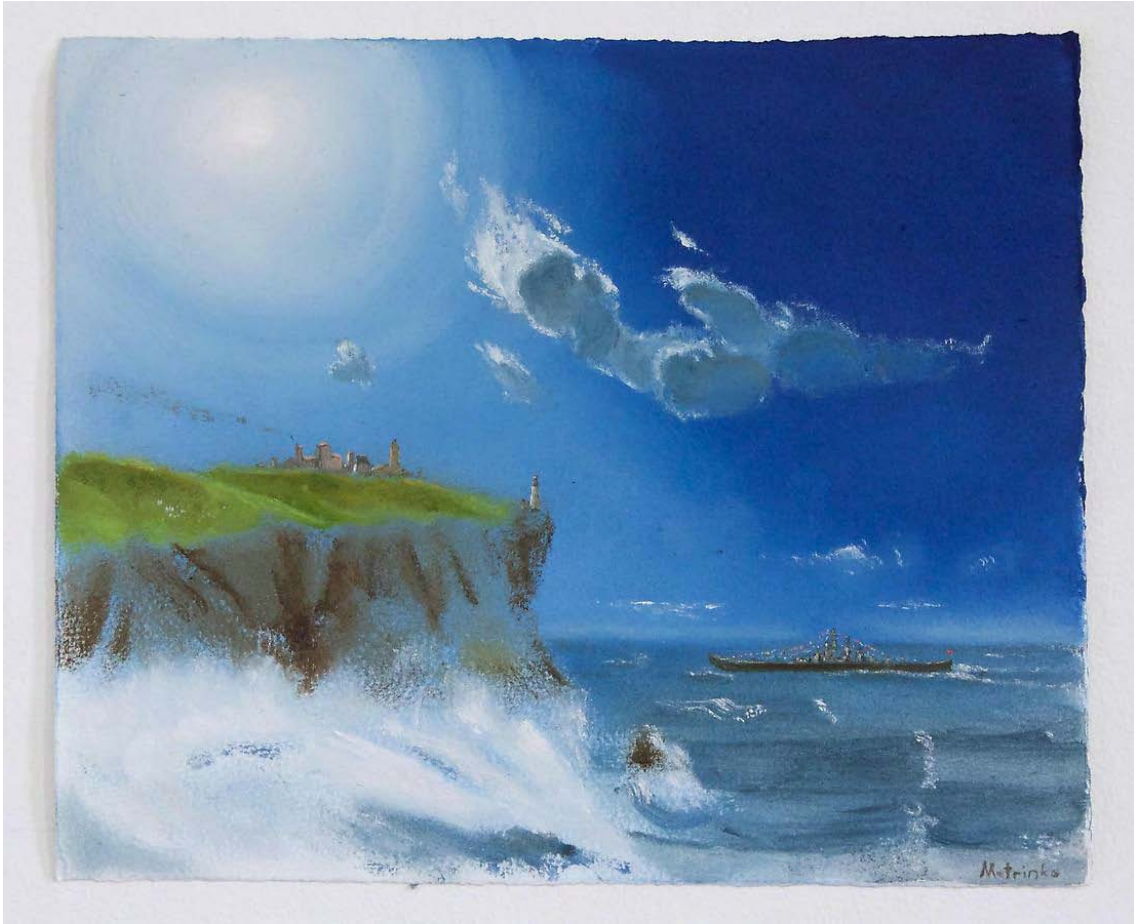
Paul Metrisko The Strait , 2016 oil on paper 10 x 12 in $1,200