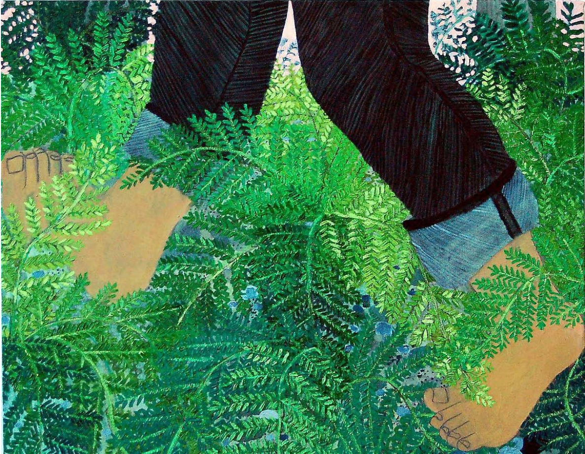
Giordanne Salley Fern Walk , 2015 Oil and paper on canvas 28 x 32 in $3,000