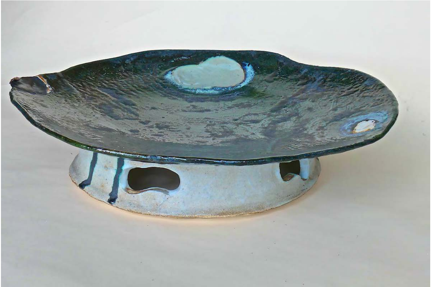
Beth Kaminstein Demolition Ash Platter , 2015 6 x 24 x 24 in $1,600