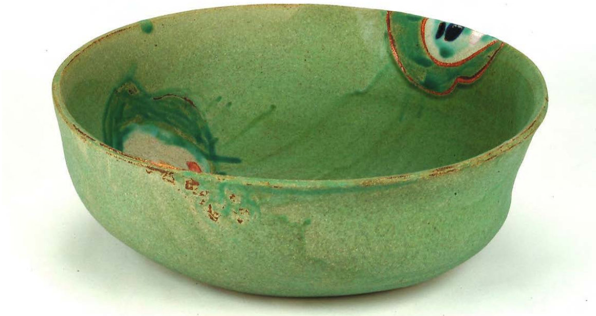
Beth Kaminstein untitled green bowl with shapes and blue line , 2015 4 1/2 x 13 1/2 x 13 1/2 in on hold