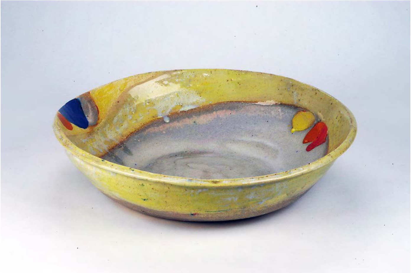
Beth Kaminstein Untitled Bowl, yellow with red and blue 3 , 2016 4 x 17 x 17 in $900