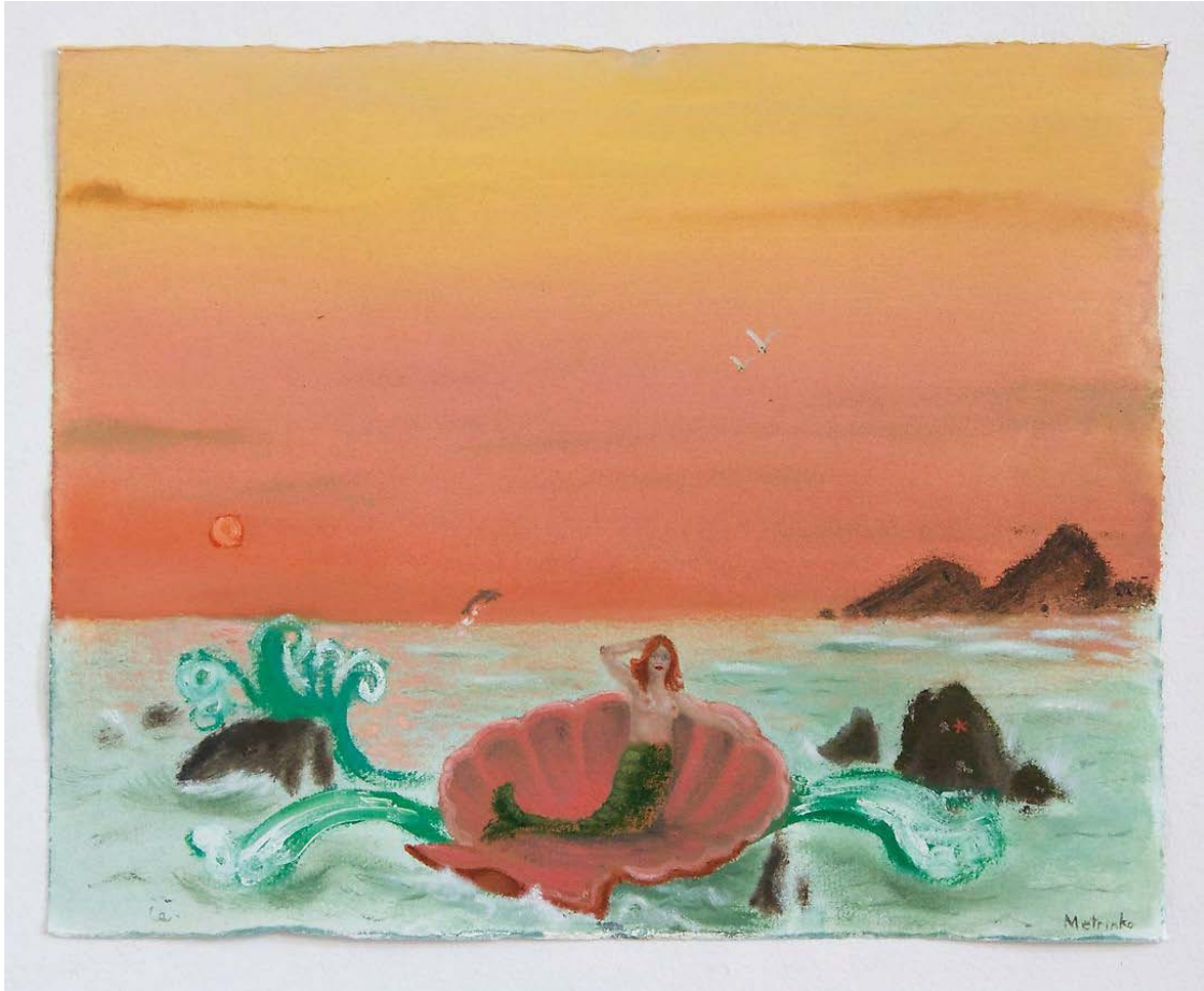
Paul Metrisko Birth of Venus , 2016 oil on paper 11 x 13 in $1,200