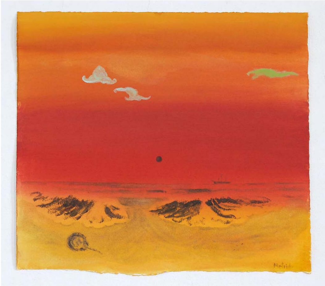
Paul Metrisko Horeshoe Crab at Sunset , 2016 oil on paper 13 x 15 in $1,200