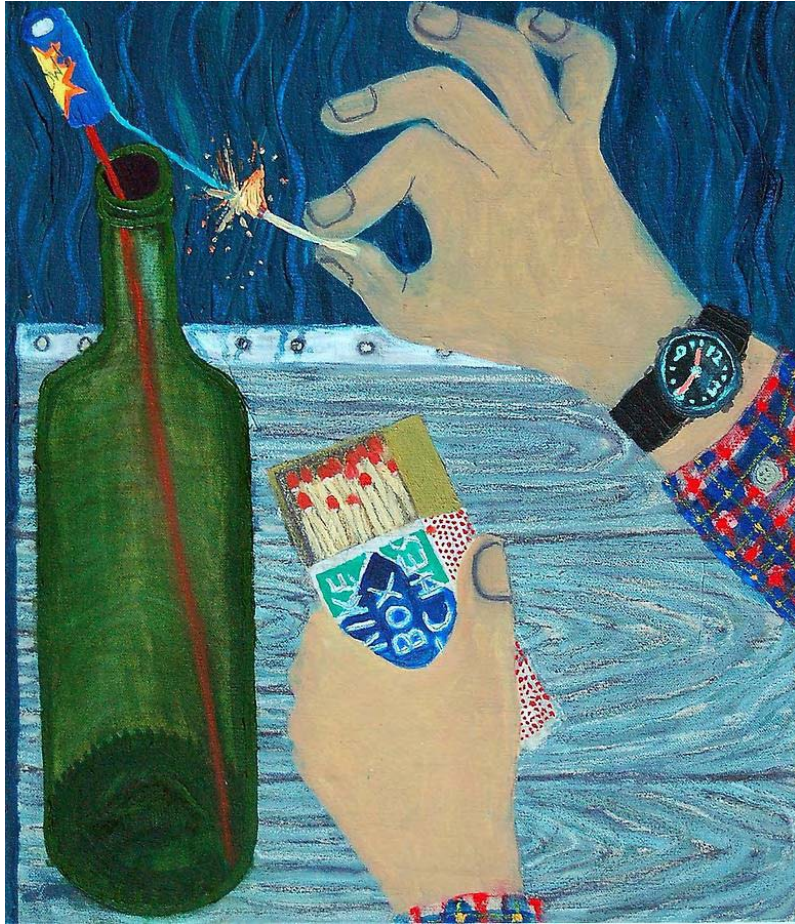
Giordanne Salley Bottle Rocket , 2015 oil and paper on canvas 16 x 14 in $1,500