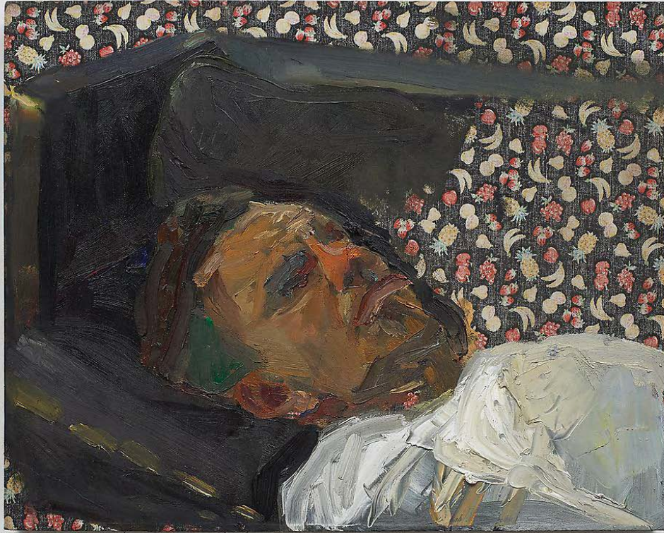
Anna Mendes Kurt , 2013 oil on fabric 16 x 20 in $1,000