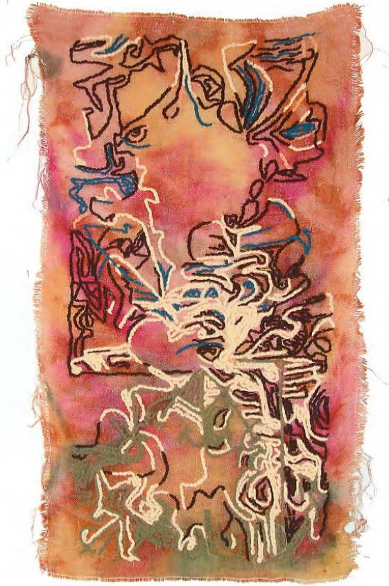
Liv Aanrud Slow On The Draw , 2015 47 x 27 in $4,000