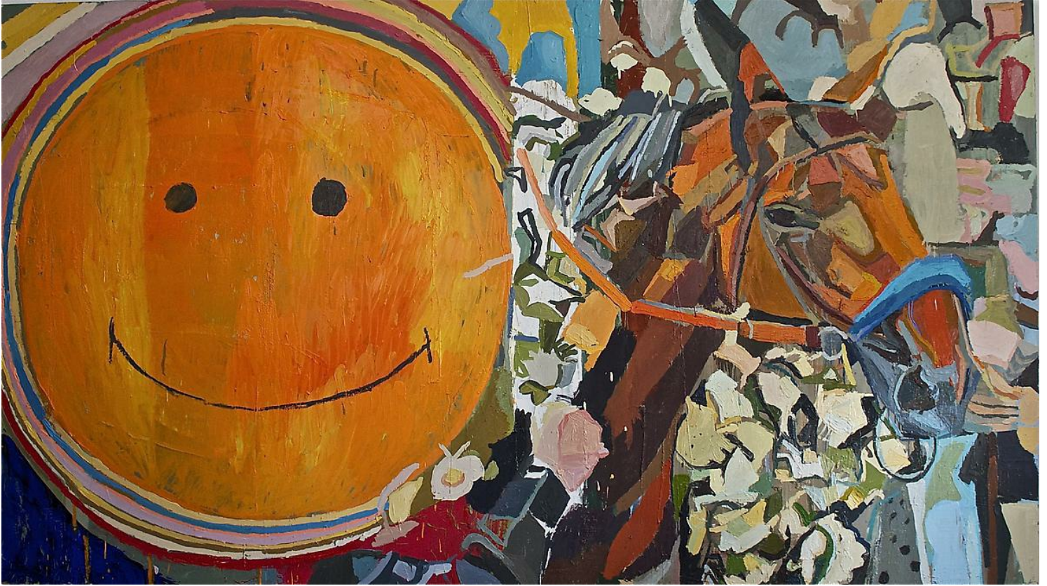
Clintel Steed American Pharoah and Smiley Face , 2015 oil on masonite 48 x 84 in