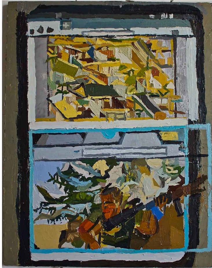
Clintel Steed Heaven and Hell #1 , 2015 Oil On Panel 27 1/2 x 21 3/4 in