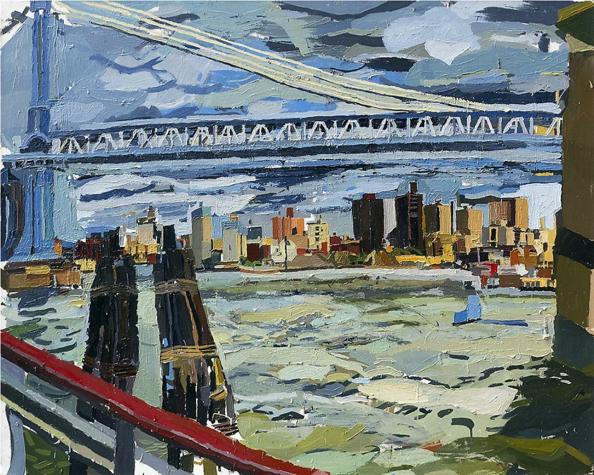
Clintel Steed Manhattan Bridge , 2015 oil on canvas 48 x 60 in