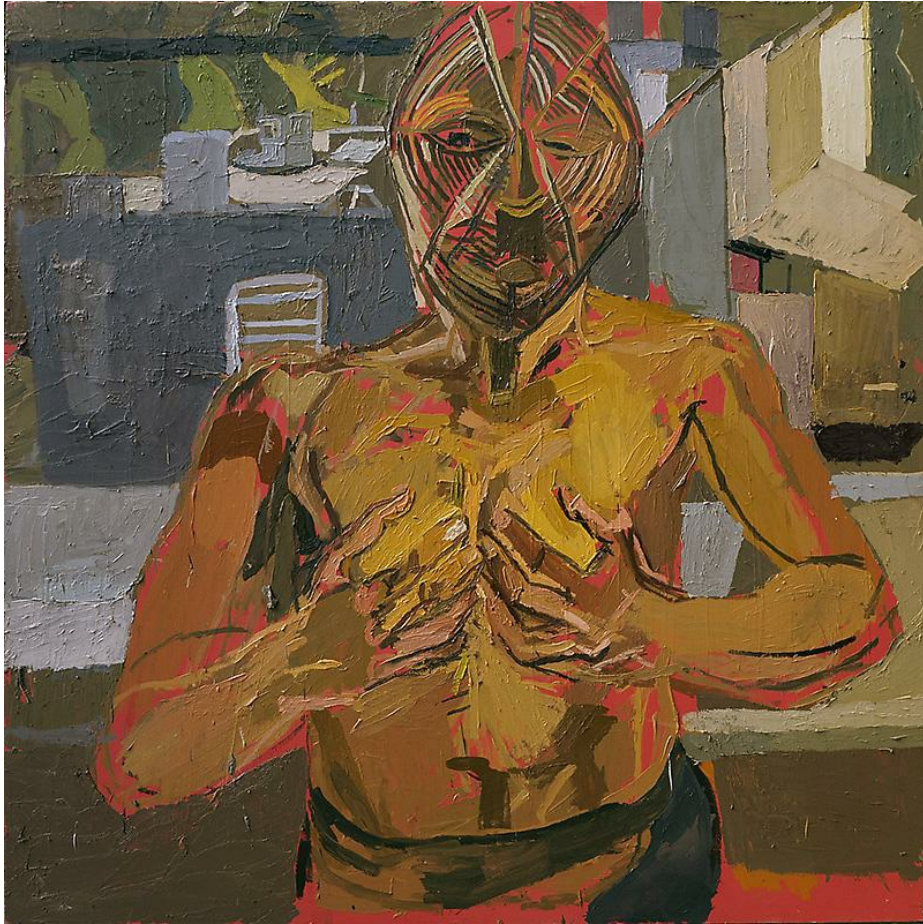
Clintel Steed When Dreams Happen. , 2016 Oil on masonite 48 x 48 in