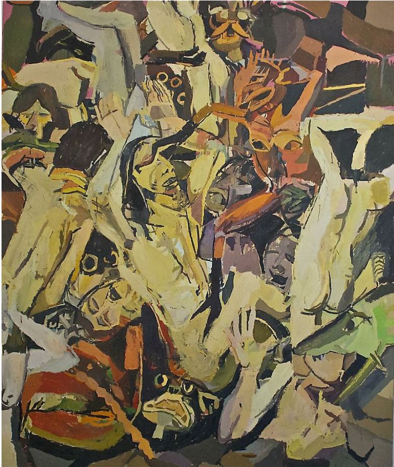
Clintel Steed Rubens, Fall of the Damned, 2016 oil on canvas 80 x 67 in