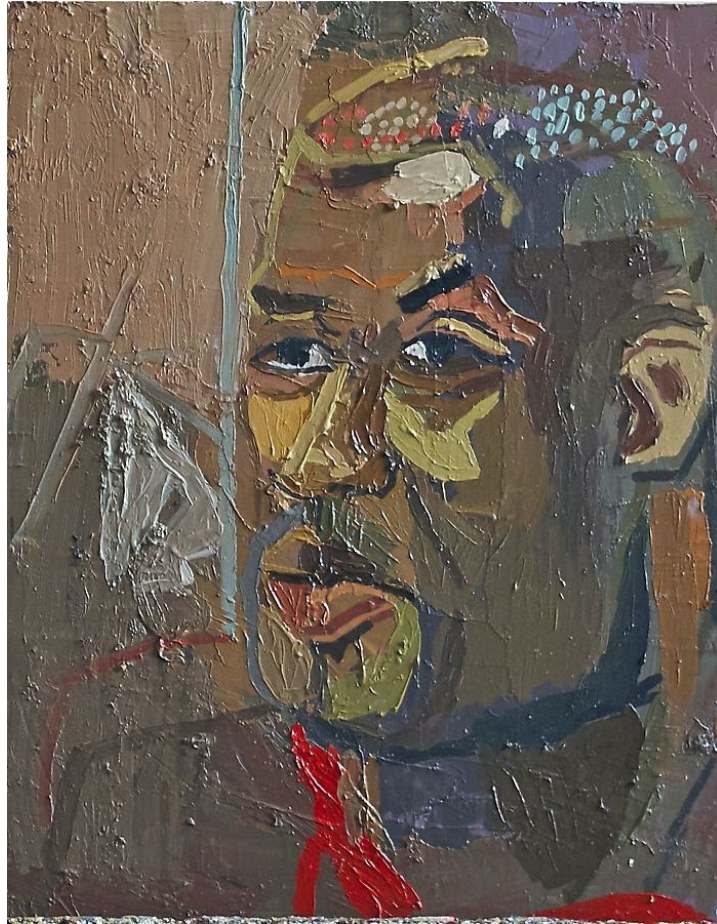
Clintel Steed Lasley #2 , 2016 oil on wood 13 x 10 in