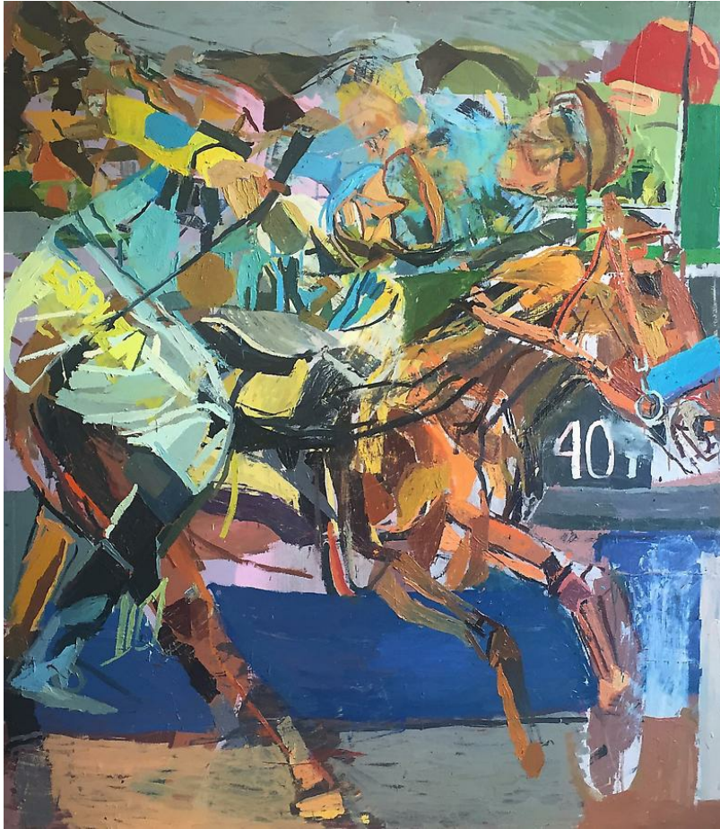
Clintel Steed American Pharaoh , 2016 oil on canvas 73 x 63 3/4 in