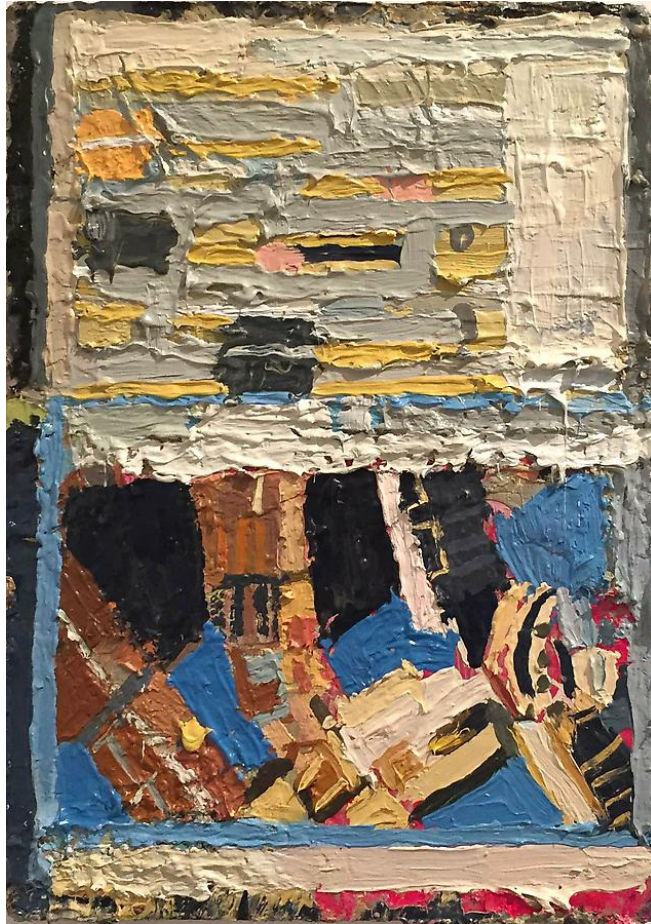
Clintel Steed Satellite and Glitch Screen , 2015 Oil On Panel 15 x 10 in