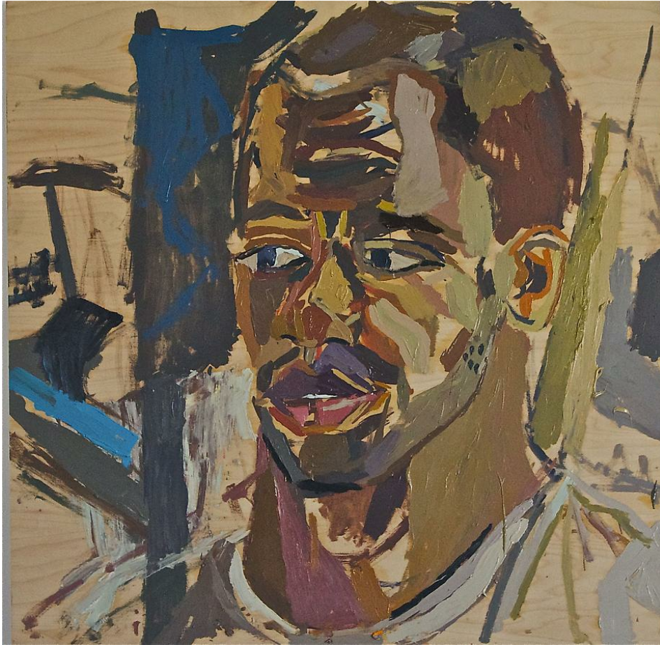
Clintel Steed Lasley W. , 2016 oil on wood 30 x 30 in