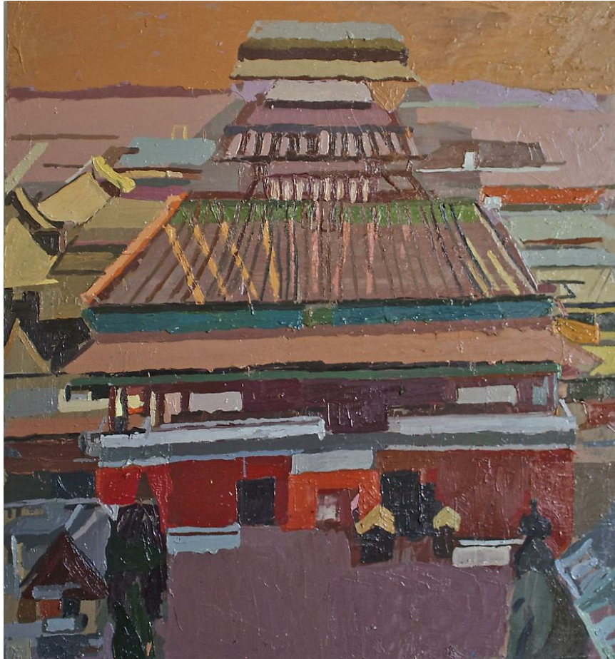
Clintel Steed Temple , 2016 oil on panel 36 x 33 in