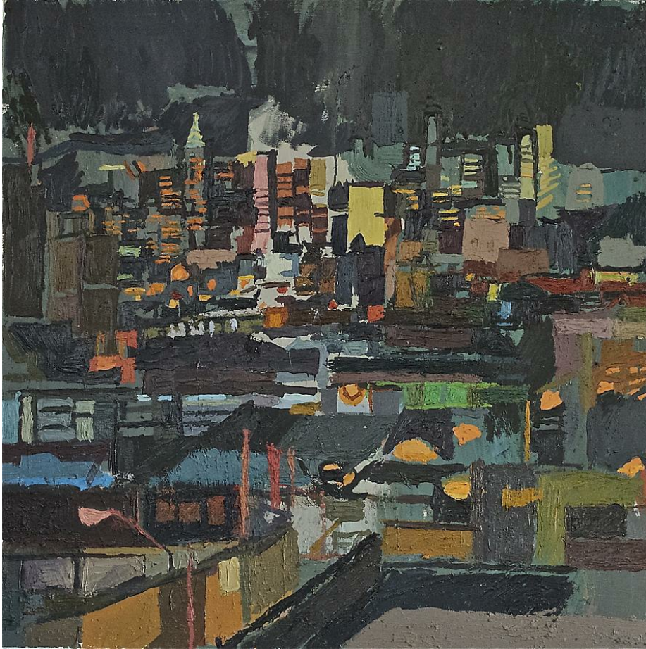
Clintel Steed Bogart Bk, Night Scene, 2016 oil on canvas 36 x 36 in