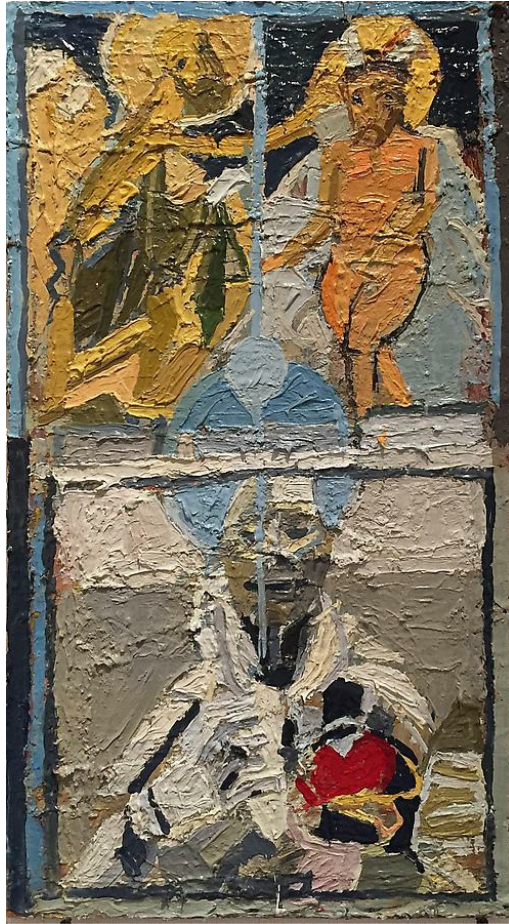
Clintel Steed Robots and Jesus Christ , 2015 Oil On Panel 24 1/2 x 13 3/4 in