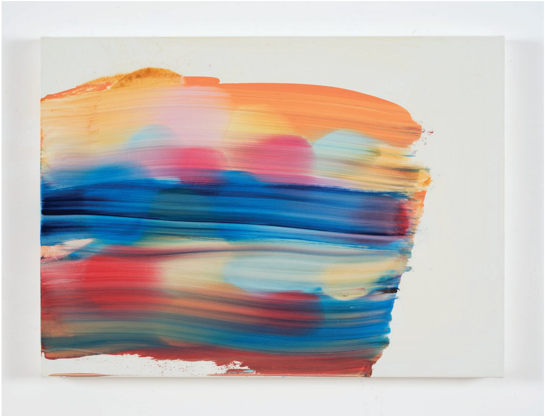
Ship of Fools 2017, oil on linen, 22 x 30 inches