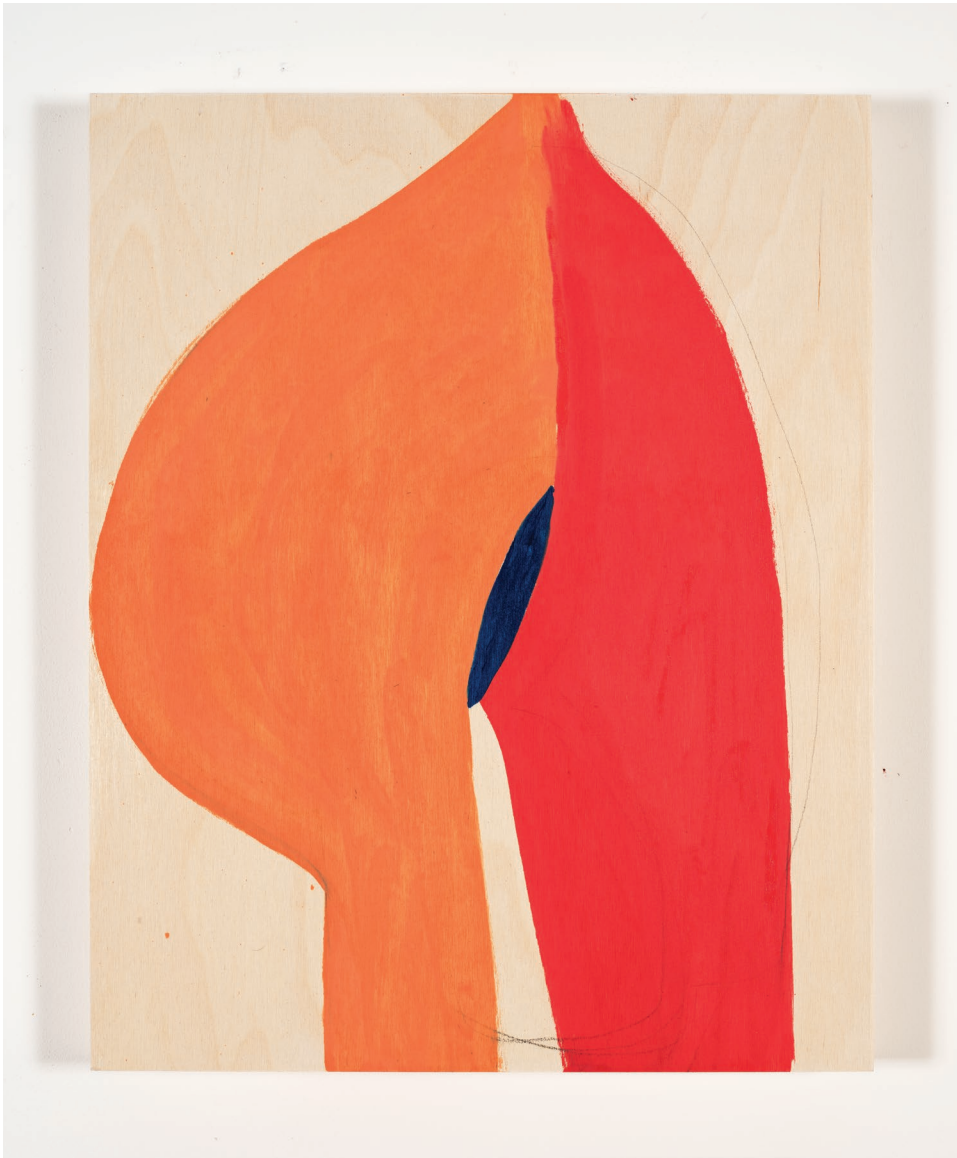
Press 2016, oil on wood panel, 20 x 16 inches