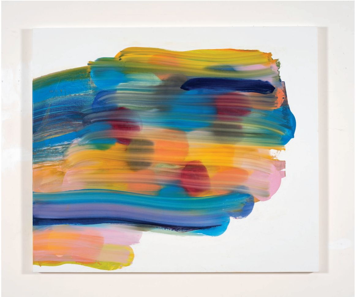
Pirate Jenny 2017, oil on linen, 48 x 56 inches