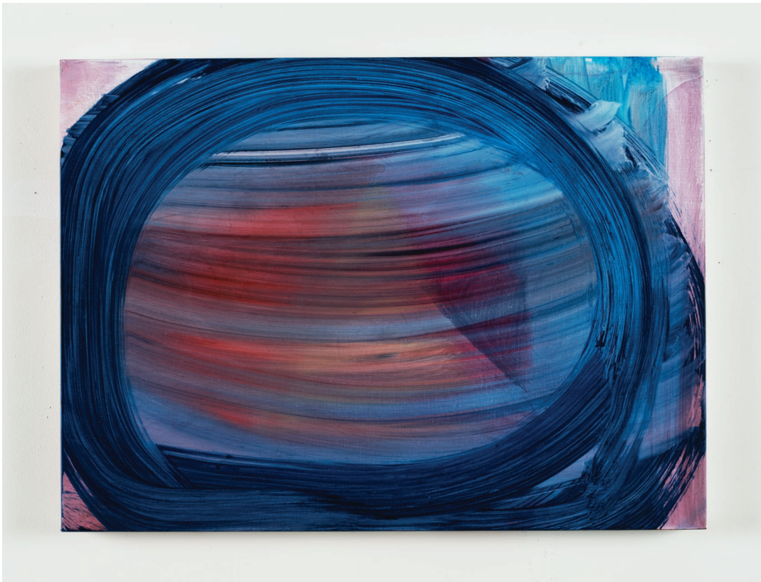
Full Circle 2017, oil on linen, 22 x 30 inches