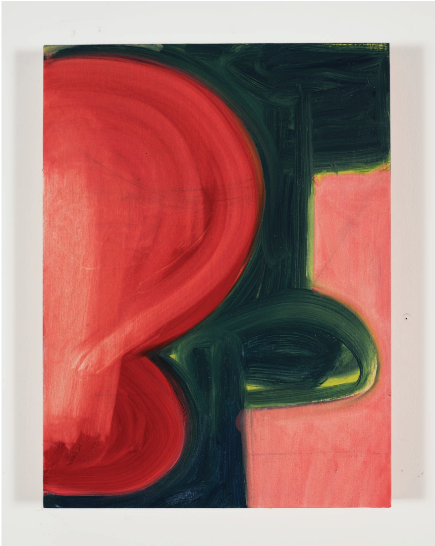
Taste 2016, oil on wood panel, 16 x 12 inches