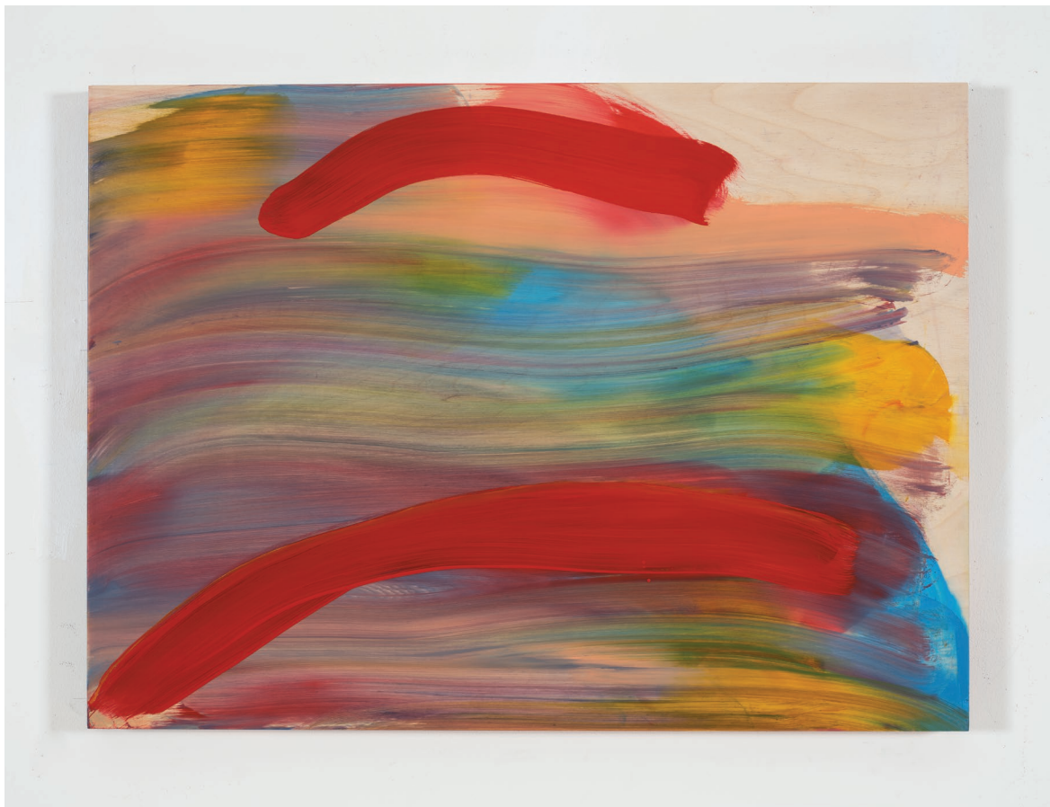
Red Strike 2017, oil on wood panel, 22 x30 inches