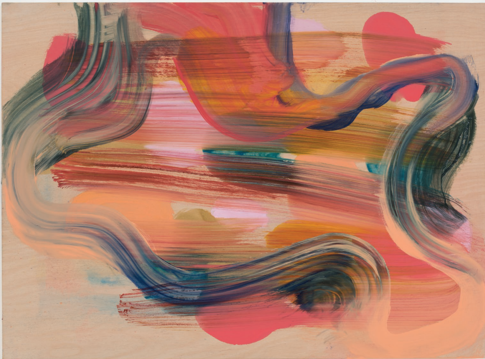
Run Around 2017, oil on wood panel, 22 x 30 inches