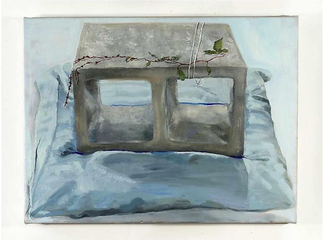
Michele Mirisola Nodding Towards Bondage , 2016 & 2017 oil on Canvas 18 x 24 in $1,200