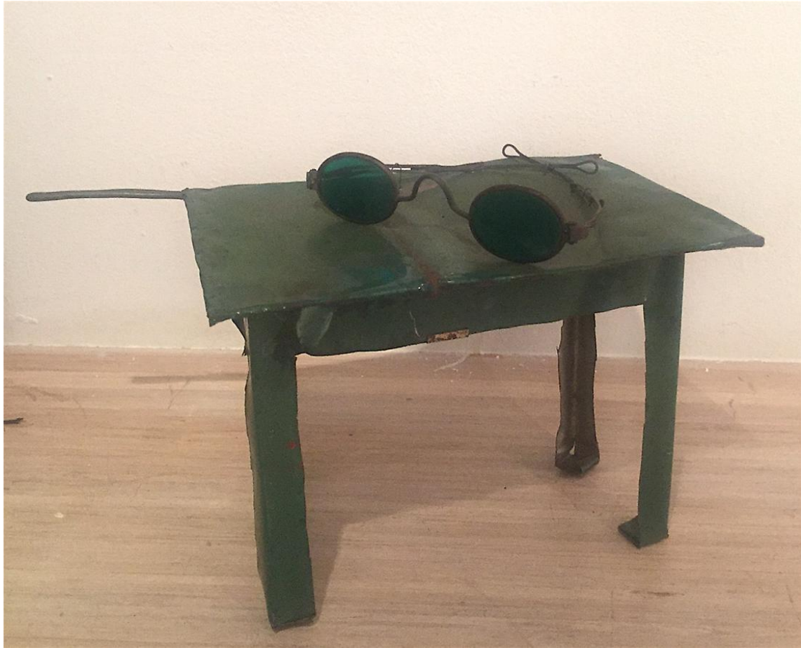
June Leaf Eyeglass Sculpture