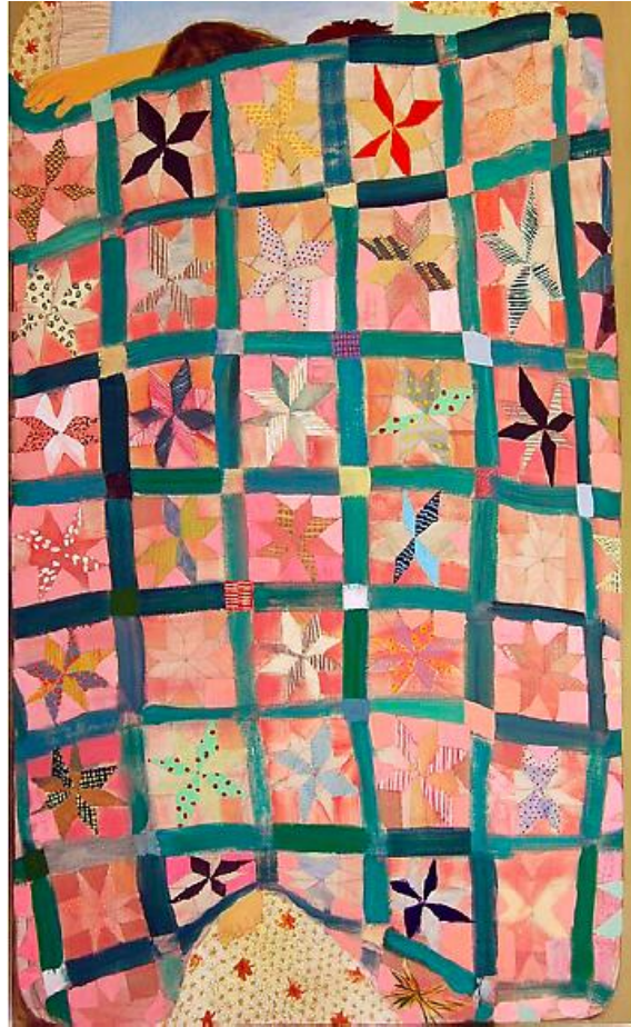
Giordanne Salley Quilt Painting , 2012 oil and paper on canvas 78 x 50 in $8,000