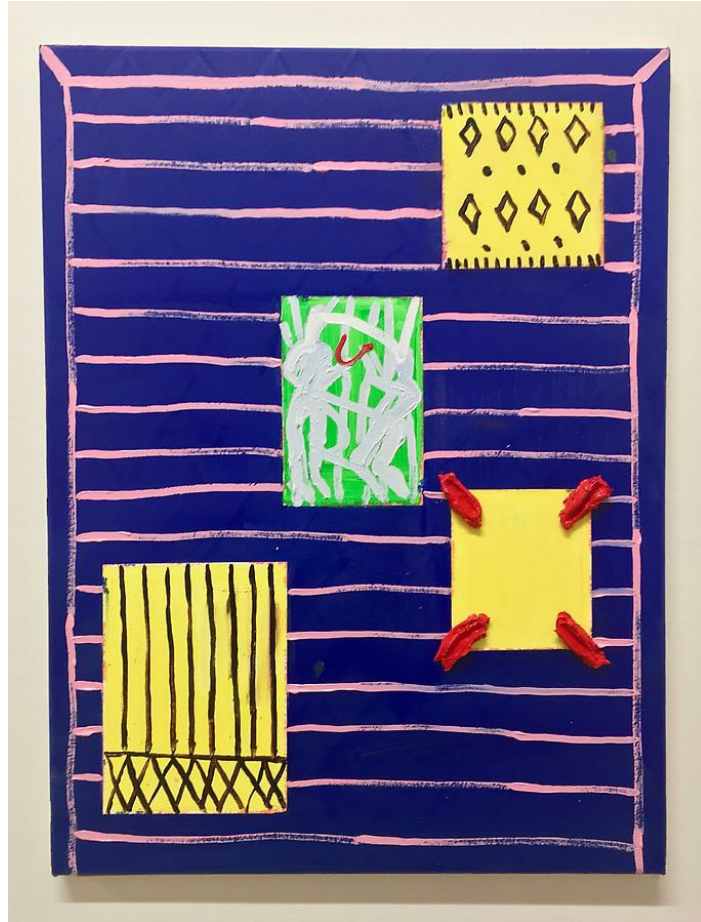
Jason Stopa The Gate , 2017 oil on canvas 24 x 18 in $2,800