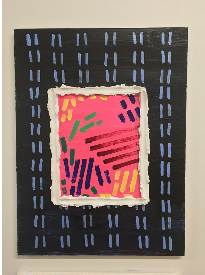
Jason Stopa Interior Waterfall , 2017 oil on canvas 24 x 18 in $2,800