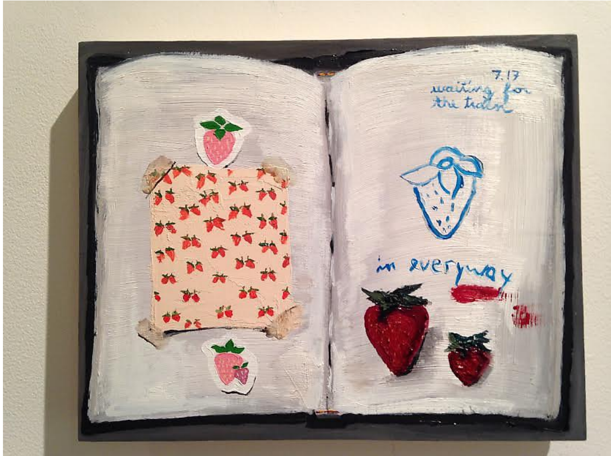
Michele Mirisola Waiting for the train , 2017 oil on panel 8 x 10 in $800