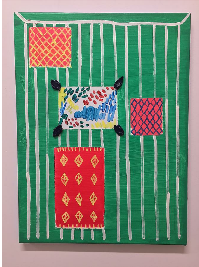
Jason Stopa Pictures at an Exhibition, 2017 oil on canvas 24 x 18 in $2,800