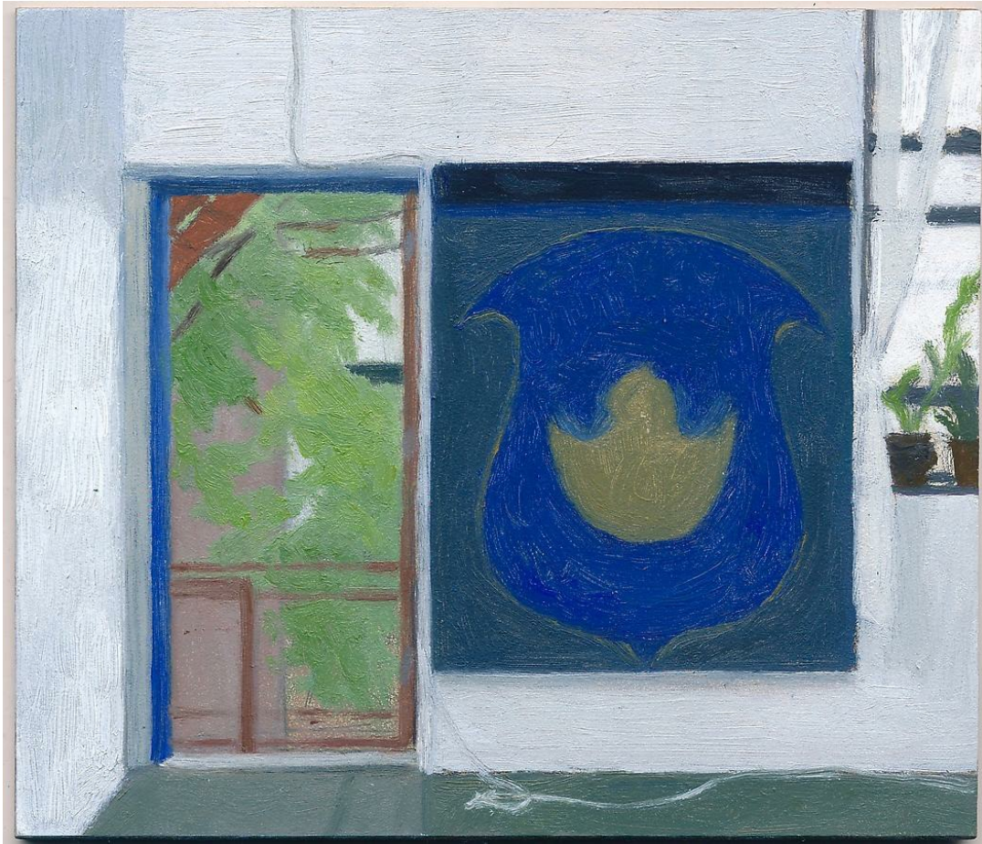
Eleanor Ray Travis's Studio , 2016 oil on panel 6 x 7 in $5,000