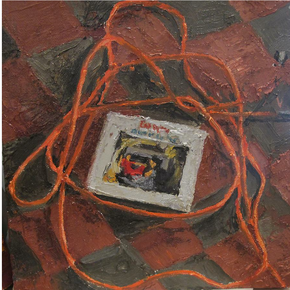
Gideon Bok Bringing It All Back Home / Sangram , 2013 Oil On Canvas 12 3/8 x 12 3/8 in $3,000