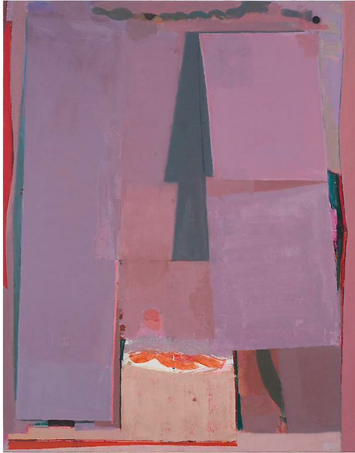
Sangram Majumdar Tucked , 2017 Oil on Linen 41 x 32 in $8,000