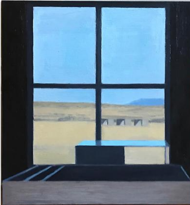
Eleanor Ray Marfa Window , 2017 oil on panel 8 1/2 x 8 in $5,500