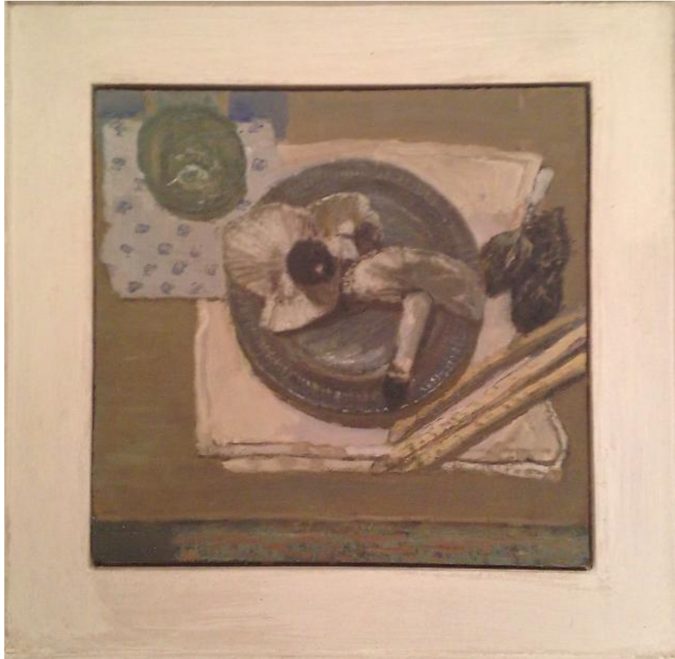
E.M. Saniga Mushrooms on a Pie Plate , 2017 oil on panel 12 x 12 in $8,000