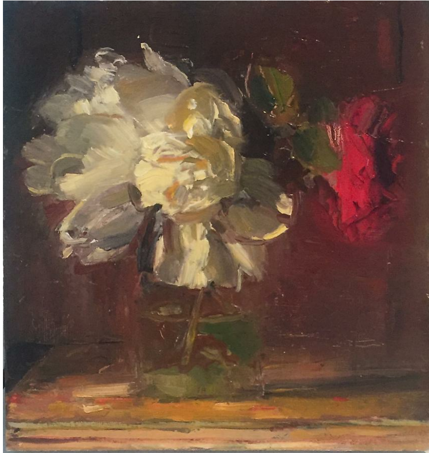
Katy Schneider Peony and Rose , 2017 oil on panel 8 x 7 1/2 in $1,200