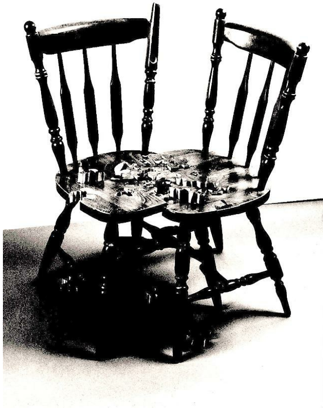
Jean Blackburn Twin , 2017 20 x 23 x 24 in $9,400