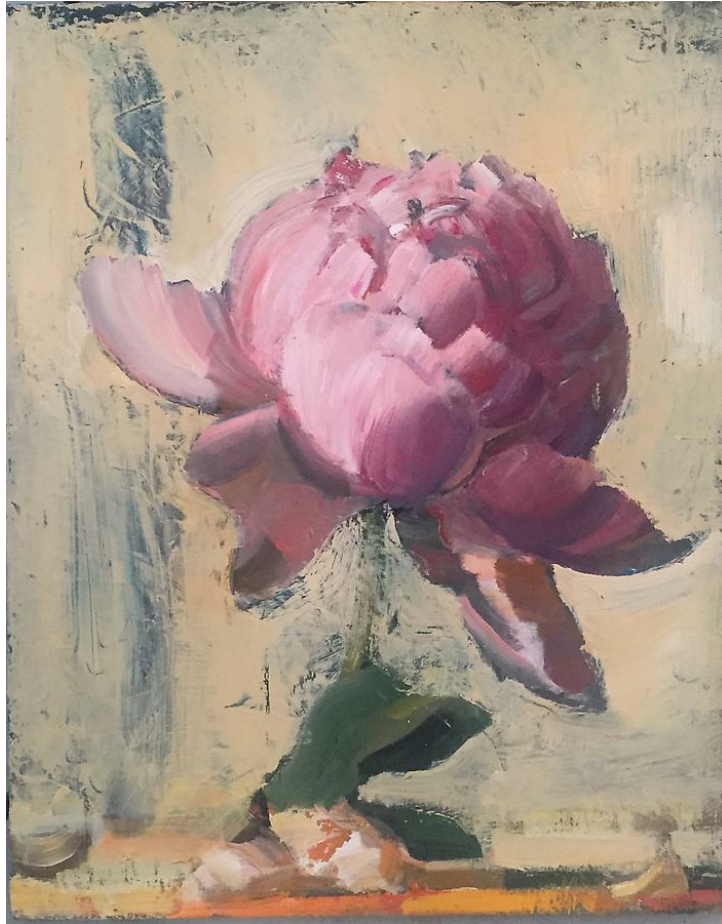
Katy Schneider Pink Peony on White , 2017 oil on panel 10 x 8 in $1,200