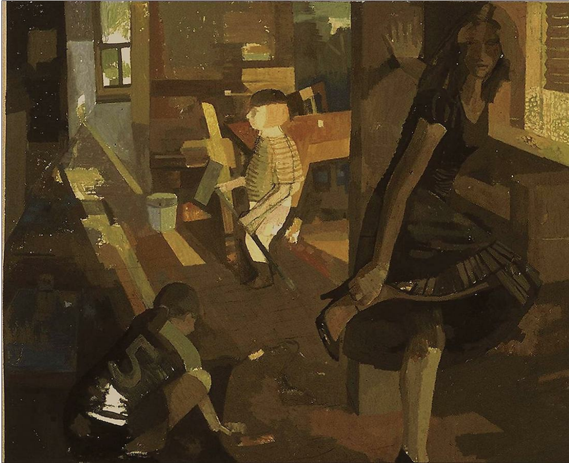
Susan Lichtman Cinderella , 2003 oil on linen 53 1/2 x 65 in $9,000