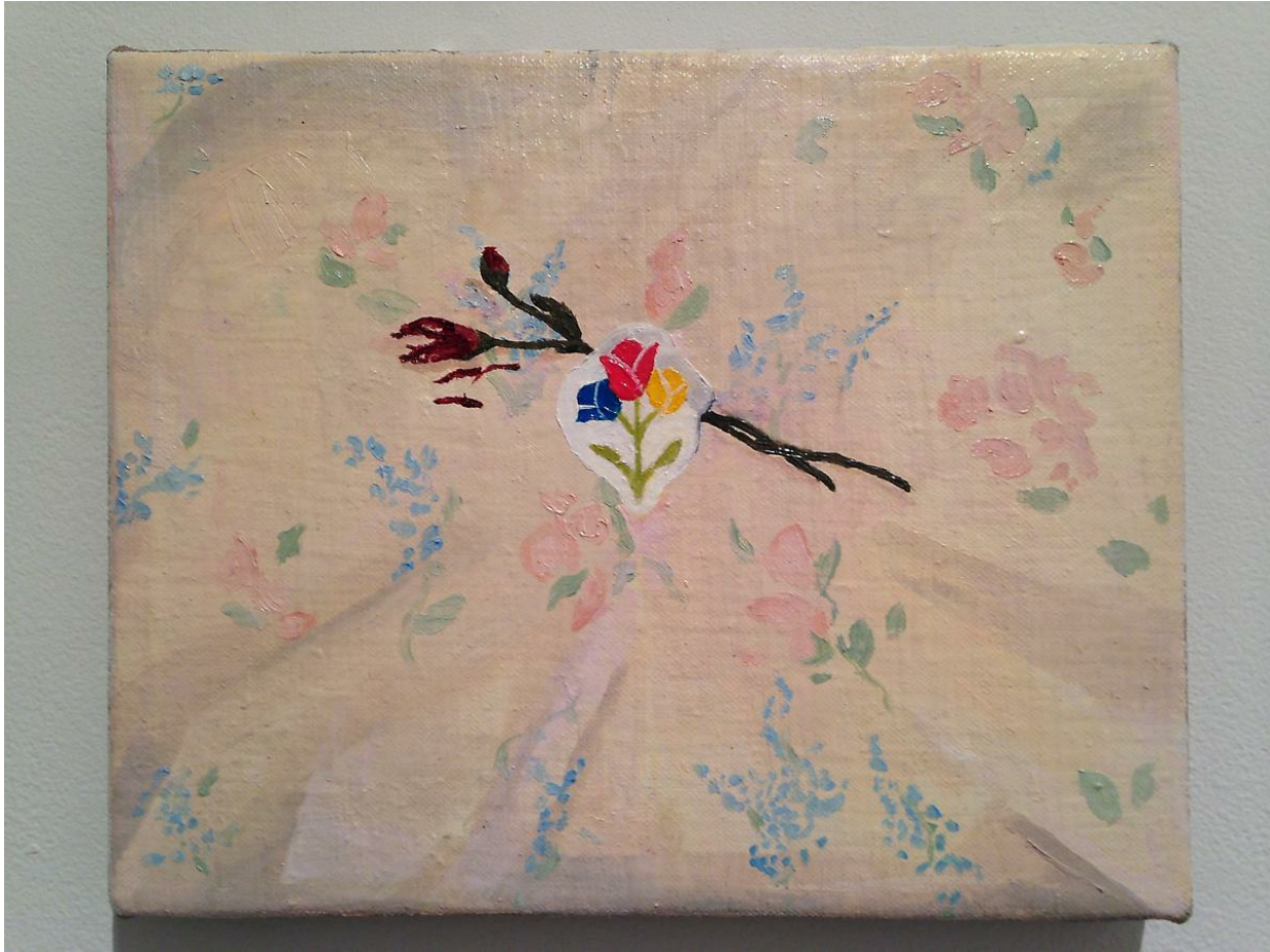
Michele Mirisola Boys Fingers Look The Same , 2017 oil on linen 8 x 10 in $800