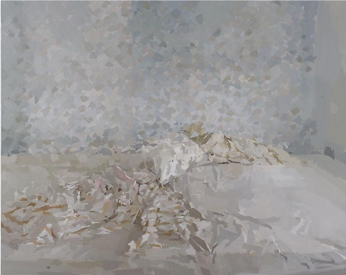
Stephanie Pierce Untitled (bed) , 2009 Oil on Canvas 40 x 50 in $7,000