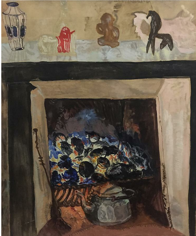
Anne Harvey Fireplace oil on linen 29 x 23 1/2 in $20,000