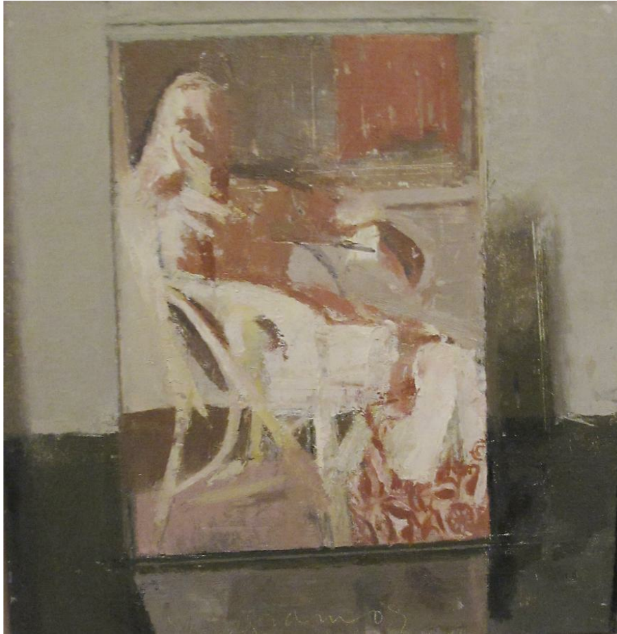
Sangram Majumdar Photograph , 2009 Oil On Panel 11 1/2 x 11 1/2 in $3,000