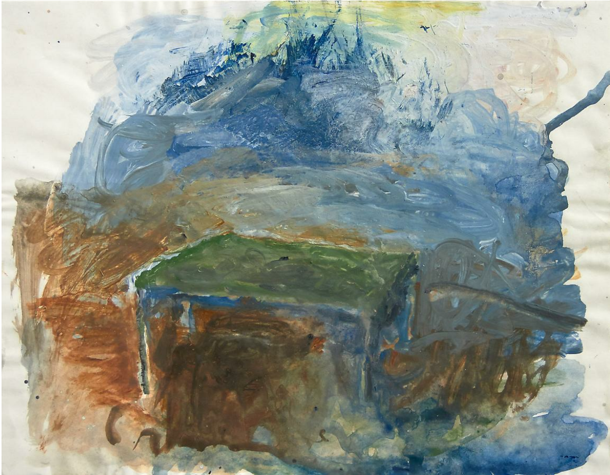
June Leaf Green Table , 1990s acrylic on paper 8 1/2 x 11 in $6,000