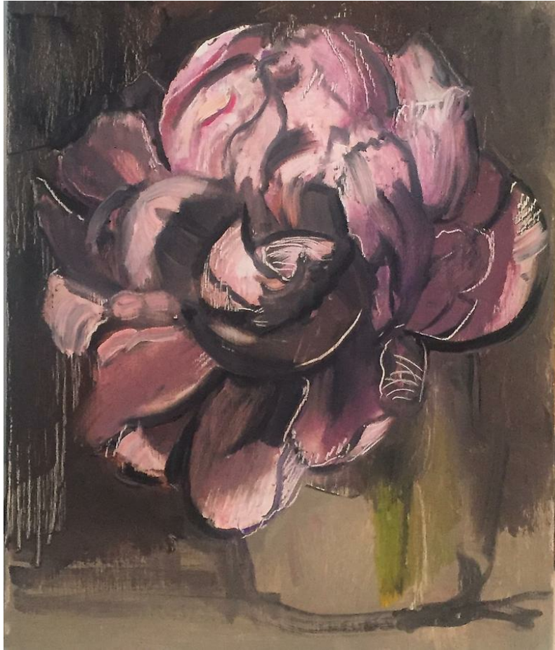
Katy Schneider Pink Peony on Black , 2017 oil on panel 9 1/8 x 7 1/2 in $1,200