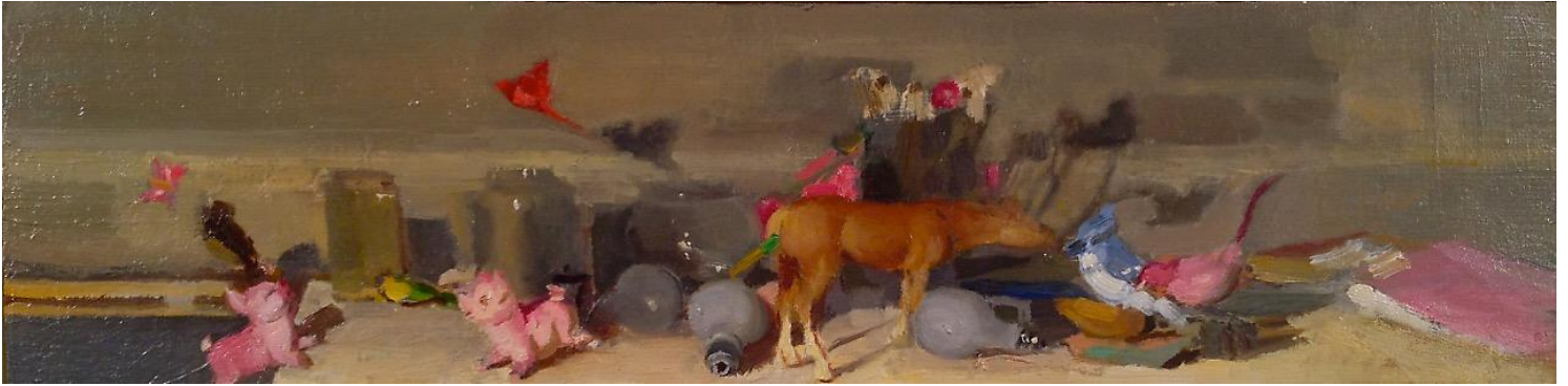
Katy Schneider Pigs, Horse, Lightbulbs oil on panel 3 1/2 x 14 in $3,200