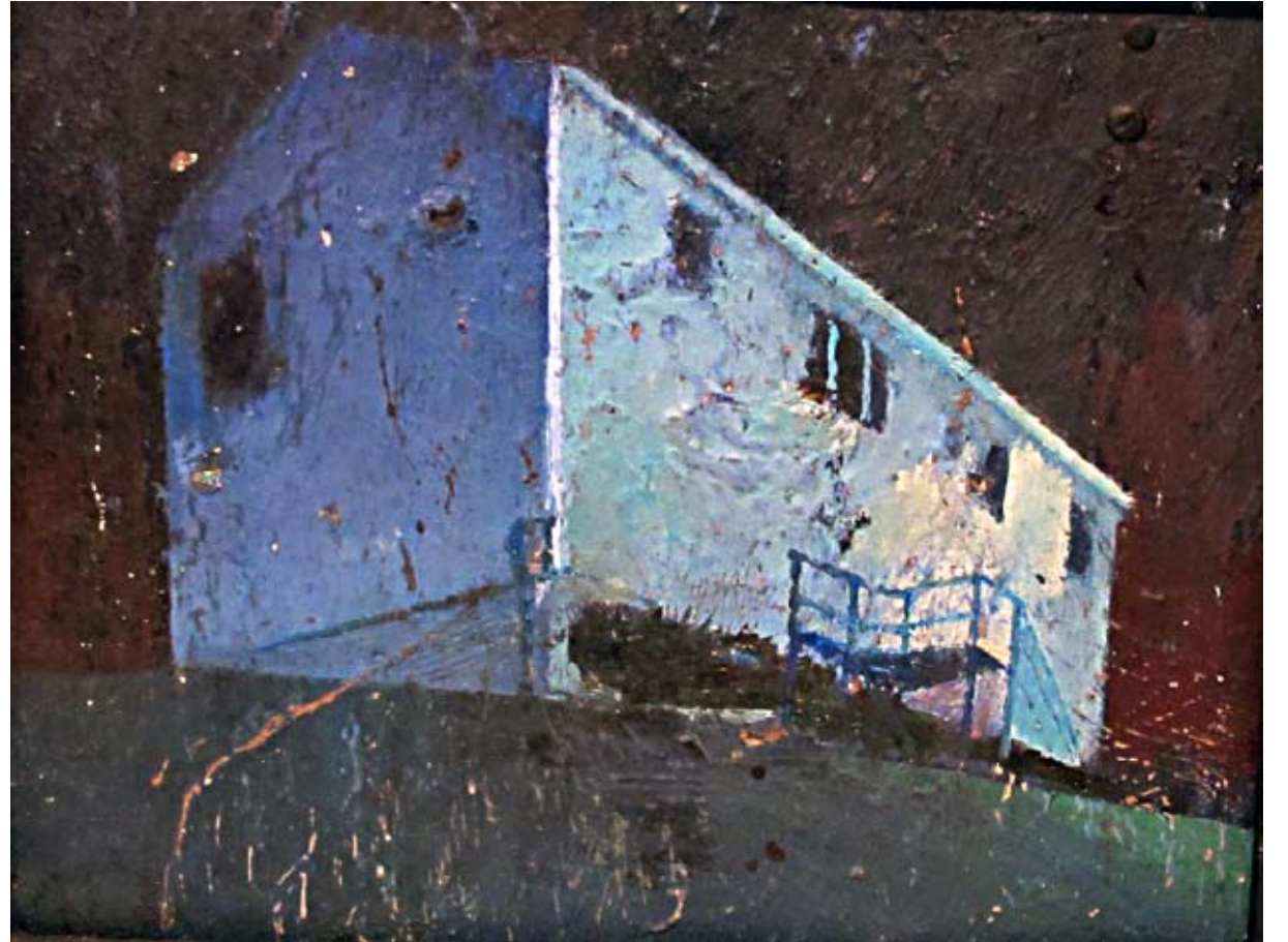
20) Palindromes, 2010, oil on paper mounted on board, 8" x 10"