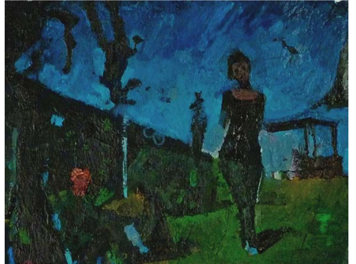
8) Pill Commercial, 2010, oil on paper mounted on board, 8x10 in