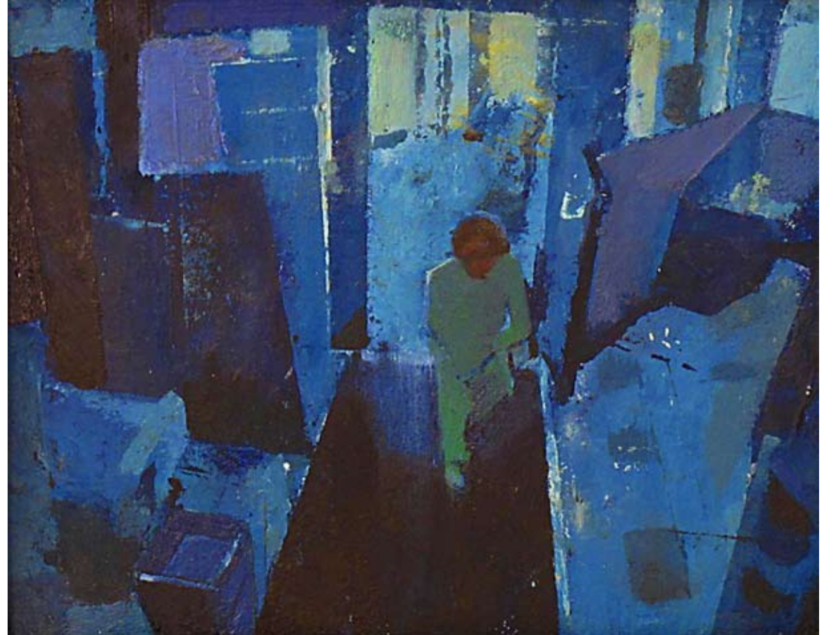
19) CVS 2010, oil on paper mounted on board, 8 x 10 in