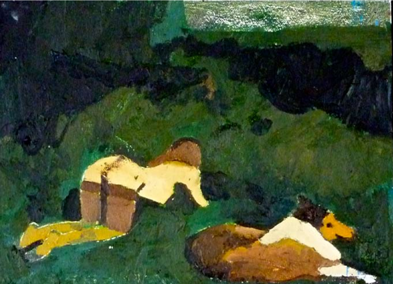
7) Lassie and Collie , 2010 , oil on paper mounted on board ,11x14 in