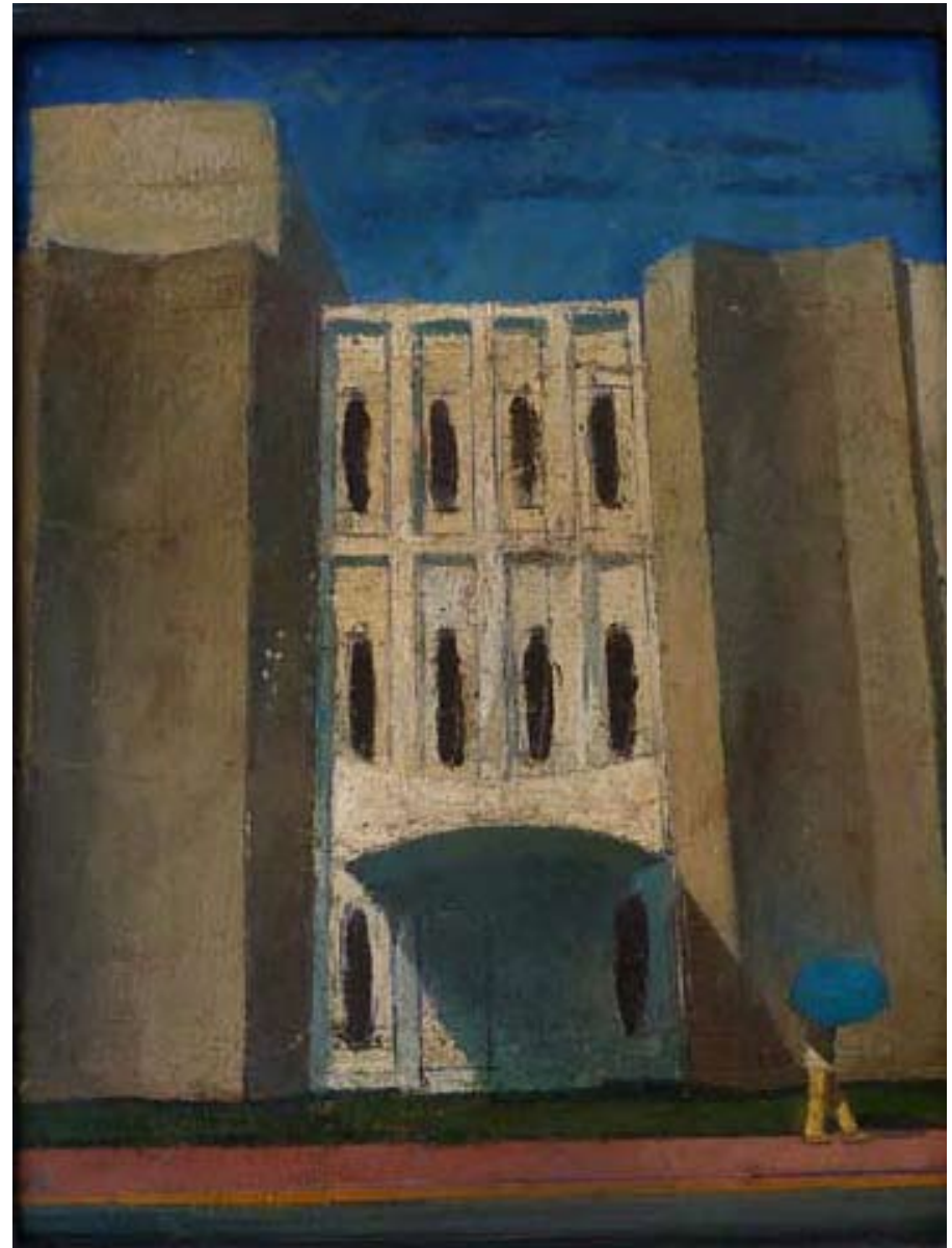
12) Sunshine Bank, 2010, paper mounted on panel, 11 x 14 in