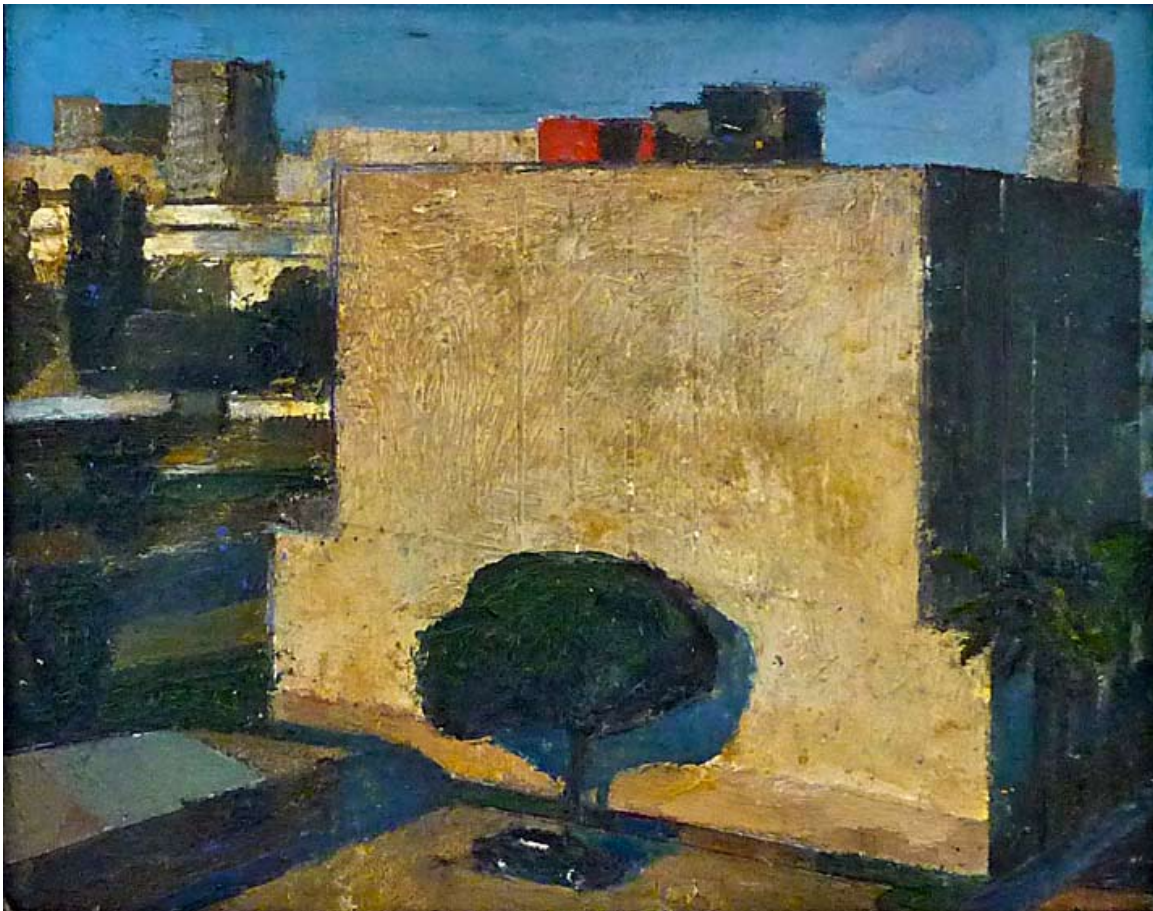
14) Lincoln Mall, 2010, paper mounted on panel, 8 x 10 in