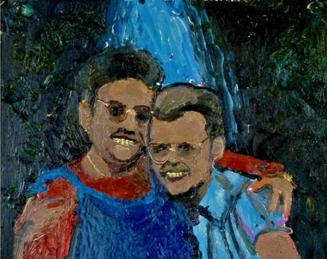
6) Jaime and Robin , 2010, oil on paper mounted on board, 8x10 in