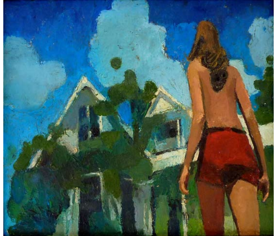
13) Woman Before House (Recurring Dream), 2010, paper mounted on panel, 10 x 12 in