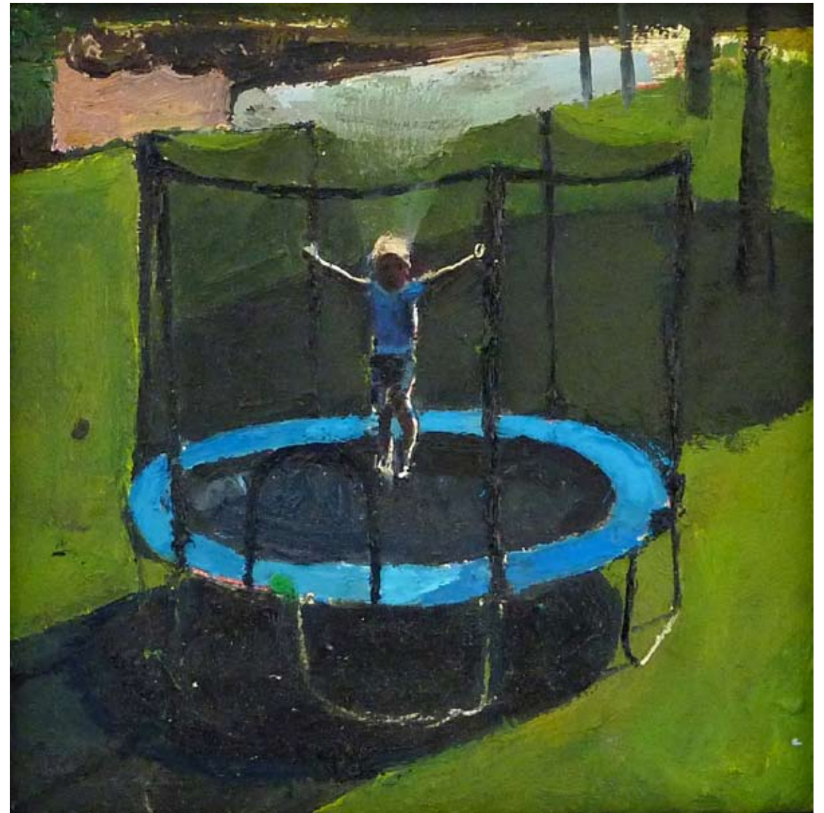
17) Child on Trampoline, 2010, paper mounted on panel, 10 x 10 in