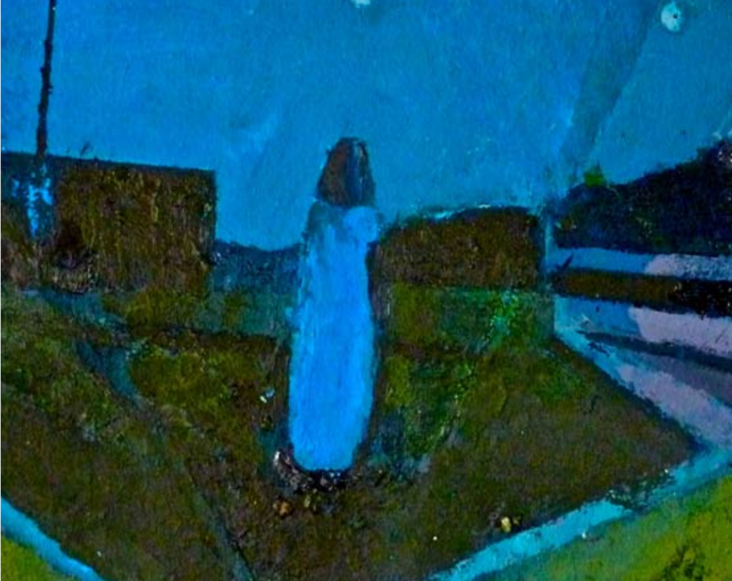
4) Forget About Jesus , 2010, oil on paper mounted on board, 8 x 10 in