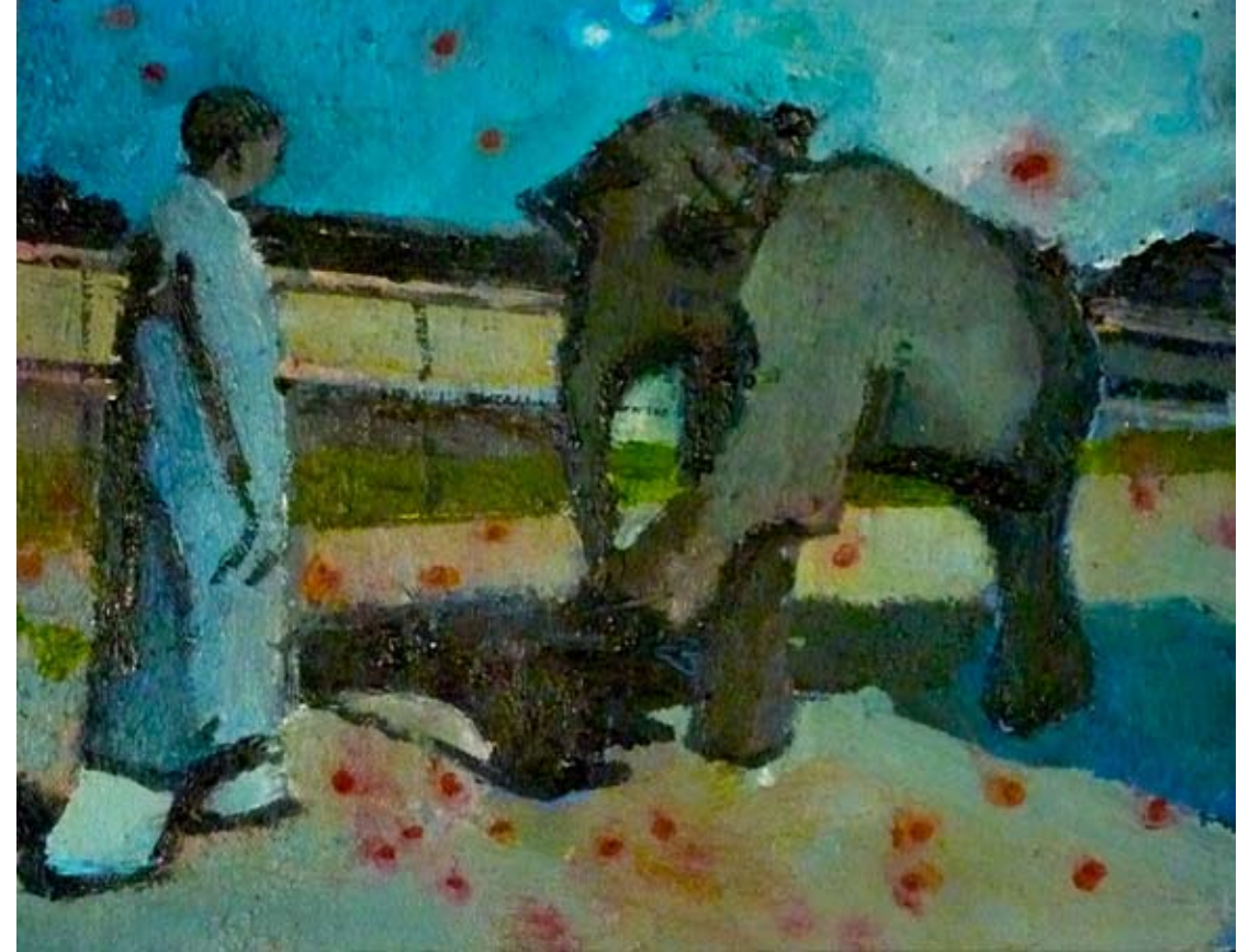
3) Elephant and Man , 2010, oil on canvas mounted on board, 8 x 10 in