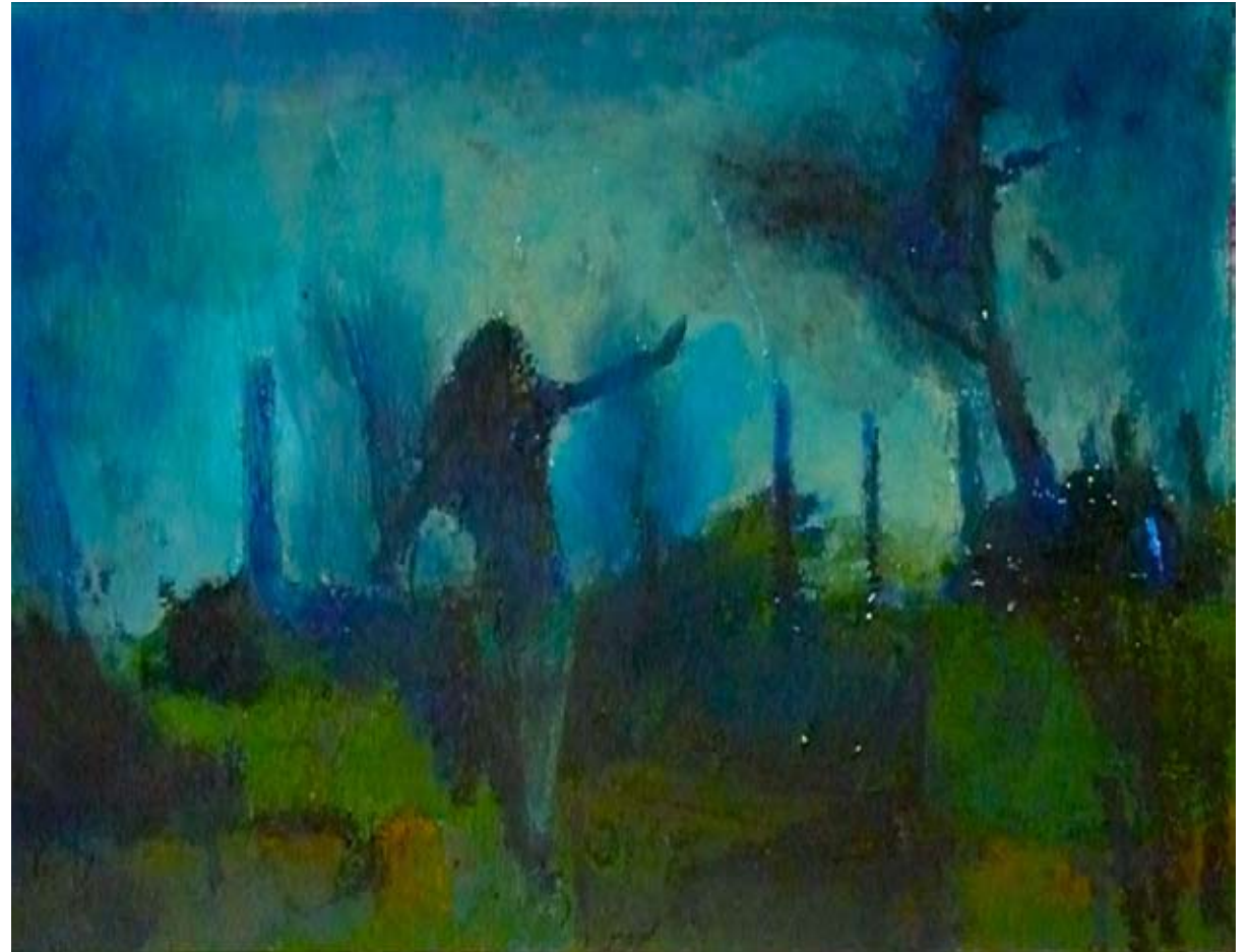
11) Woman and Woods, 2010, oil on paper mounted on board ,11x14 in