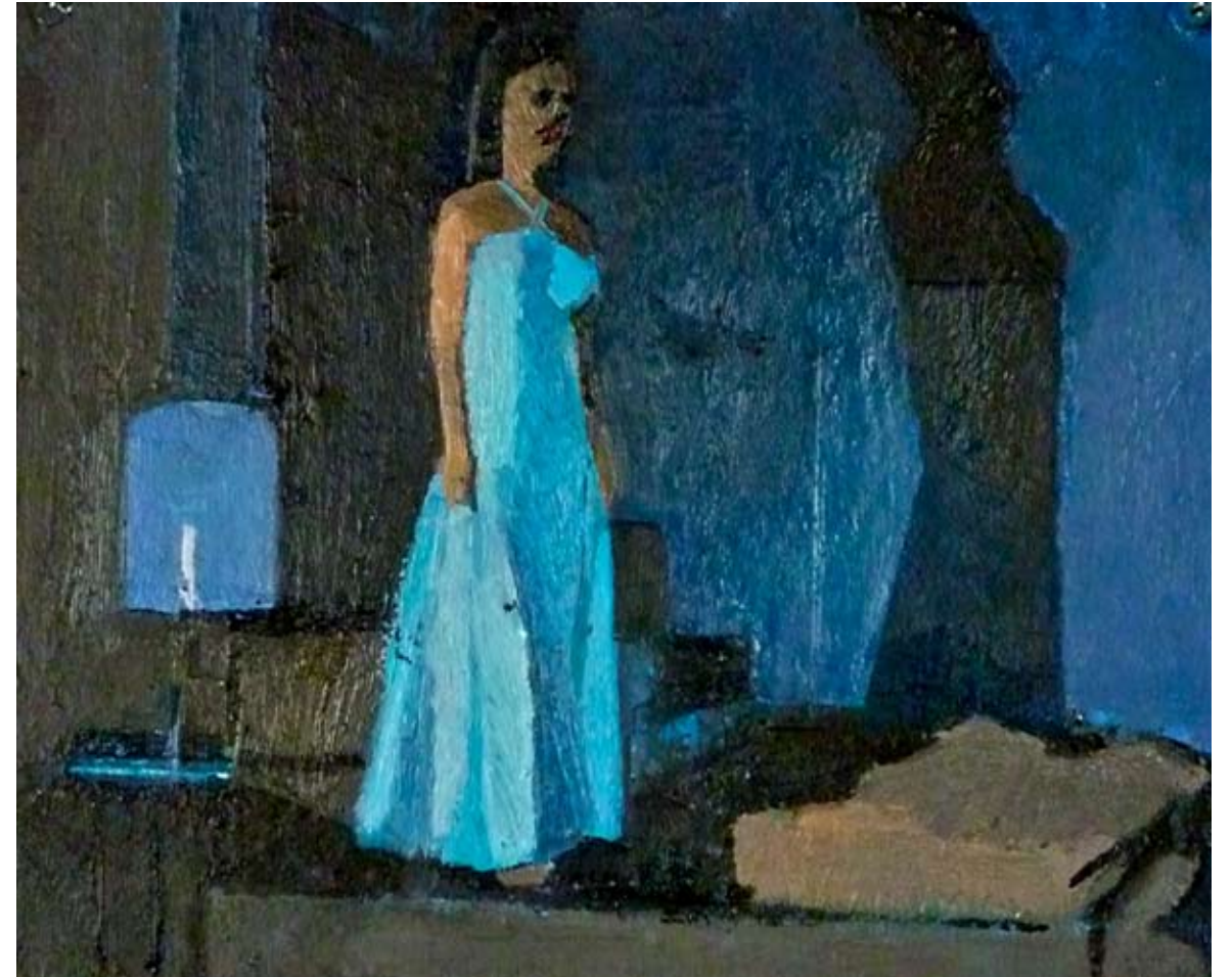
1) Elavil , 2010, oil on paper mounted on board, 8x10 in