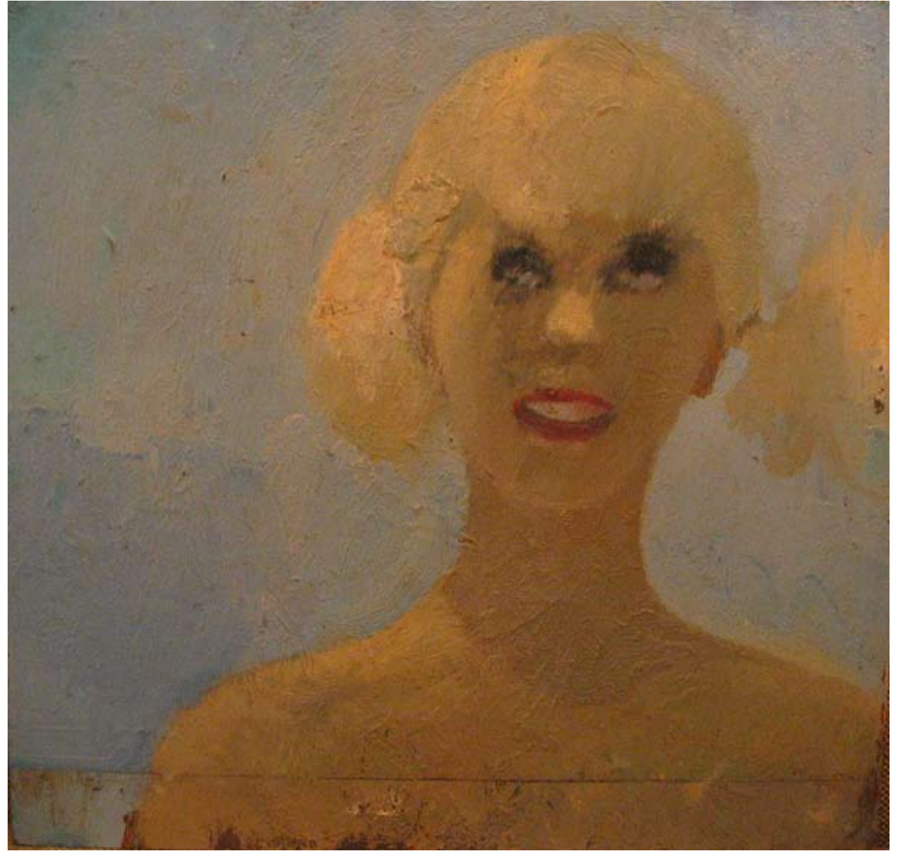
15) Cindy 1, oil on panel, 15 1/2 x 16 in