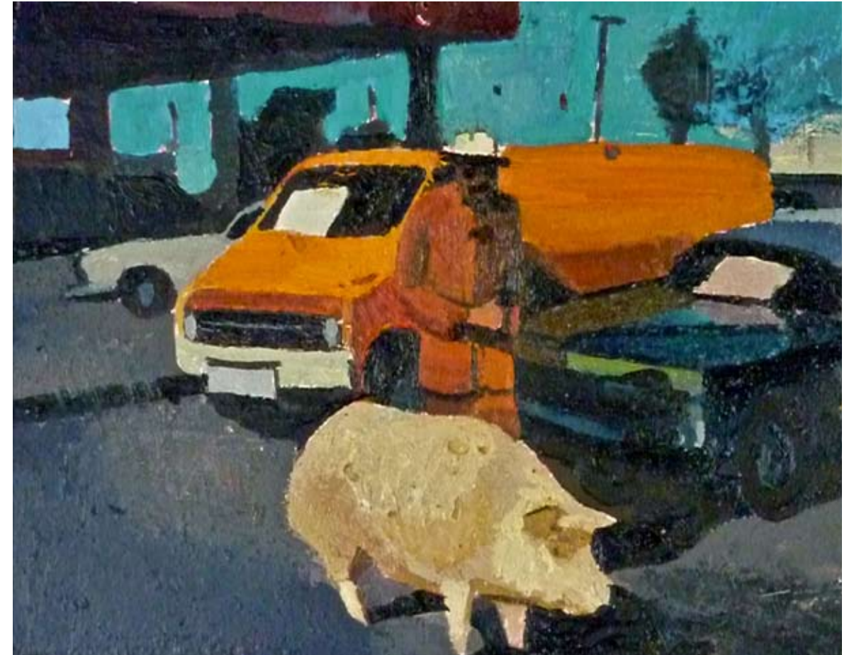
10) Swine, Man and Van , 2010 , oil on paper mounted on board, 8x10 in