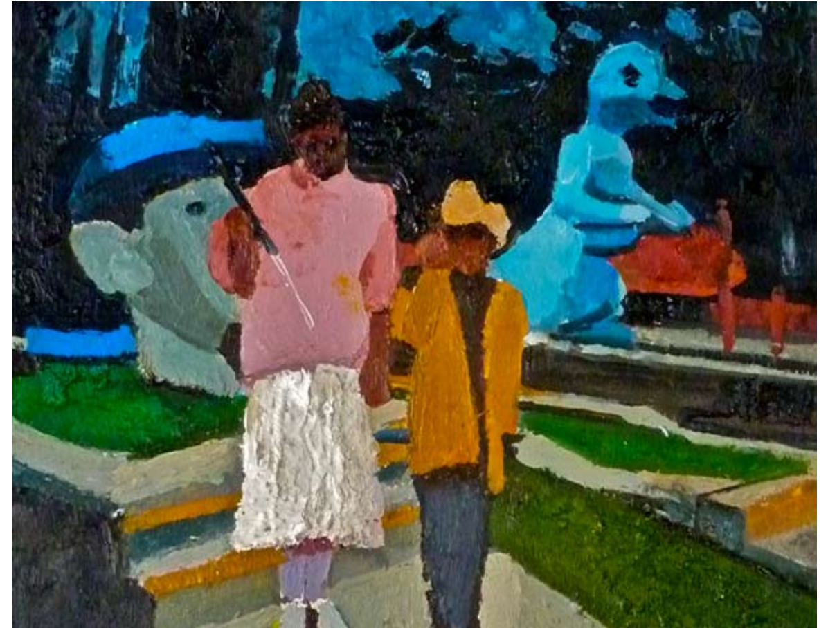
9) Putt-Putt, 2010, oil on paper mounted on board, 8 x 10 in