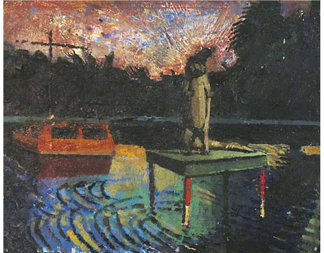
16) Homestead, 2010, oil on paper mounted on panel, 8 x 10 in