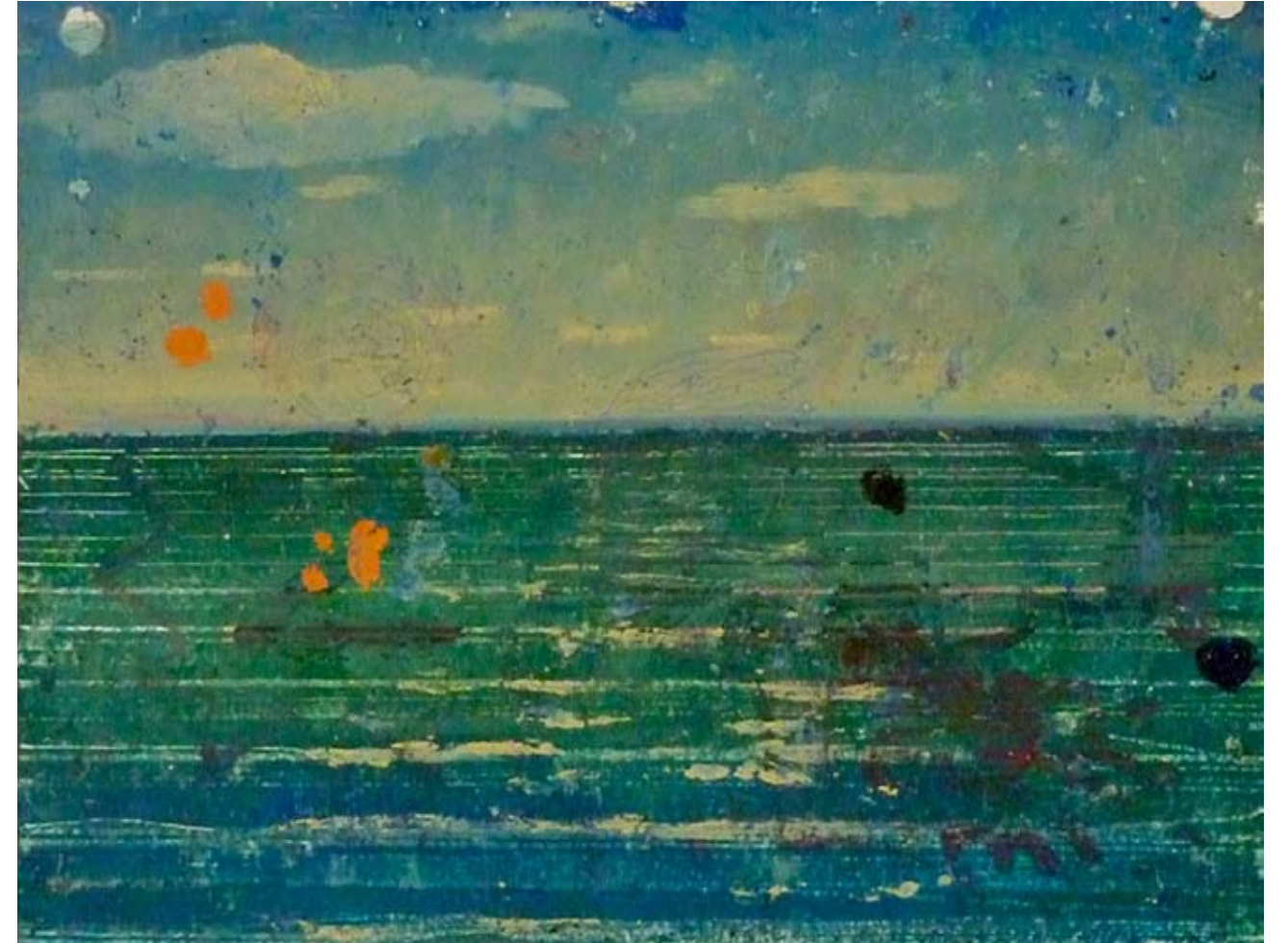
2) Atlantic #11 , 2010, oil on paper mounted on board, 8 x10 in