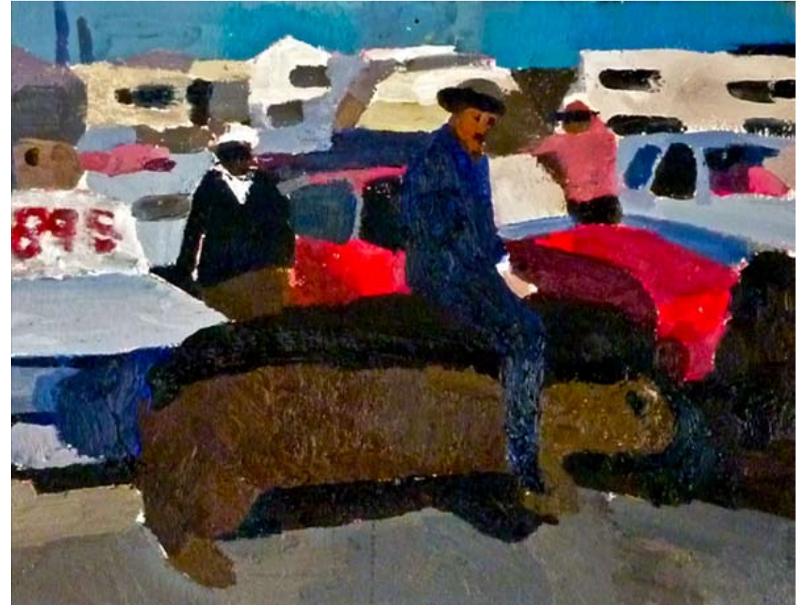
5) Hippo, Men, and Cars , 2010, oil on paper mounted on board, 8x10