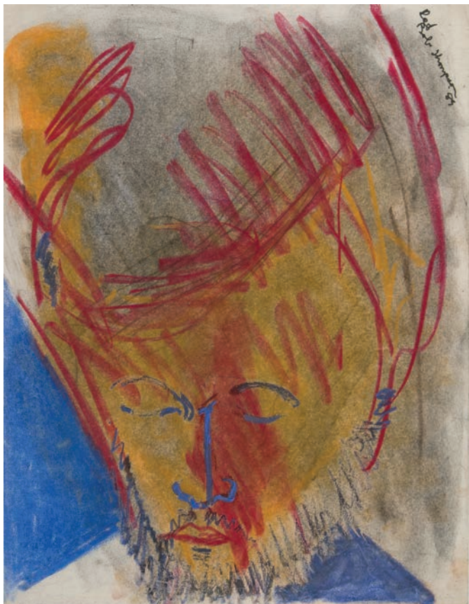
Christ's Sermon on the Mount ca. 1961-63, ink on paper 15 x 20 in.