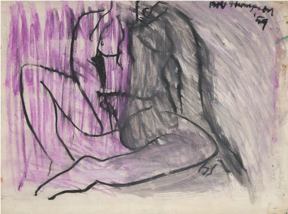
Untitled (Seated Nude) 1959, pastel on paper 17 ½ x 23 ¼ in.