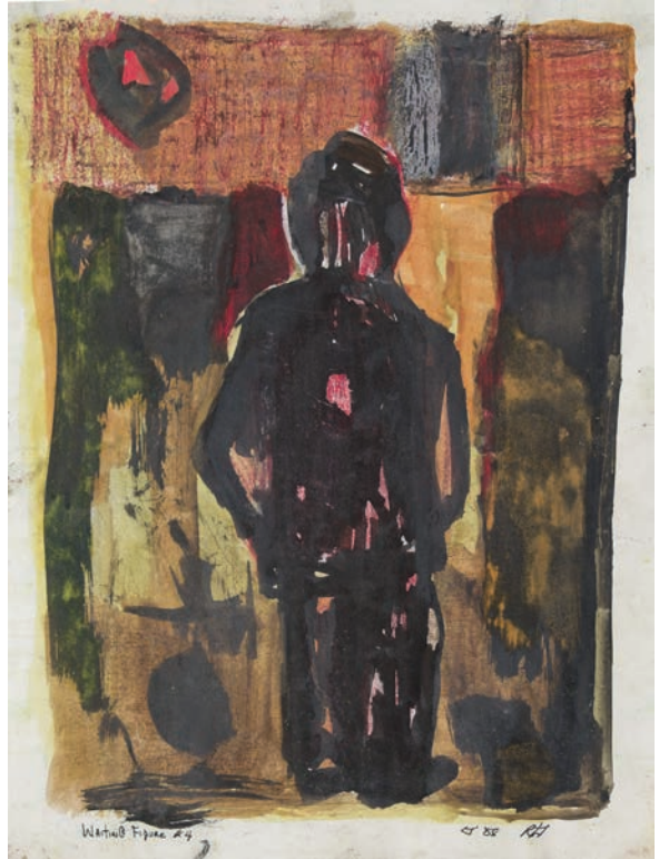
Waiting Figure # 4 1958, watercolor on paper 12 3/8 x 9 3/8 in.