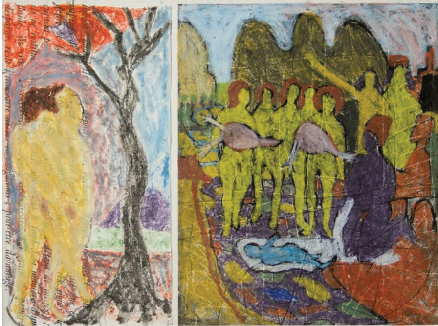
Study for Expulsion and Nativity 1963, pastel on paper 9 x 12 in.