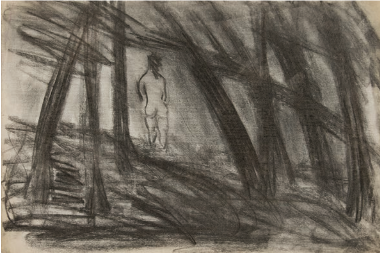
Untitled (Nude in Forest) ca. 1958, charcoal on paper 11 ⅞ x 17 ⅞ in.