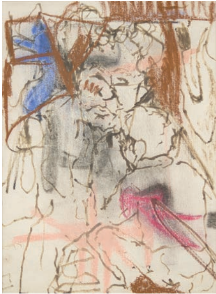
Untitled (Portrait) ca. 1958, pastel on paper 11 ½ x 8 ½ in.