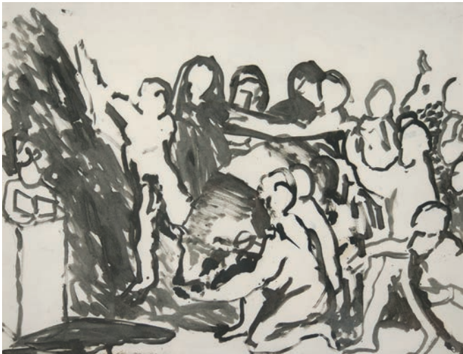
Entombment ca. 1961-63, ink on paper 15 x 20 in.