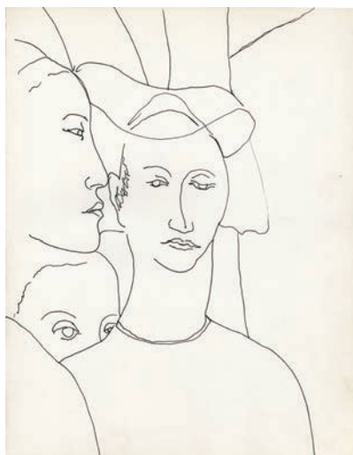
FAR LEFT: Portrait of Nina Simone, Provincetown 1965, ink on paper 23 ¼ x 18 in.