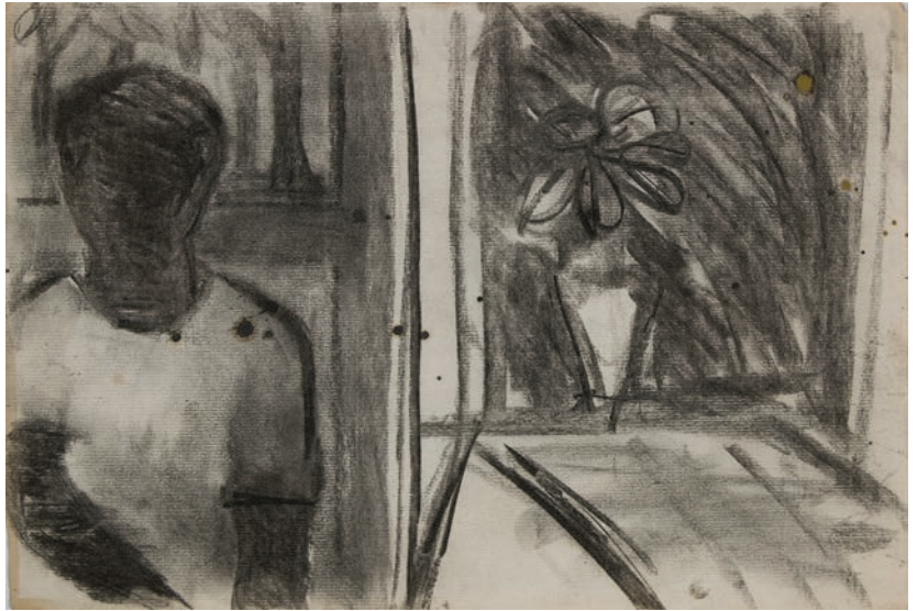
Untitled (Figure & Still Life) ca. 1958 charcoal and gold paint on paper 11 7/8 x 17 5/8 in.