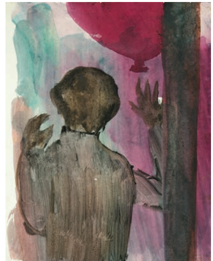
Untitled (Figure with Balloon) ca. 1958, watercolor on paper 13 1/2 x 10 3/8 in.