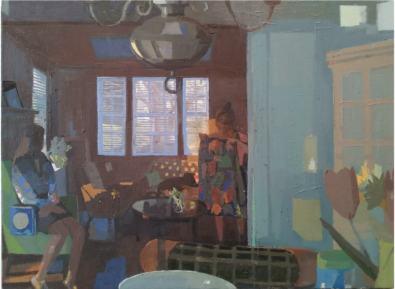
Susan Lichtman Floral Jacket , 2017 oil on linen 22 x 30 in $4,000