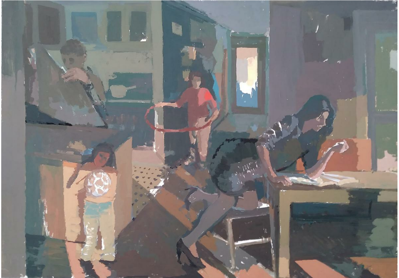
Susan Lichtman The Scholar's Family , 2004 goache on paper 14 x 20 in $800