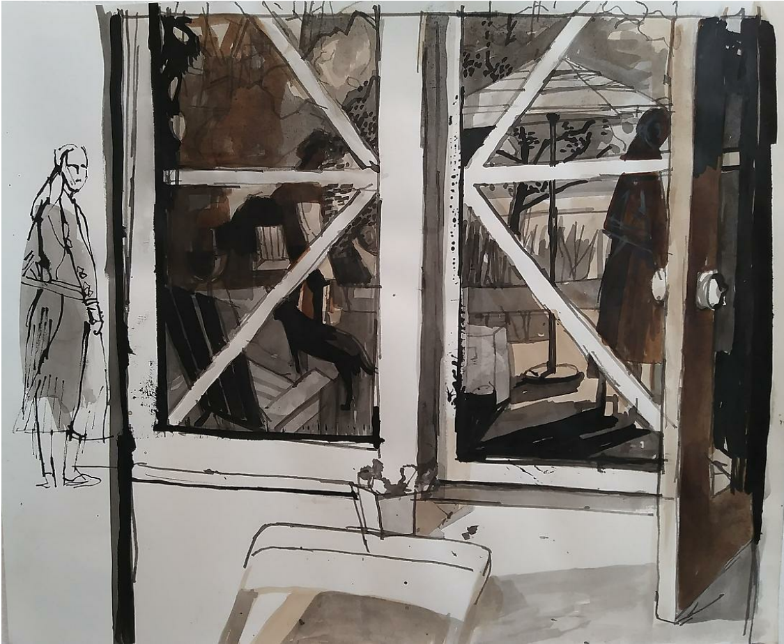
Susan Lichtman Untitled Woman Looking , 2016 ink on paper 11 x 13 1/2 in $500