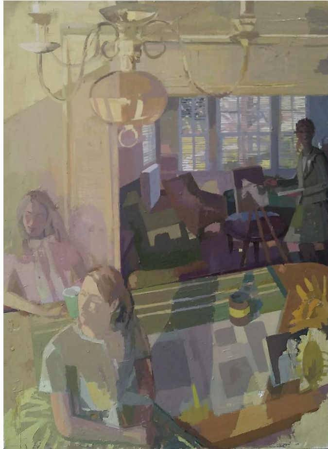
Susan Lichtman Vanguest House, 2017 oil on linen 30 x 22 in $4,000