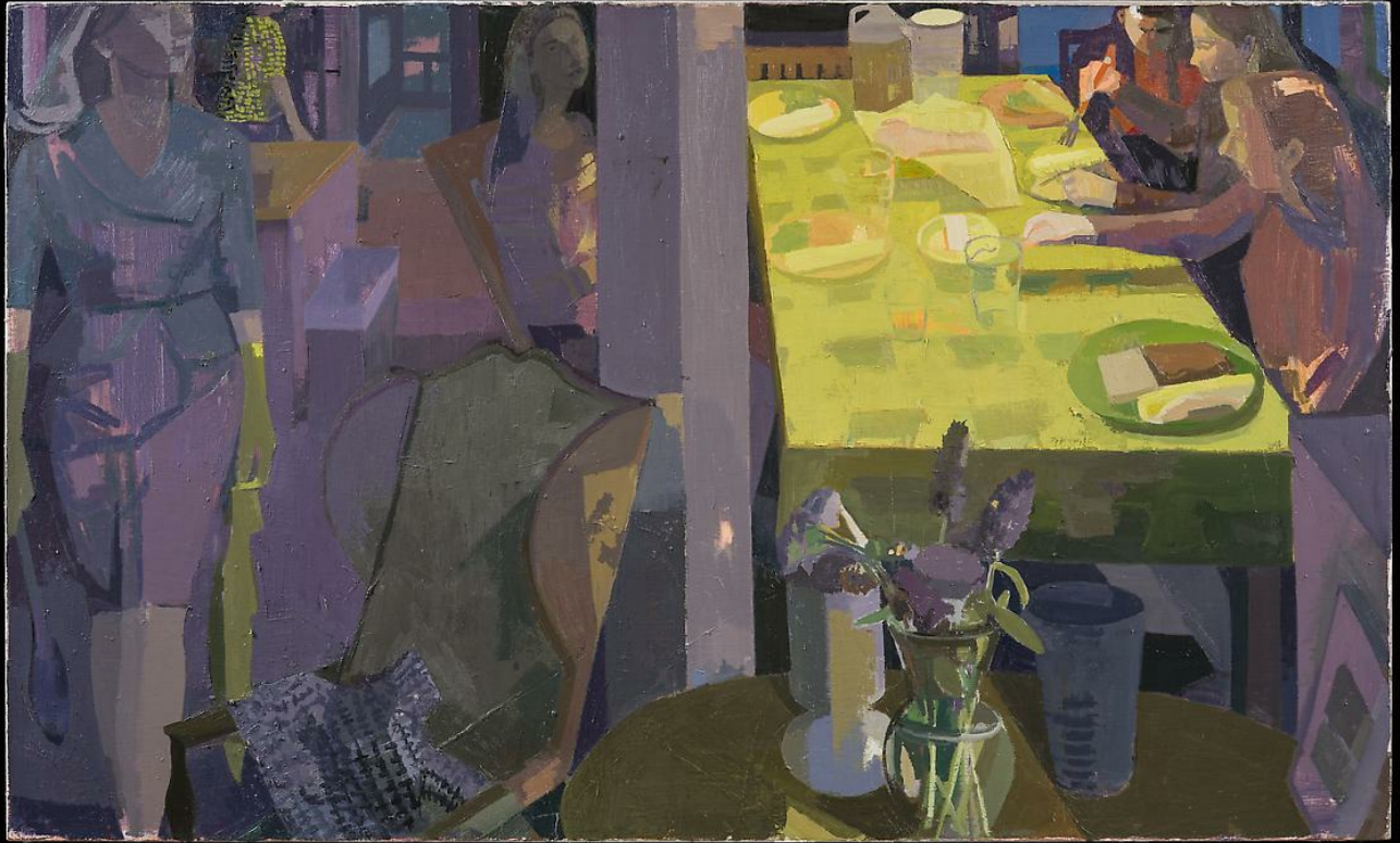
Susan Lichtman Equinox Meal , 2016 oil on linen 40 x 66 in $9,000