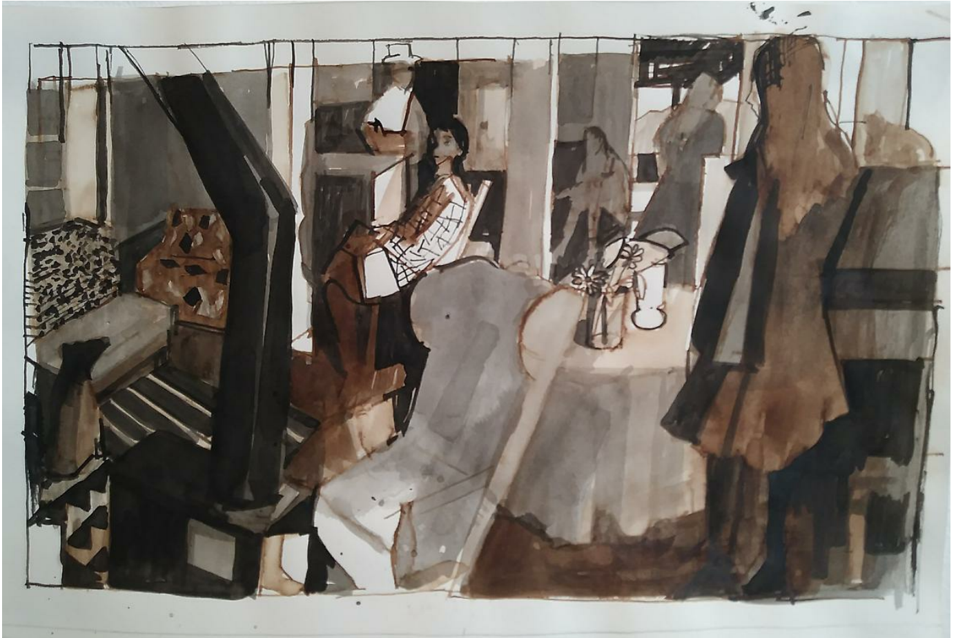
Susan Lichtman Rosa leaves study , 2016 Ink on paper 8 1/2 x 13 in $500