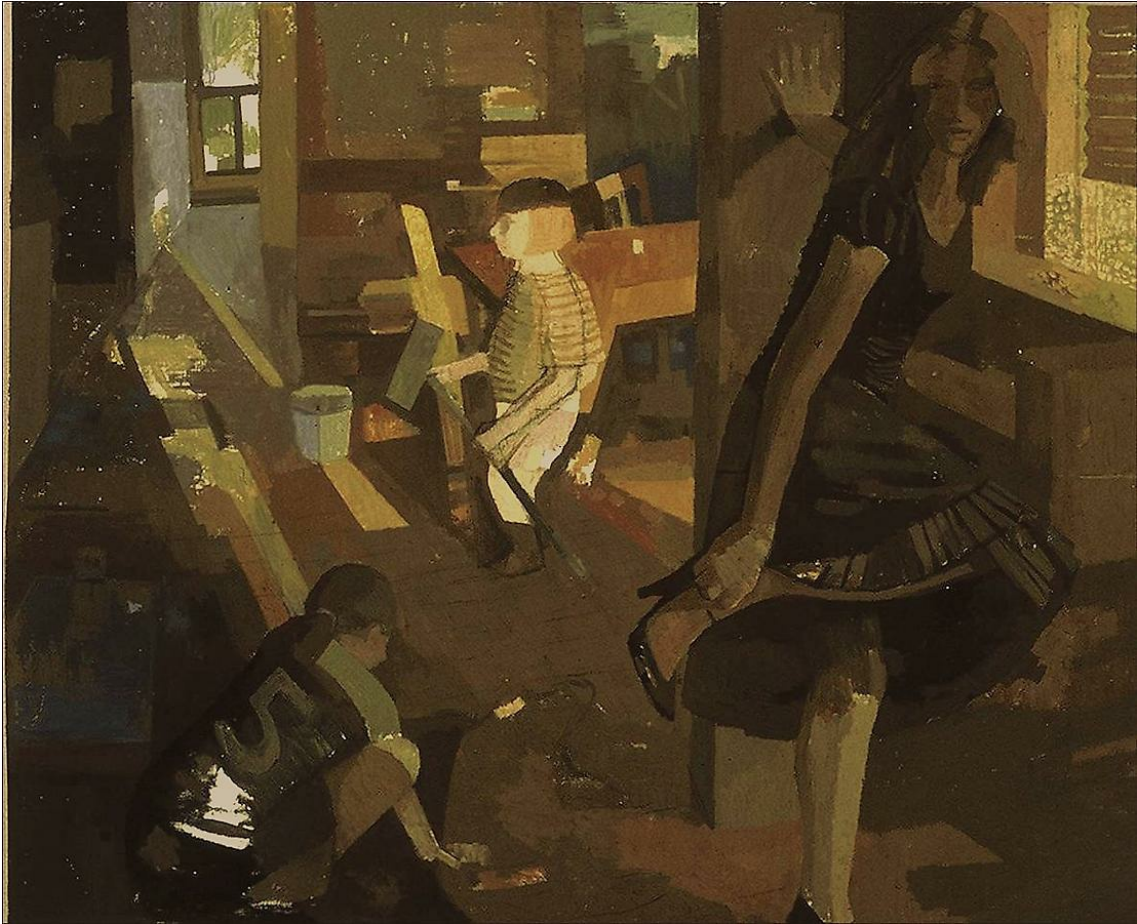
Susan Lichtman Cinderella , 2003 oil on linen 53 1/2 x 65 in $9,000