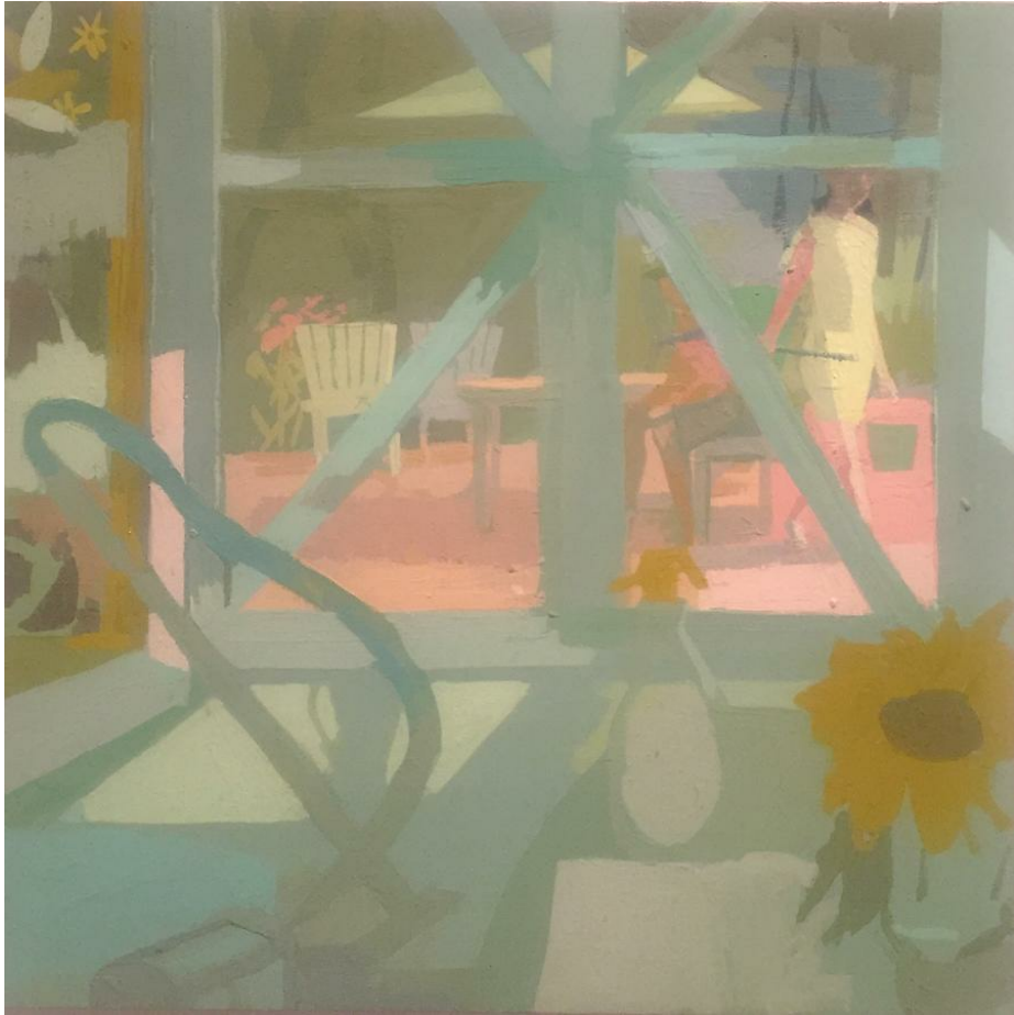
Susan Lichtman Small Clean Green Studio , 2016 oil on panel 12 x 12 in $2,000