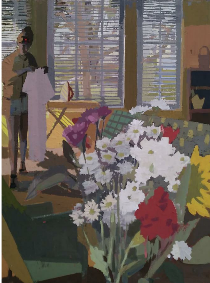
Susan Lichtman Flowers and Iron, 2017 oil on panel 12 x 9 in $2,000