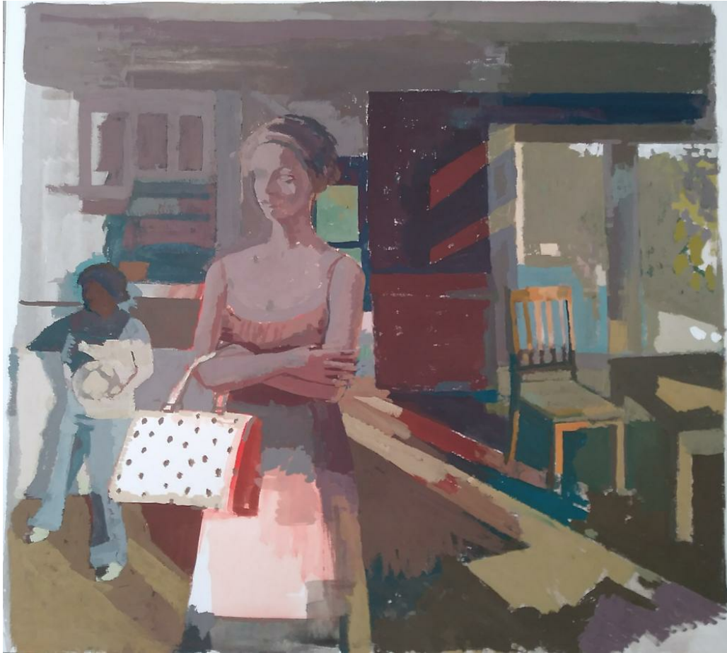
Susan Lichtman Spotted Purse , 2006 goache on paper 14 1/4 x 16 in $800