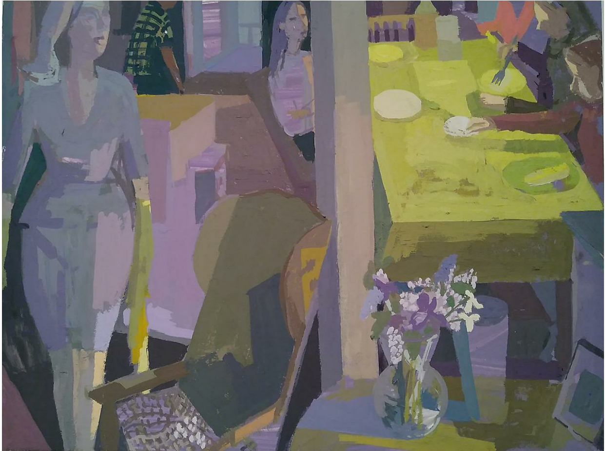
Susan Lichtman Equinox Meal Study , 2016 Oil on masonite 9 x 12 in $2,000