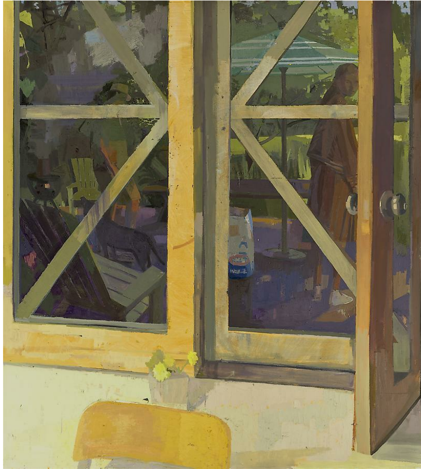
Susan Lichtman Cookout , 2016 oil on linen 64 x 58 in $9,000