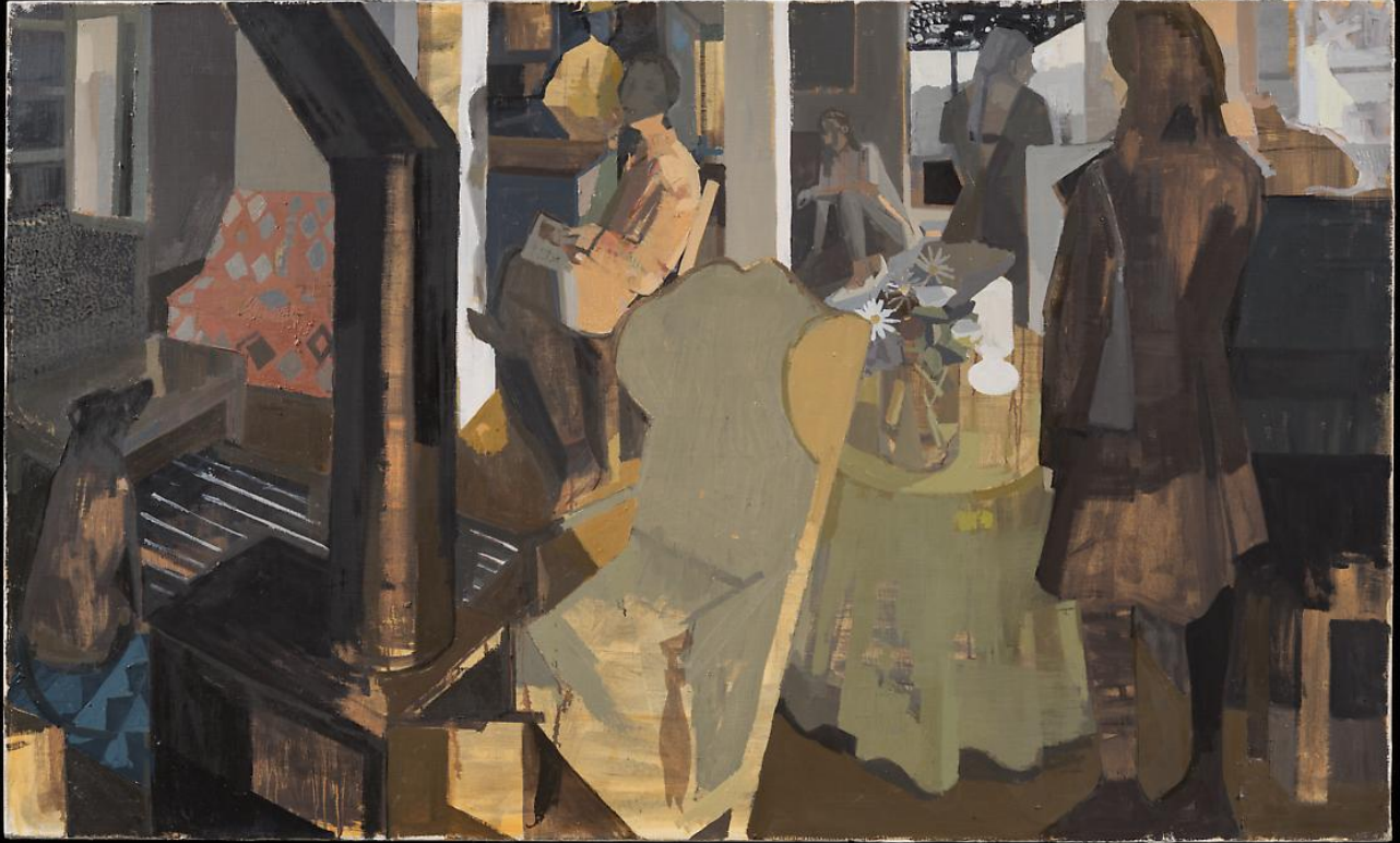
Susan Lichtman Rosa Moves Out , 2016 oil on linen 40 x 66 in $9,000