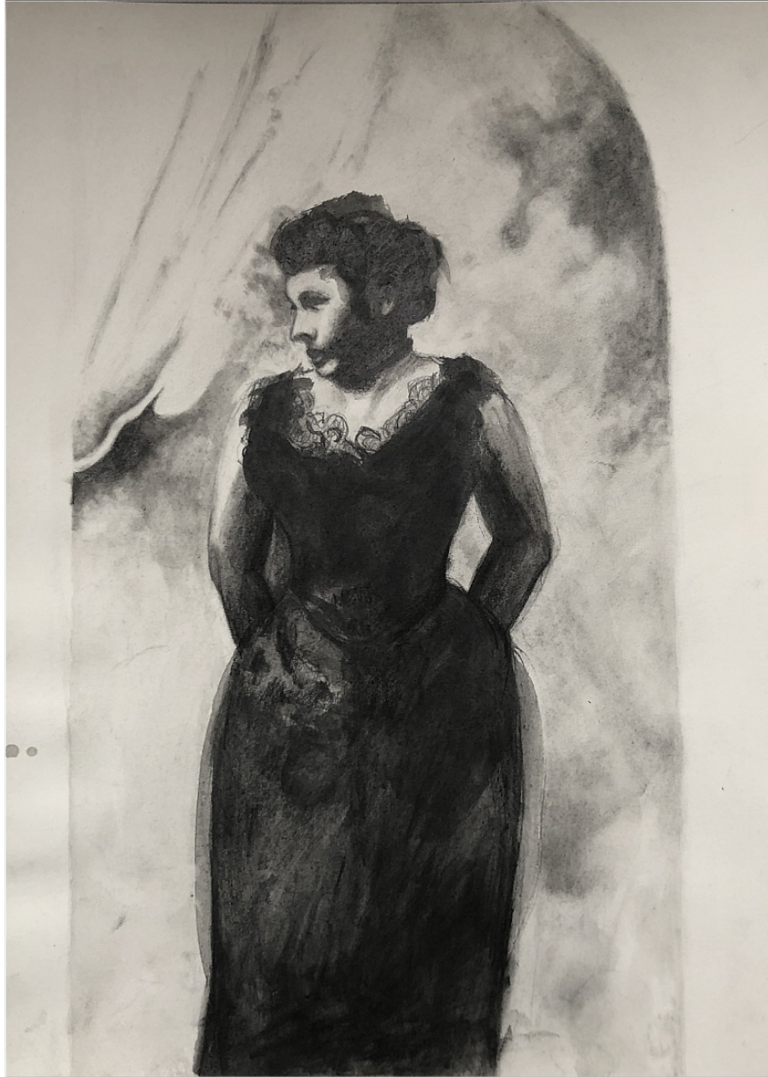
Michele Zalopany Hawaiian Lady , 2017 water color on paper 14h x 10w in