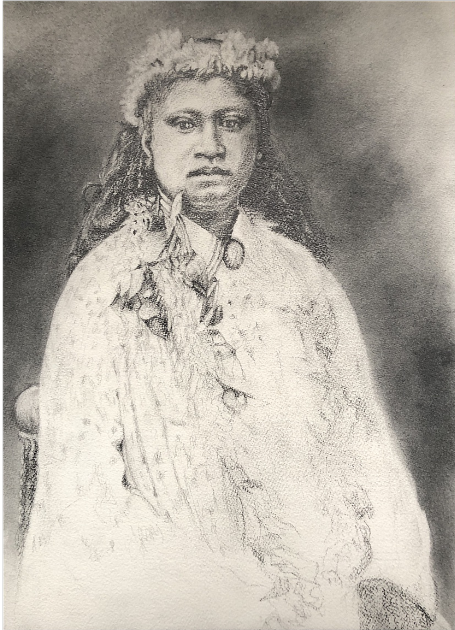
Michele Zalopany Wahine with Lei I , 2017 graphite on paper 14h x 10w in