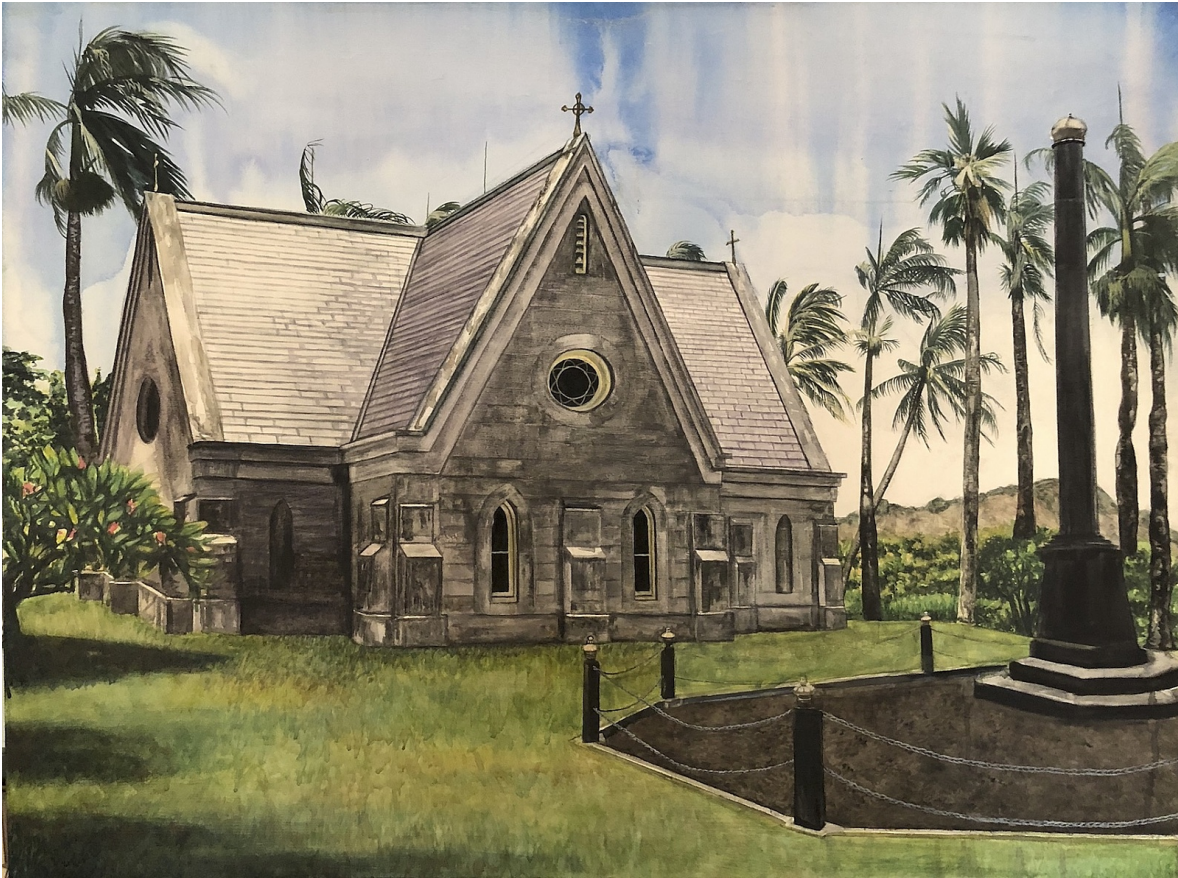
Michele Zalopany Mauna 'ala , 2013 water color on canvas 36h x 48w in