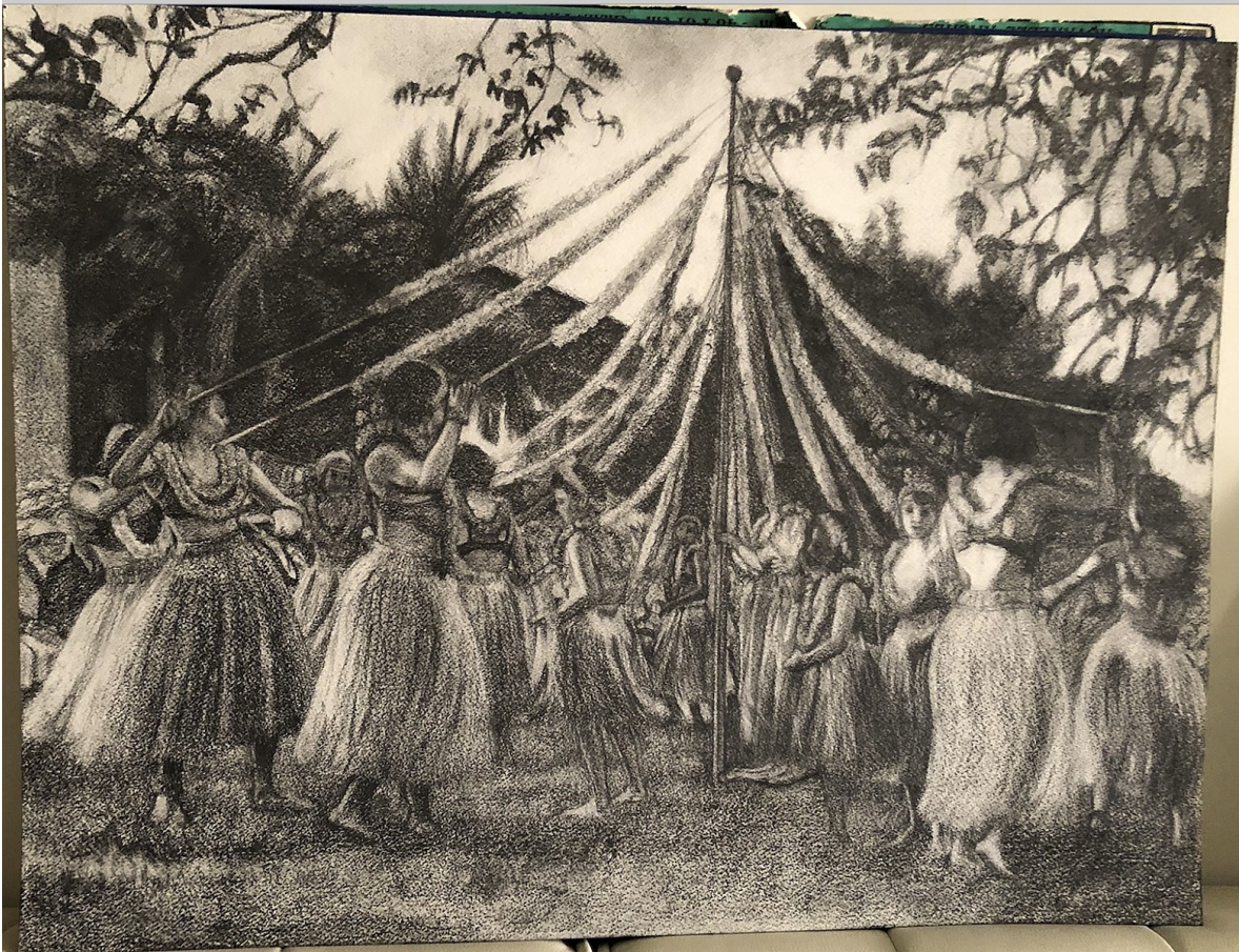
Michele Zalopany Maypole , 2018 graphite on paper 14h x 10w in