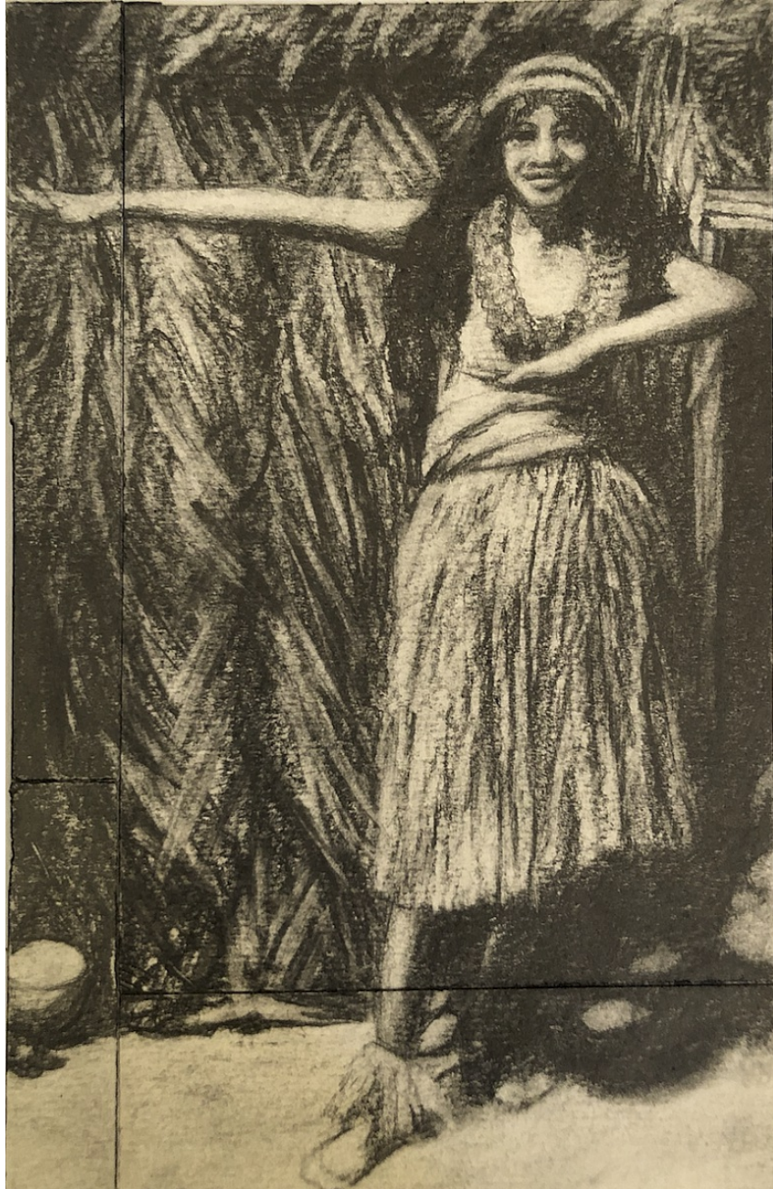
Michele Zalopany Dancer with a Smile , 2019 graphite on paper 7 1/4h x 4 1/2w in