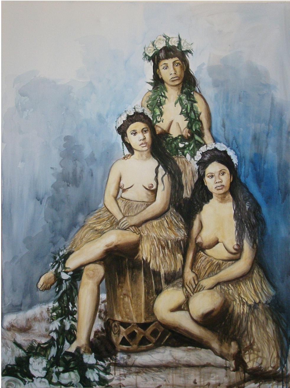
Michele Zalopany Seated Dancers , 2010 water color on canvas 50h x 38w in