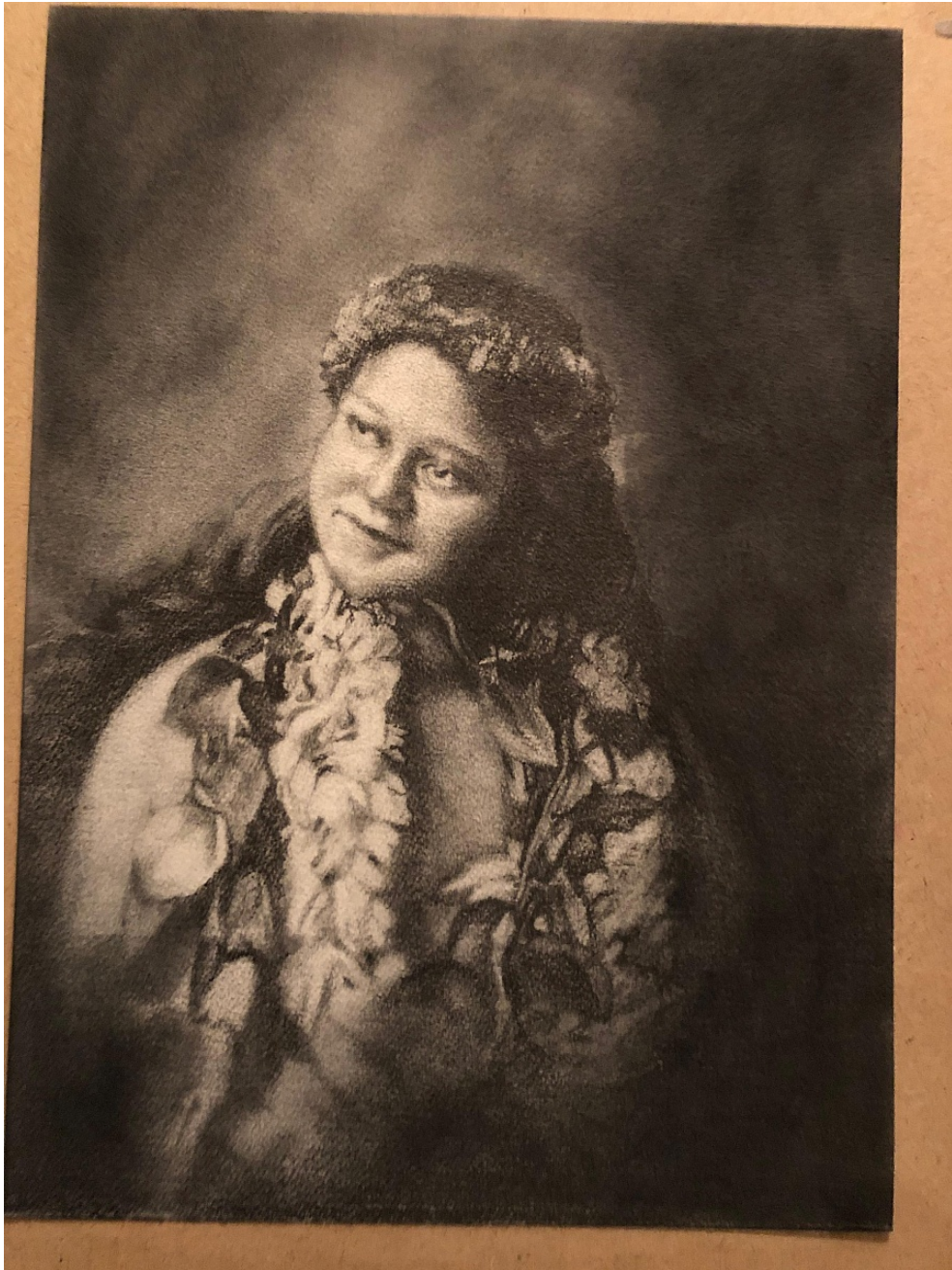
Michele Zalopany Wahine II , 2019 graphite on paper 14h x 10w in