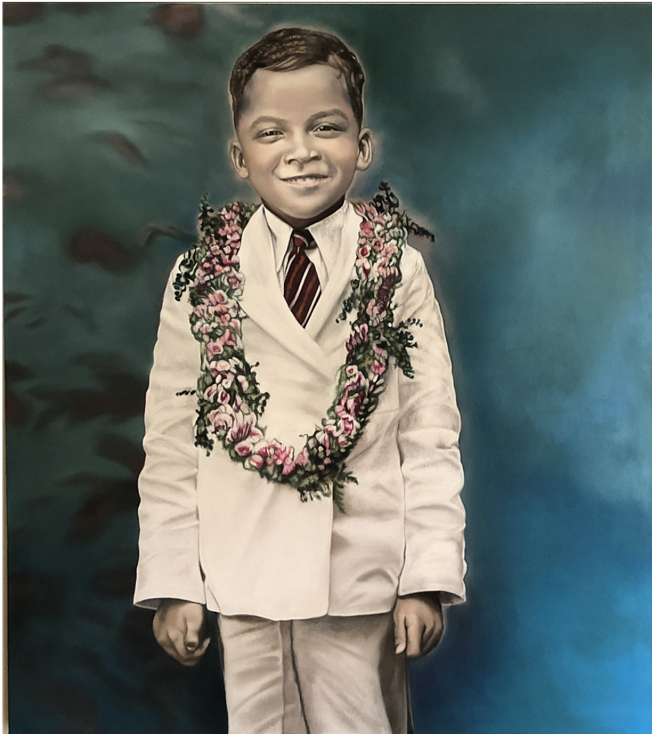
Michele Zalopany HRZ , 2019 pastel on canvas 68h x 60 1/2w in