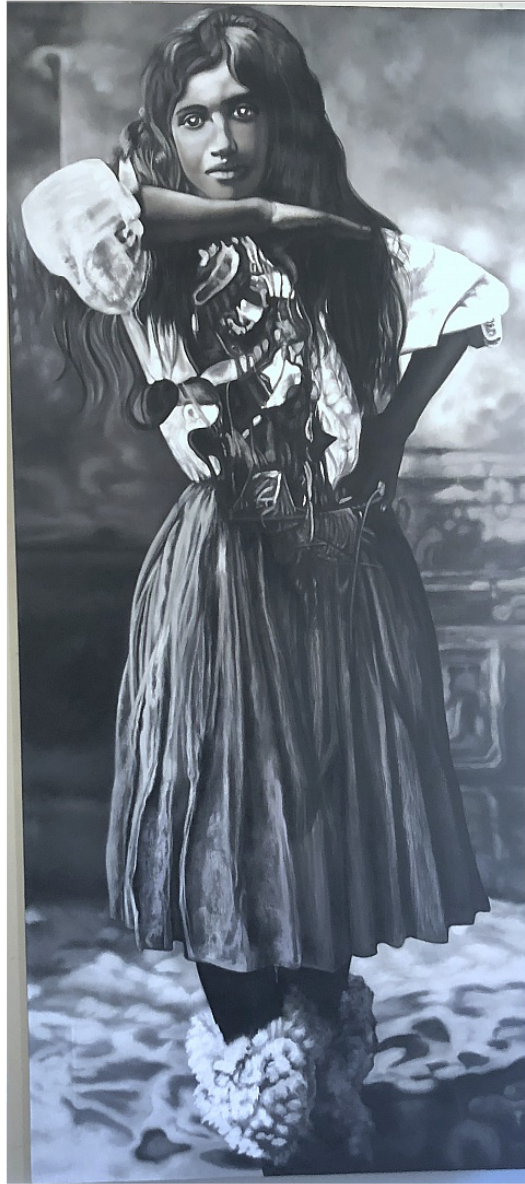
Michele Zalopany Vertical Hula Dancer , 2019 pastel on linen 72h x 32w in