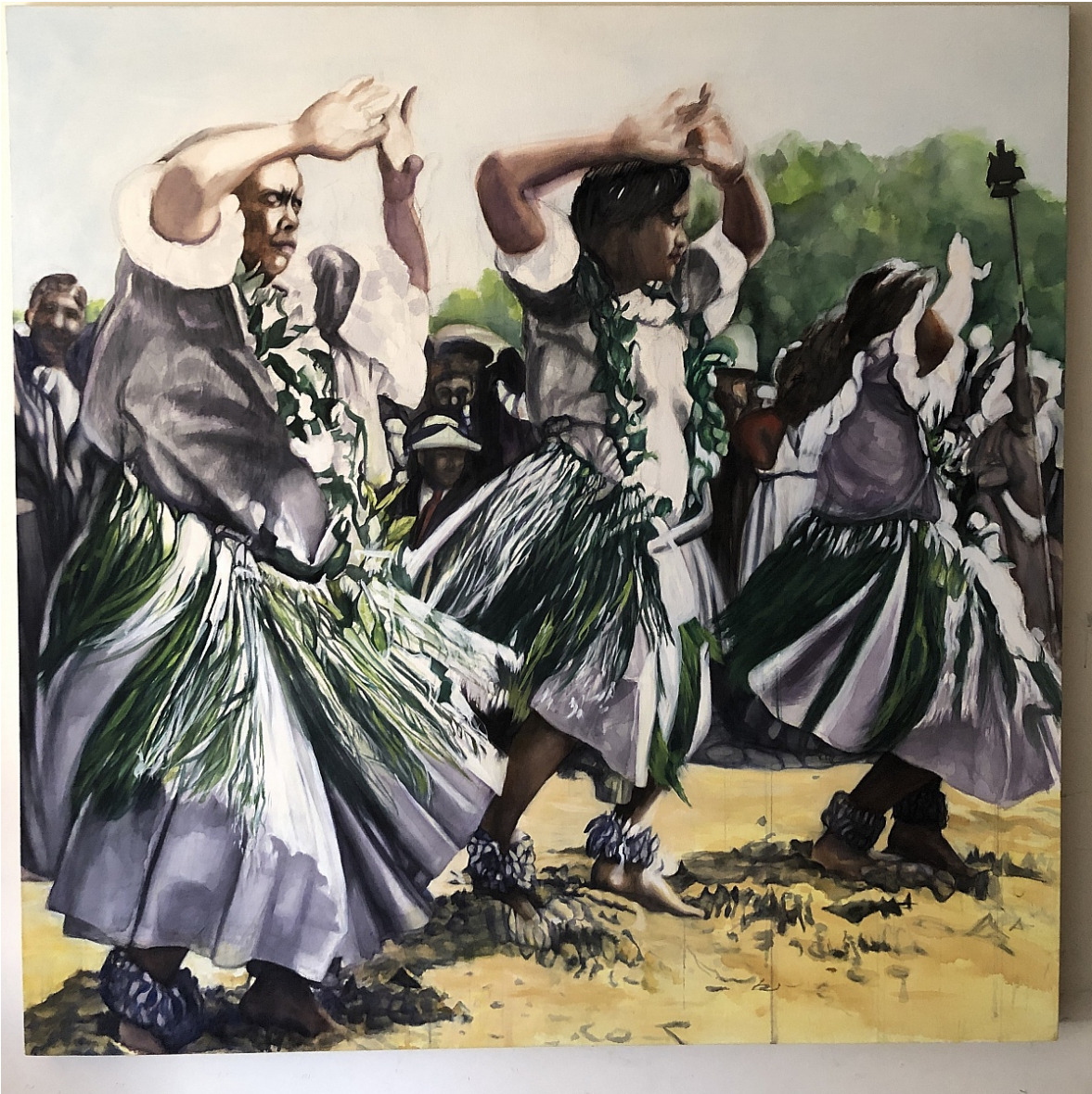
Michele Zalopany LG Hula Dancers , 2019 watercolor on canvas 68 1/4h x 68 1/2w in