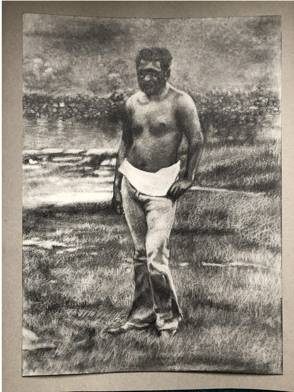
Michele Zalopany Plantation Worker , 2017 graphite on paper 14h x 10w in