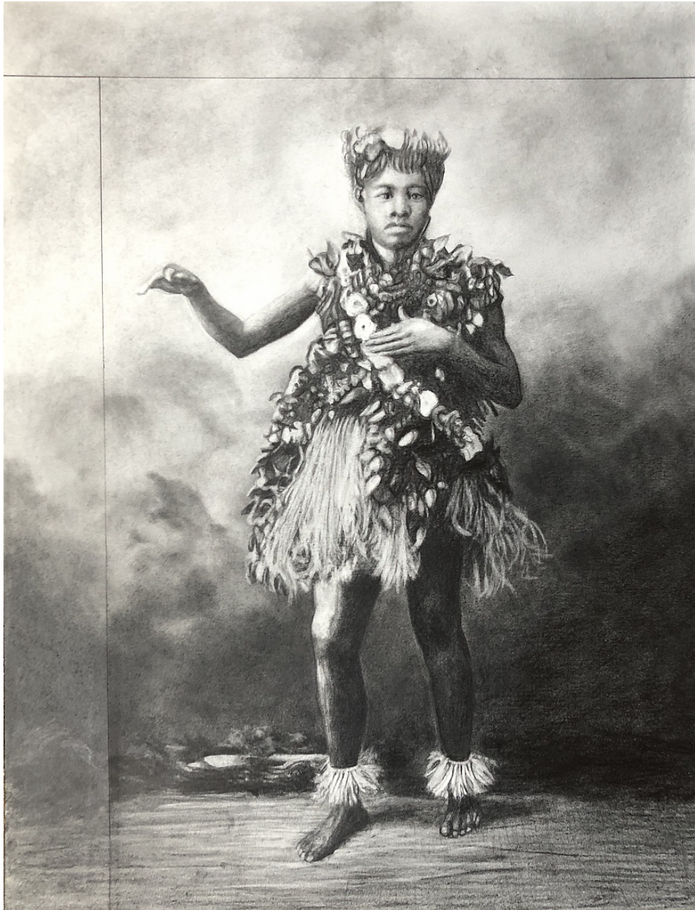
Michele Zalopany Tiny Hula Dancer , 2017 graphite on paper 16h x 12w in