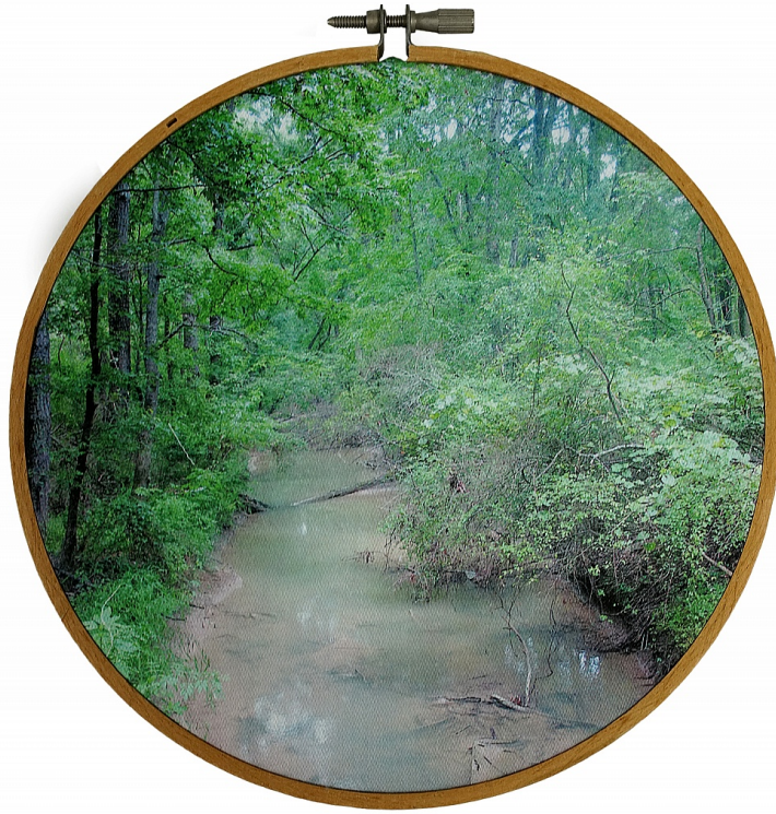
Letitia Huckaby Study for Where the Light Lingers, 2020 pigment print on cotton fabric with embroidery hoop 6 15/16h x 6 1/4w in