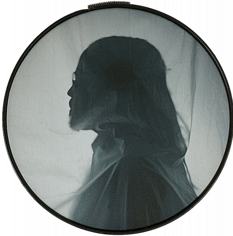
Letitia Huckaby The Breath of God , 2020 pigment print on cotton fabric with embroidery hoop 16 15/16h x 6 1/4w in