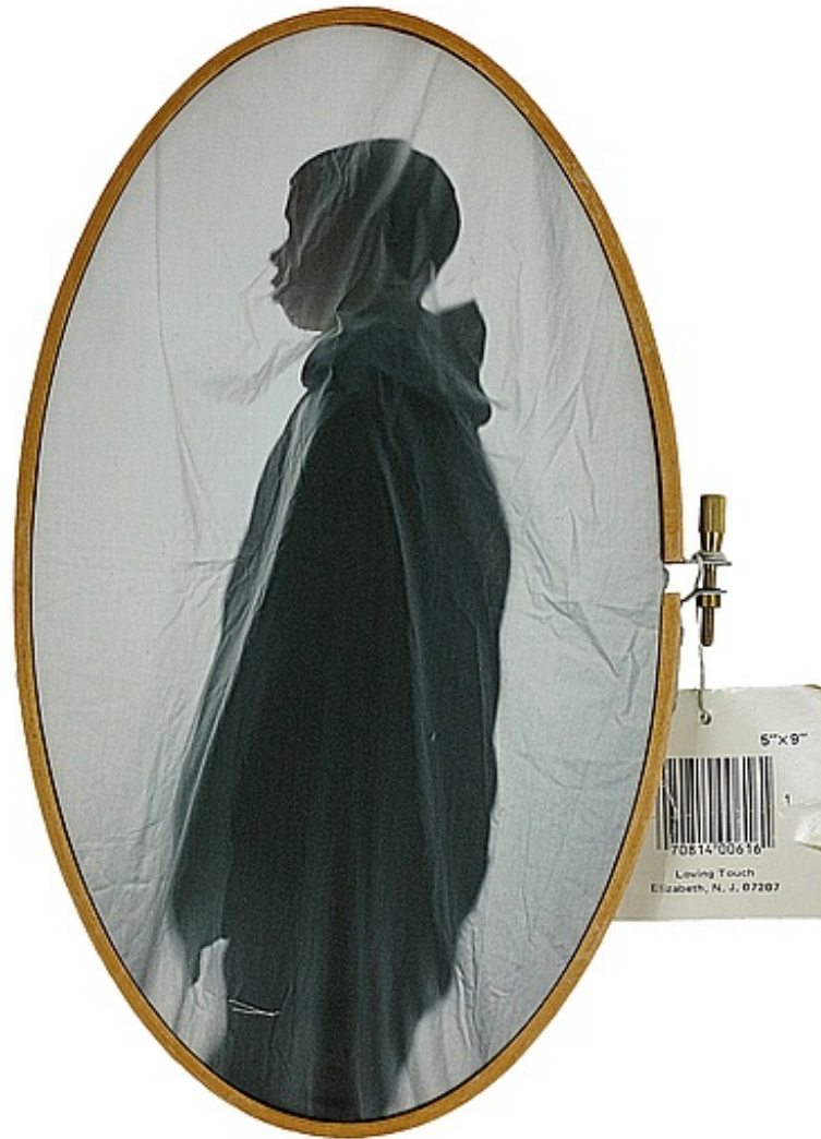
Letitia Huckaby Not for Sale , 2020 pigment print on cotton fabric with embroidery hoop 9 1/4h x 5 7/8w in