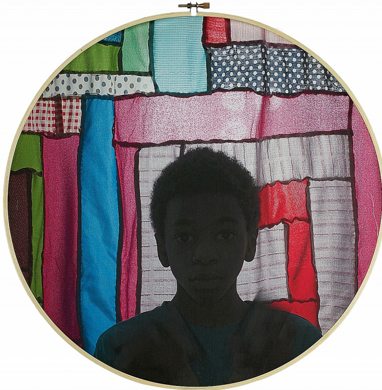
Letitia Huckaby The Rising Sun , 2020 pigment print on cotton fabric with embroidery hoop 14 3/4h x 14 1/2w in