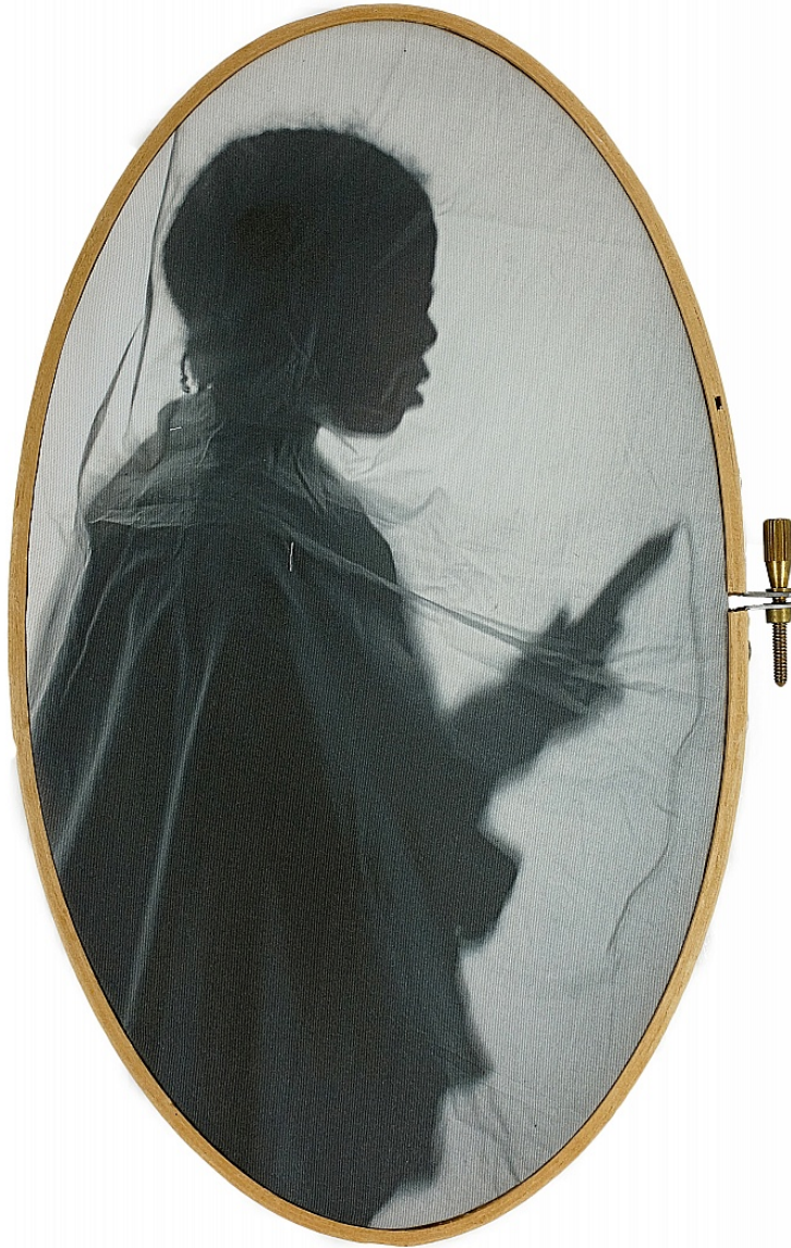
Letitia Huckaby Nobody Knows, 2020 pigment print on cotton fabric with embroidery hoop 9 1/4h x 5 13/16w in