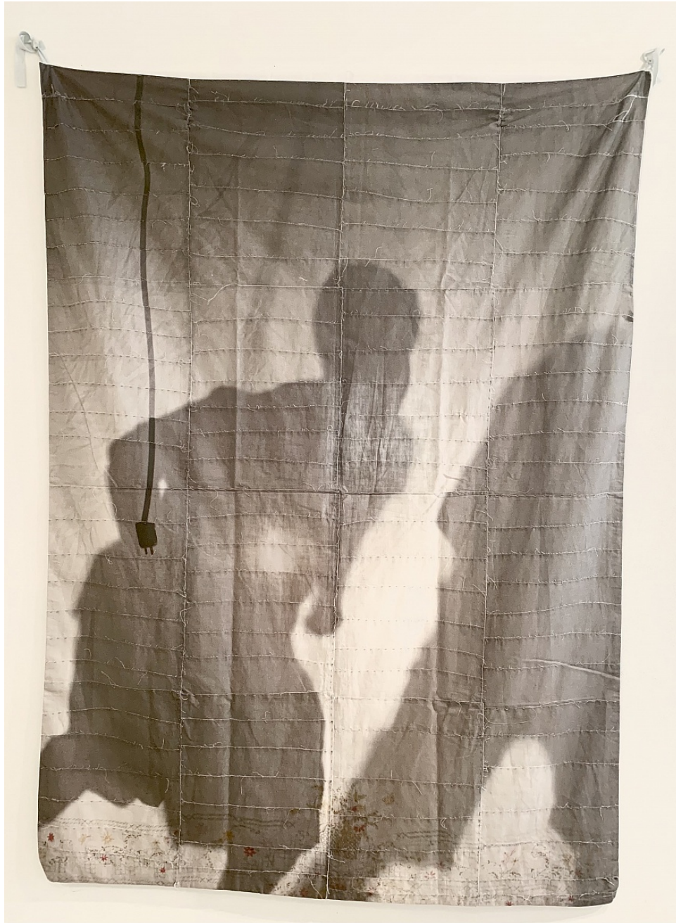
Letitia Huckaby Elijah and LaDonte (Jubilee) , 2012 pigment prints on fabric 40h x 55 1/2w in