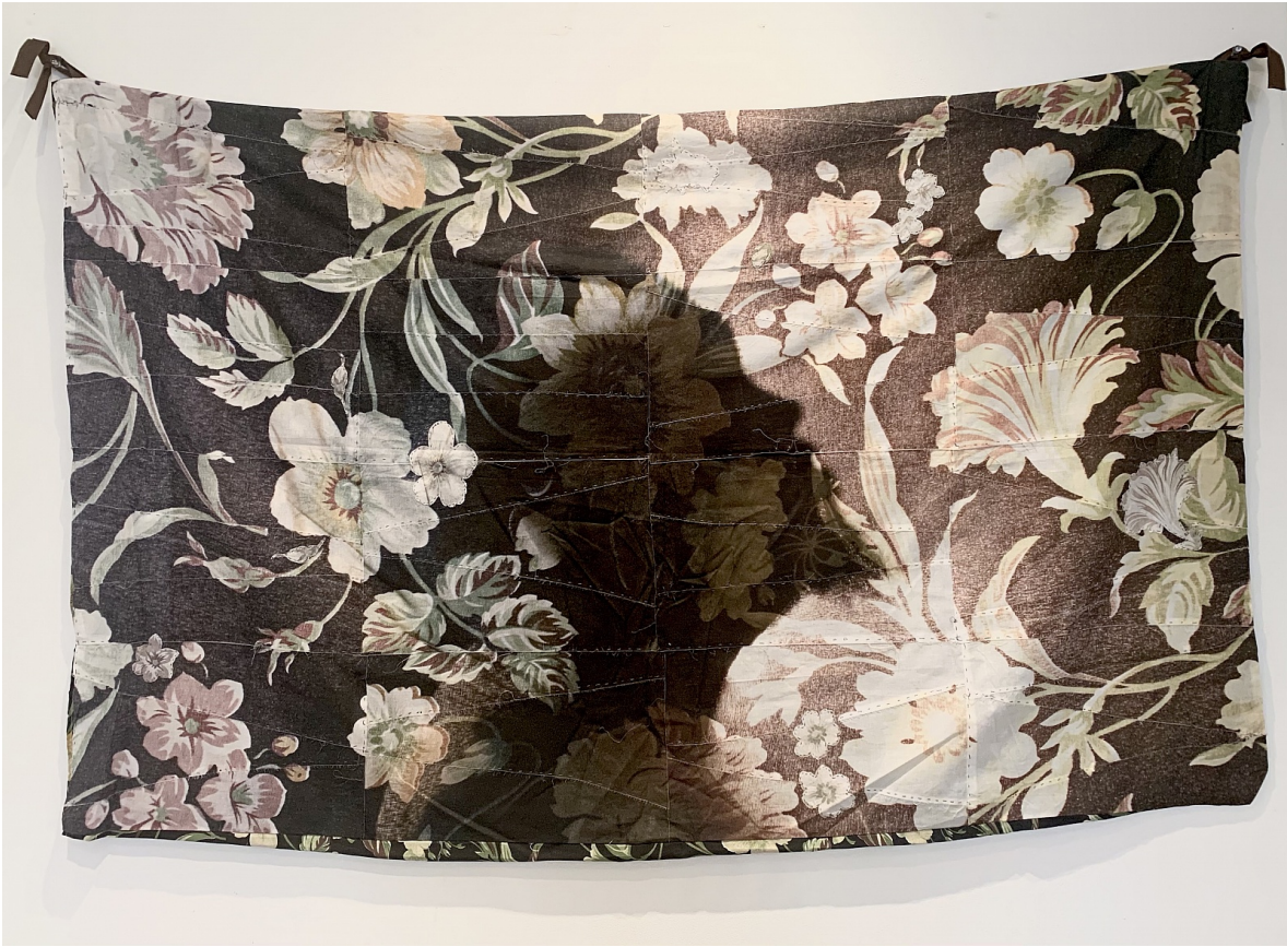
Letitia Huckaby Frederick , 2012 pigment prints on fabric 60h x 38 1/2w in