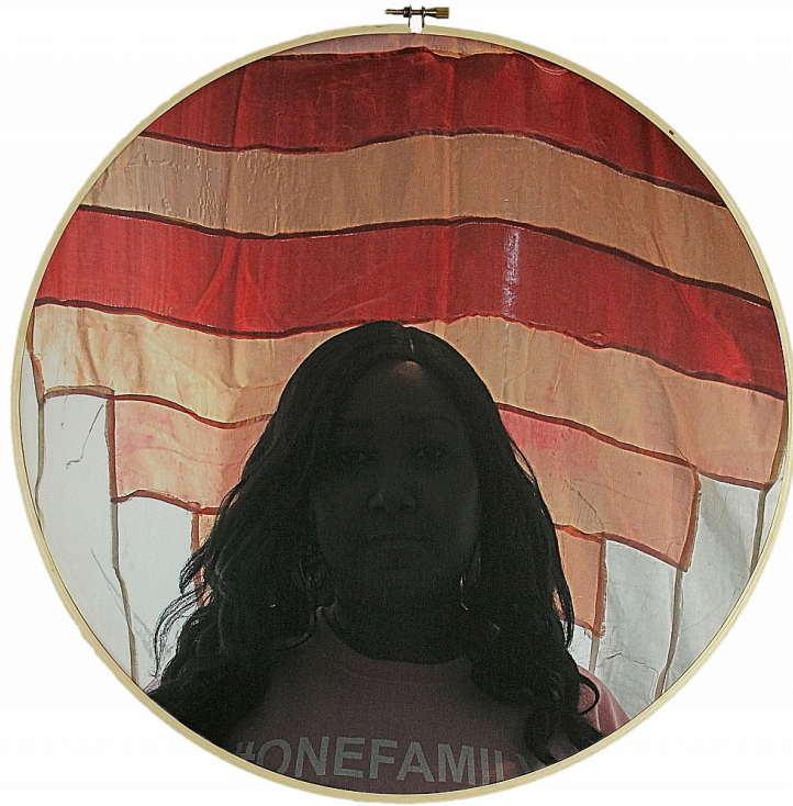
Letitia Huckaby One Family , 2020 pigment print on cotton fabric with embroidery hoop 14 3/4h x 14 1/2w in