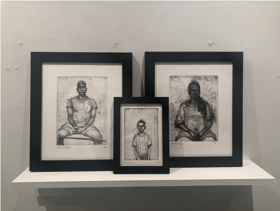
Sedrick Huckaby The Bridges, 2020 etchings 14 1/2h x 24w in