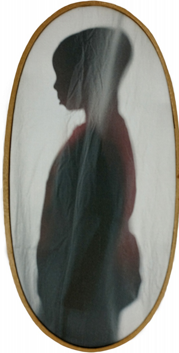
Letitia Huckaby Becoming , 2020 pigment print on cotton fabric with embroidery hoop 6 1/4h x 3 1/8w in