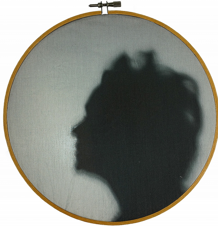
Letitia Huckaby To a Certain Lady , 2020 pigment print on cotton fabric with embroidery hoop