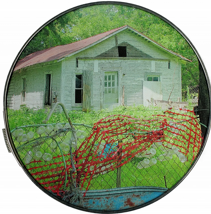
Letitia Huckaby Study for What the Land Remembers, 2020 pigment print on cotton fabric with embroidery hoop 6 1/8h x 6 1/4w in