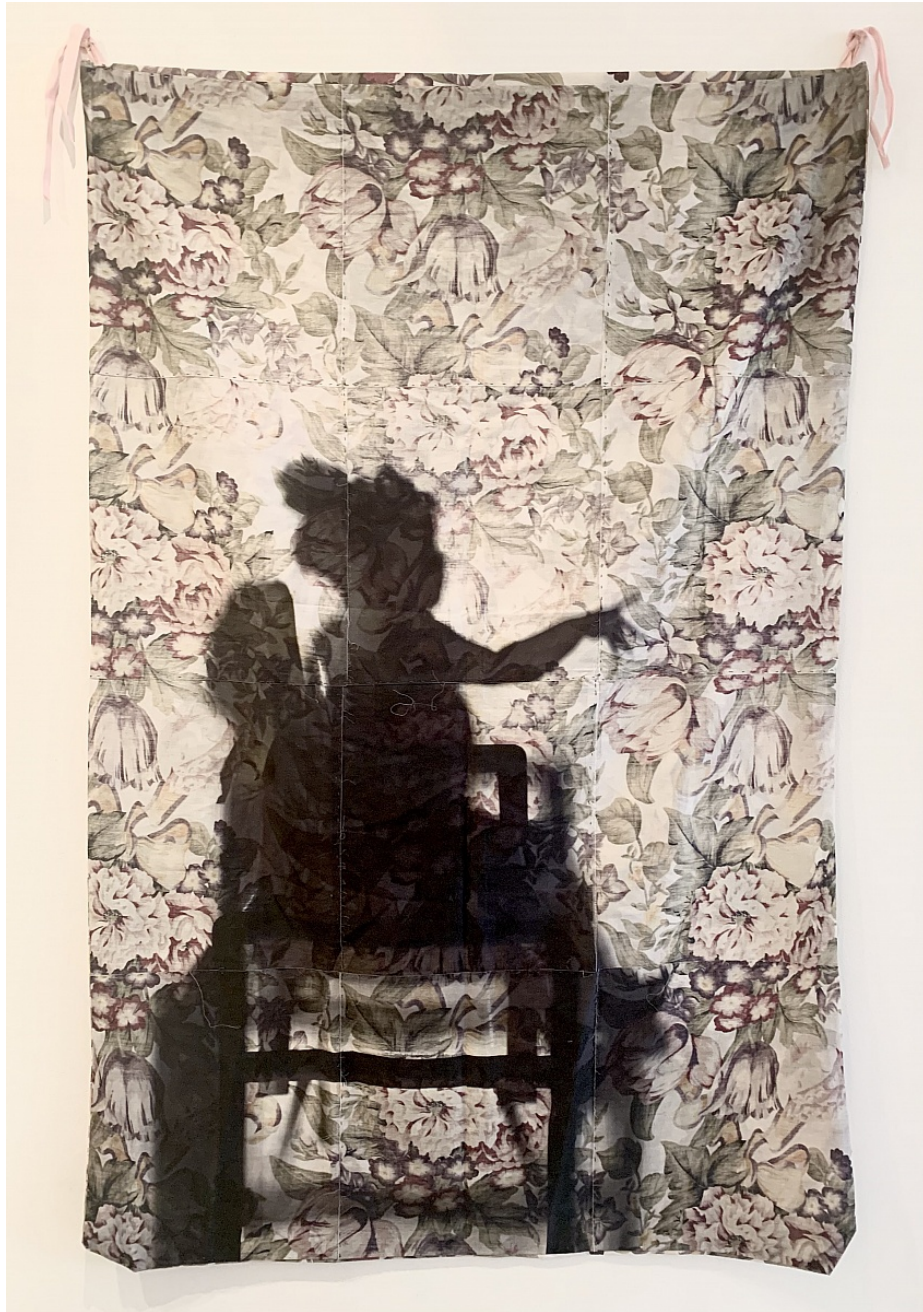
Letitia Huckaby A'Riyah , 2012 pigment prints on fabric 32 1/2h x 52w in