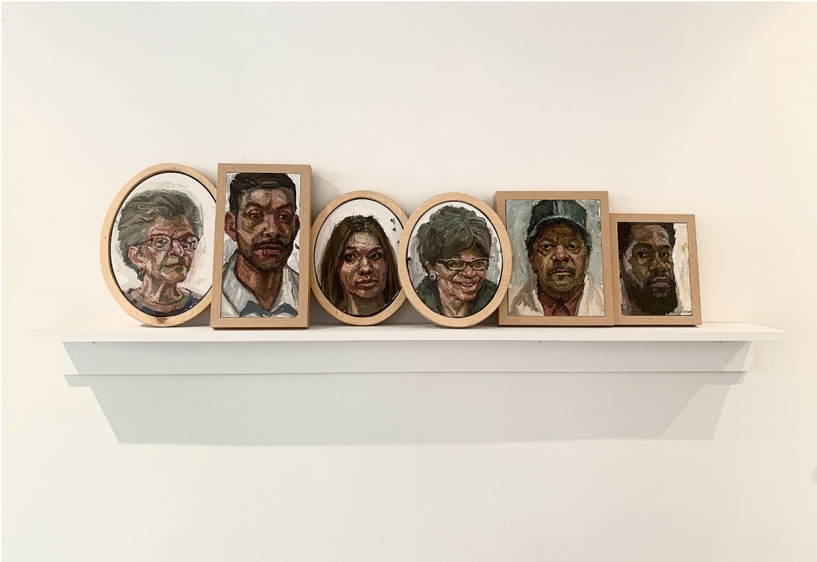
Sedrick Huckaby Study of the Huckabys , 2020 oil on canvas 14h x 48w in