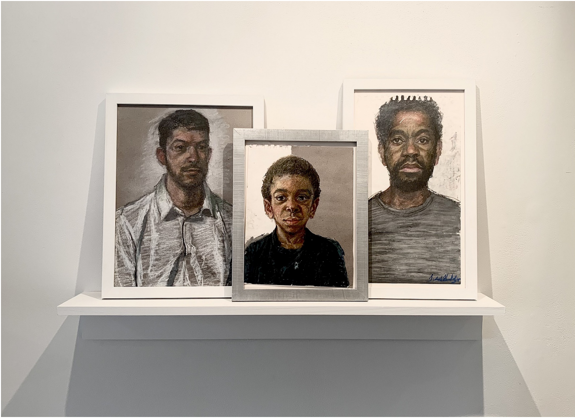
Sedrick Huckaby Huckaby Gentlemen , 2019 oil pastel on paper 19 1/2h x 31w in