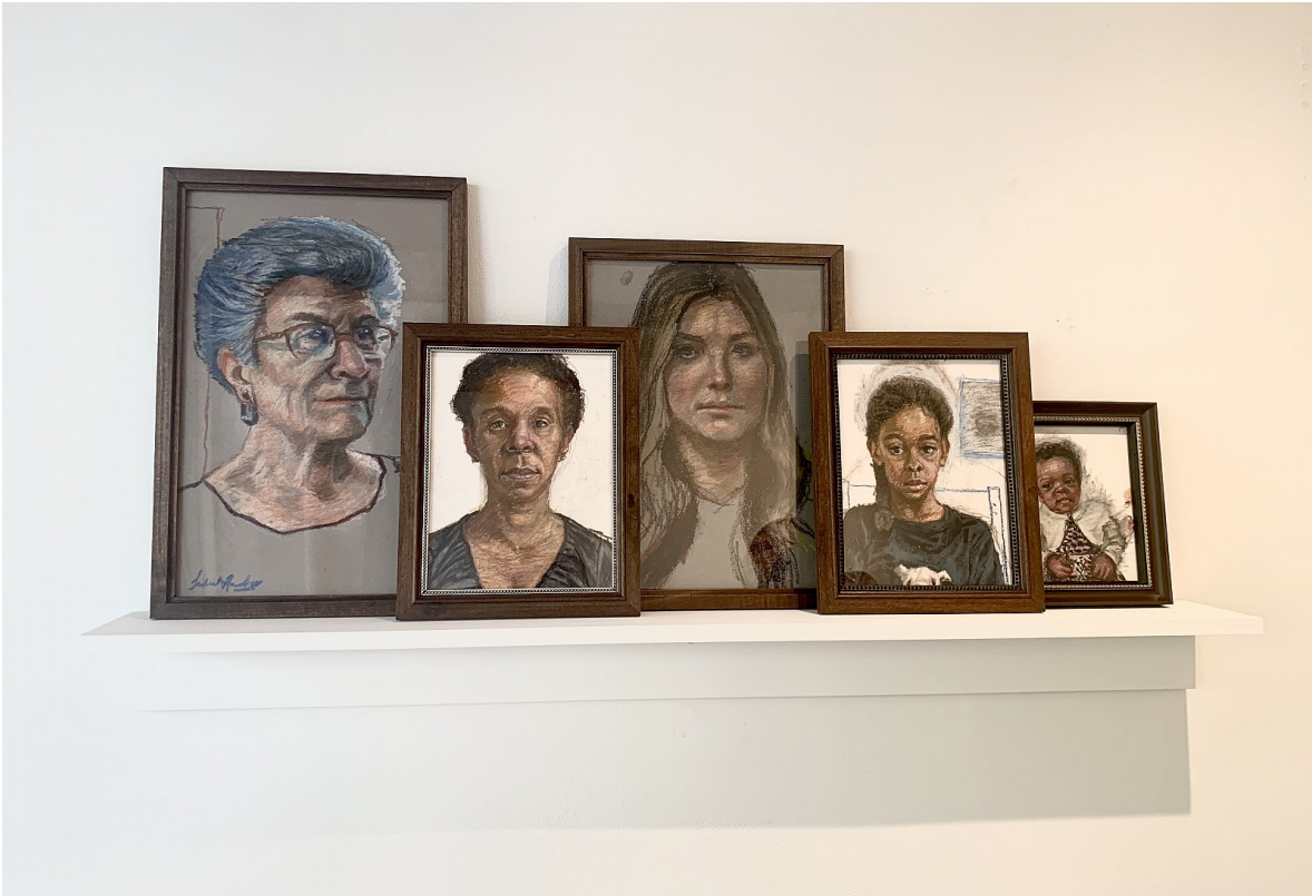
Sedrick Huckaby The Huckaby Ladies , 2019 oil pastel on paper 20h x 45w in