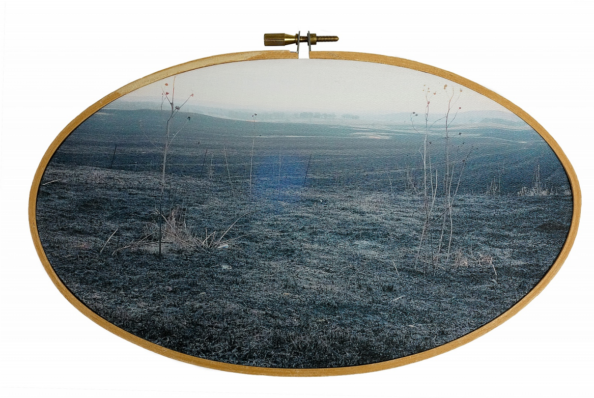
Letitia Huckaby Study for Black is Blue, 2020 pigment print on cotton fabric with embroidery hoop 6 13/16h x 9 1/4w in