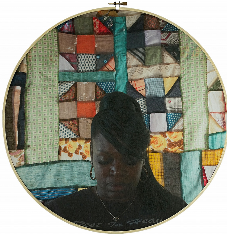
Letitia Huckaby Rest in Heaven, She Said , 2020 pigment print on cotton fabric with embroidery hoop 14 3/4h x 14 1/2w in