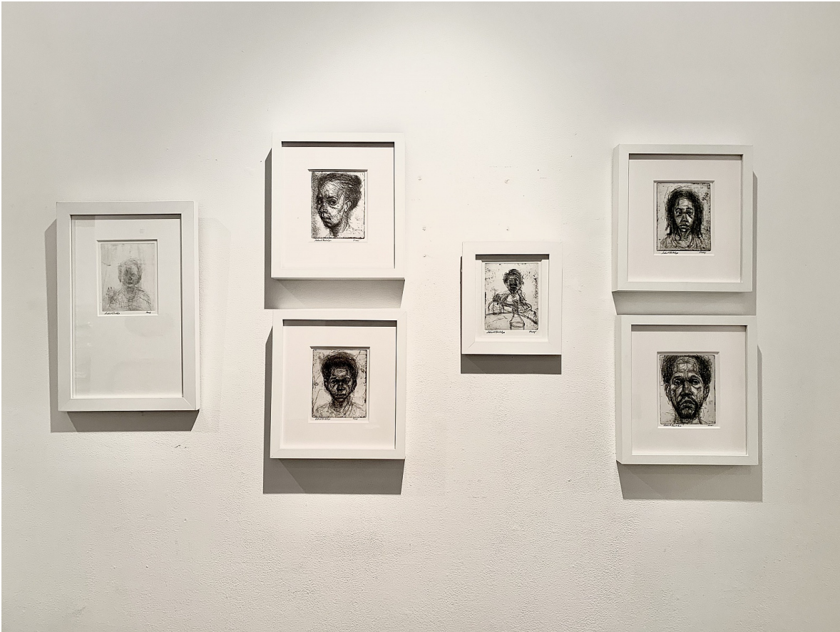
Sedrick Huckaby The Family #2 , 2018 etching 24h x 50w in