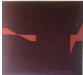
L. Brandon Krall MU , 1990 Oil on canvas 26h x 28w in