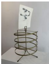
L. Brandon Krall Tourbillon , 1998 brass readymade with drawing 20h x 9 1/2d in