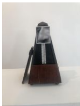
L. Brandon Krall Trompe Nez , 2005 9h x 5 1/2w x 4 1/2d in