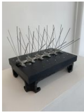
L. Brandon Krall La Voix Lactee , 2004 7 1/2h x 9w x 6d in