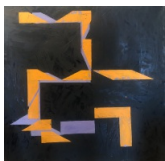
L. Brandon Krall Experior , 1989 Oil on canvas 48h x 48w in