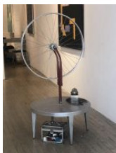
L. Brandon Krall Priere de Toucher , 1995 bicycle wheel, wood table, palette 49h x 24d in