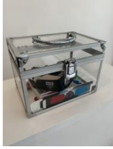
L. Brandon Krall 3D , 2004 6 1/2h x 8 3/4w x 6d in