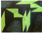
L. Brandon Krall Passus , 1989 Oil on canvas 37h x 47 1/4w in