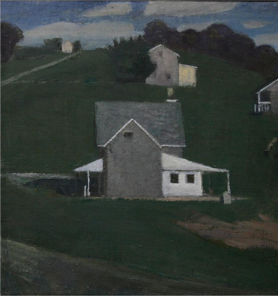
E.M. Saniga Four Houses on a Hillside , 2021 oil on canvas over board 12h x 12 1/4w in