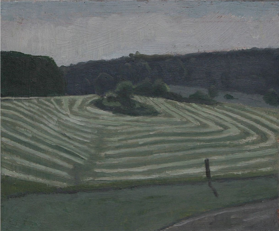
E.M. Saniga Raked Hay #2 , 2019-21 oil on canvas over panel 12 1/2h x 12w in