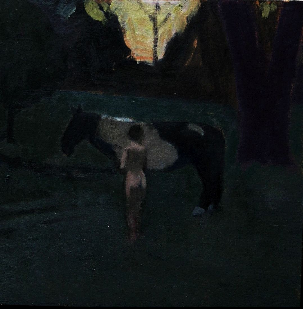
E.M. Saniga Figures in an Evening Landscape, 2021 oil on board 8h x 8w in