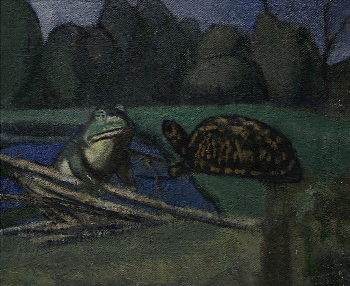
E.M. Saniga Landscape with a Bullfrog and a Turtle , 2021 oil on canvas over board 9 1/2h x 11 1/2w in