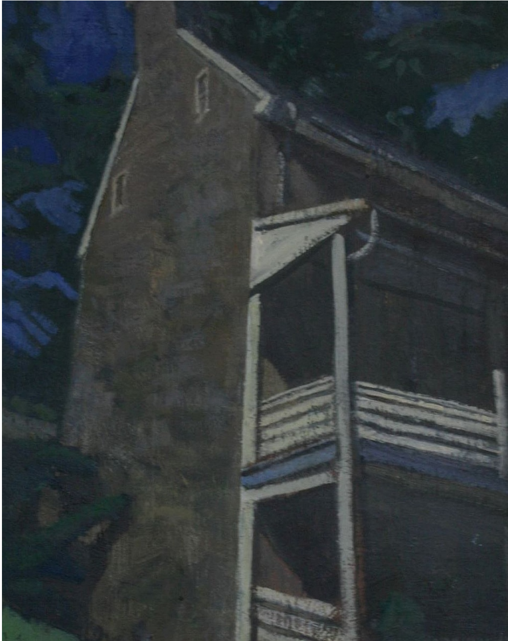
E.M. Saniga A Quaker House , 2021 oil on canvas over board 10 3/4h x 13 1/4w in