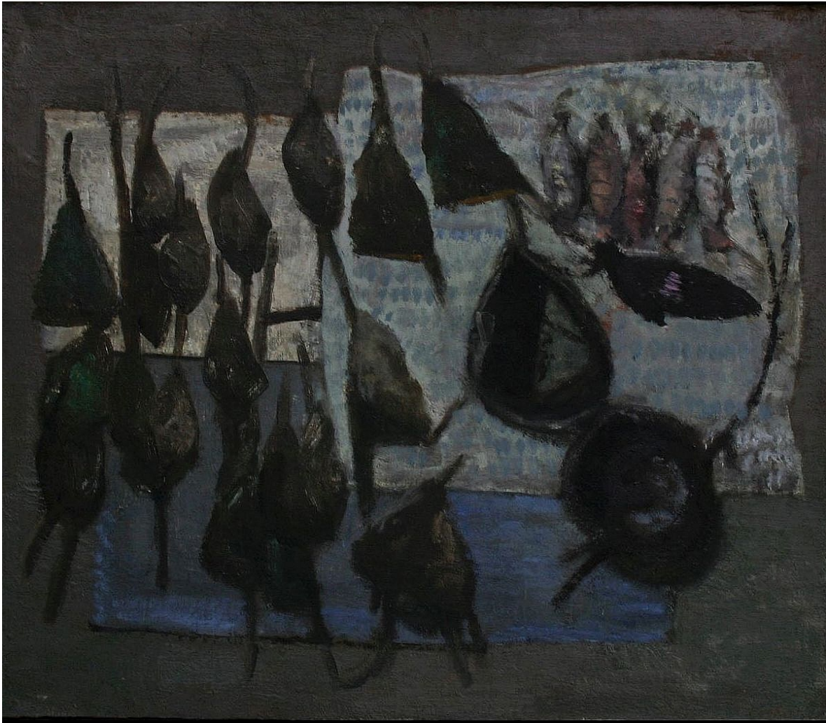
E.M. Saniga The Origins of Species , 2021 oil on canvas over board 11 3/4h x 14w in