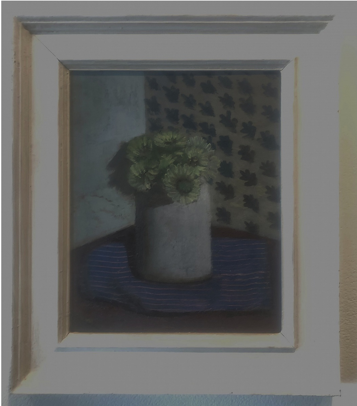
E.M. Saniga Zinnias on a Blue Cloth , 2020-21 oil on panel 10h x 8 1/2w in