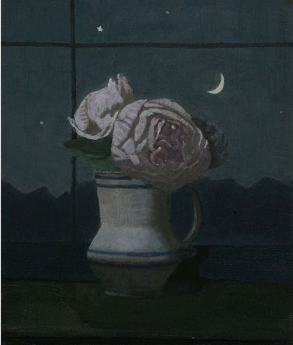
E.M. Saniga peonies with venus and the moon (June 14), 2021 oil on plywood 12 3/4h x 10 1/2w in