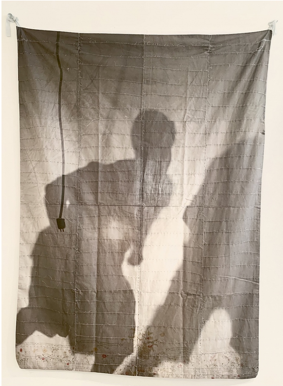
Letitia Huckaby Elijah and LaDonte (Jubilee) , 2012 pigment prints on fabric 40h x 55 1/2w in