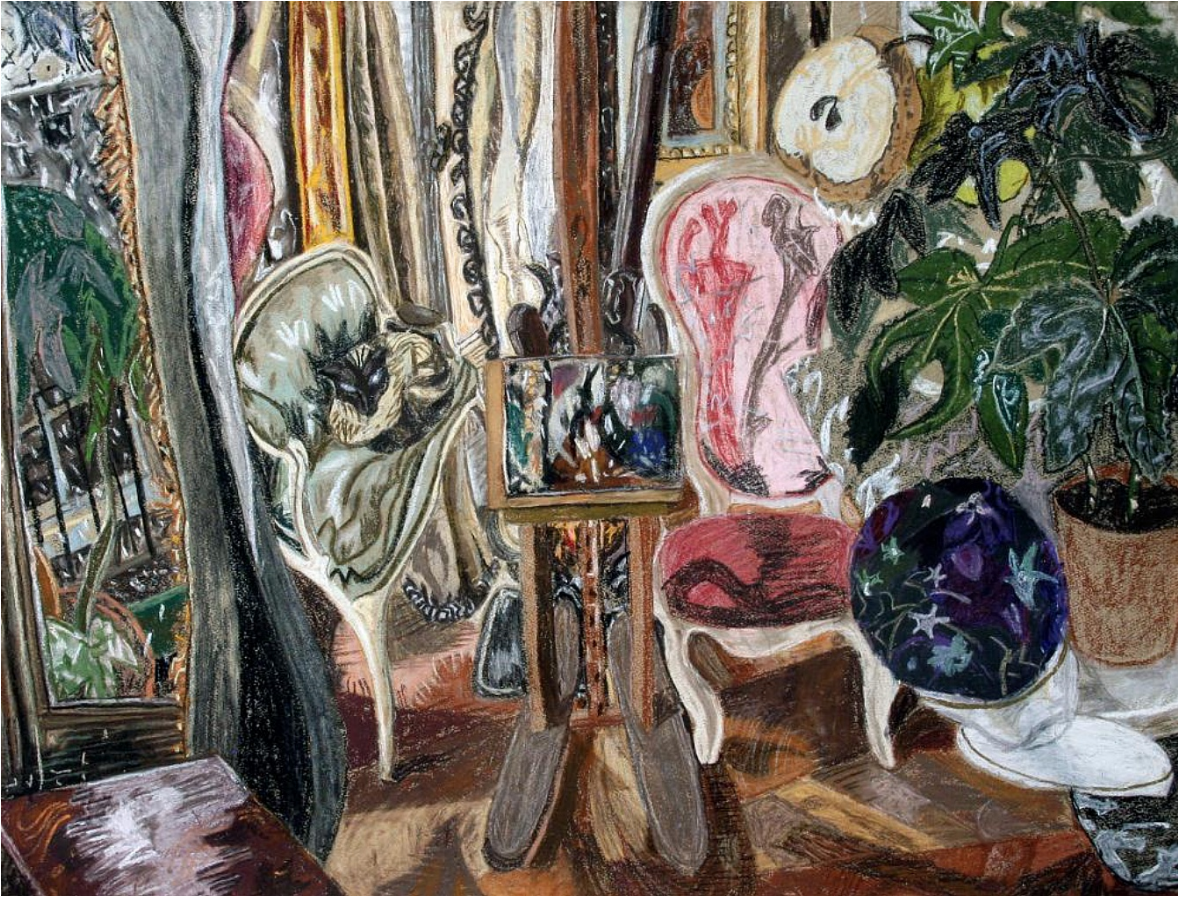
Anne Harvey Artists Studio Interior pastel on paper 19 1/2h x 25 1/2w in