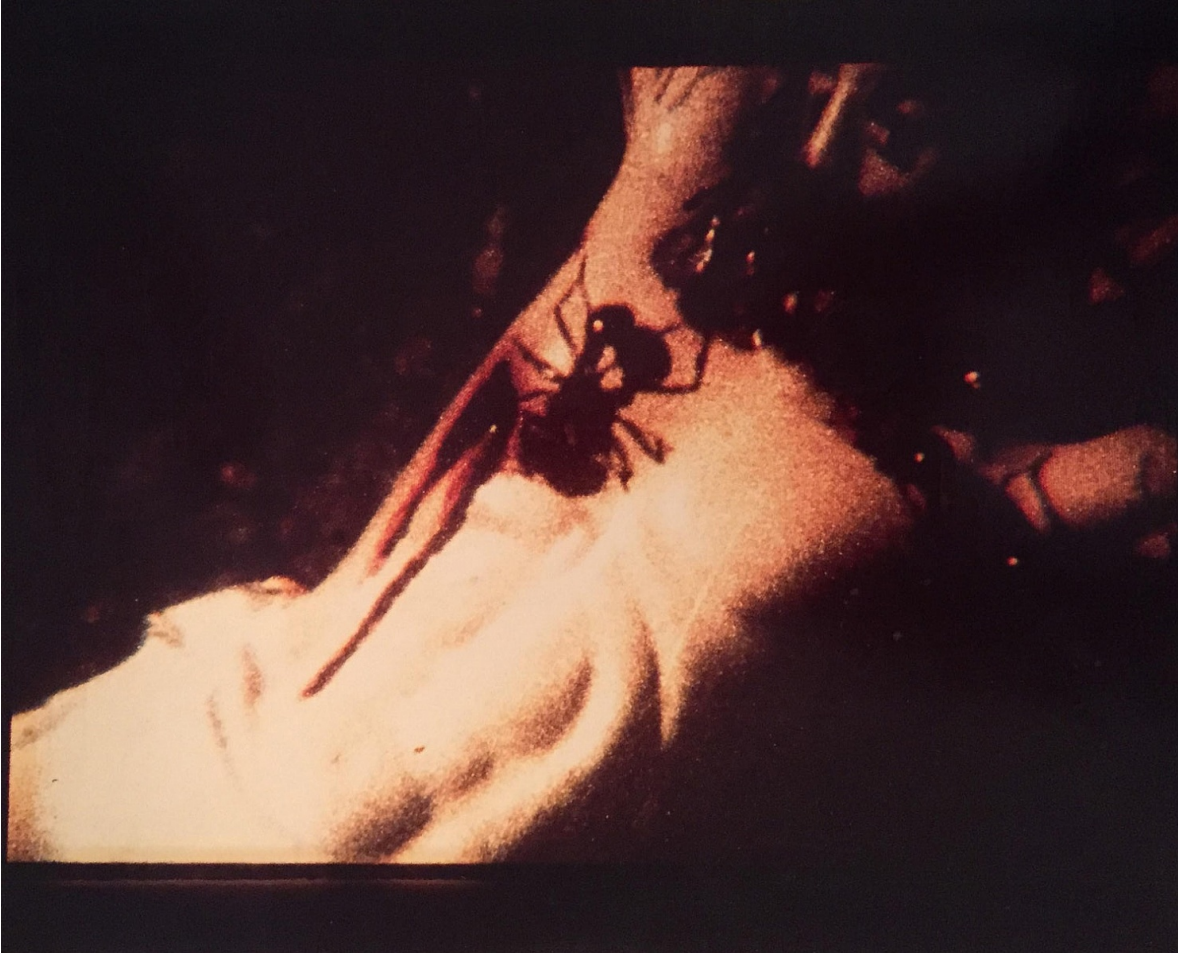
David Wojnarowicz Crucifix with Ants (from Fire in my Belly) , 1990 color photograph. signed and dated on verso. 6 1/2h x 9 1/2w in