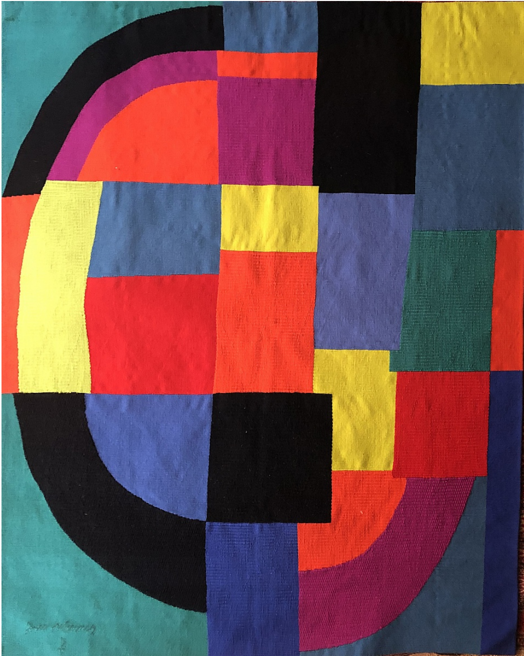
Sonia Delaunay Equateur , c.1970 Aubusson tapestry 77h x 63 3/4w in