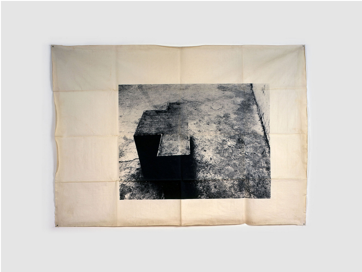
Joseph Beuys Vacuum-Mass , 1970 photograph on canvas 49 1/5h x 68 9/10w in 56/100