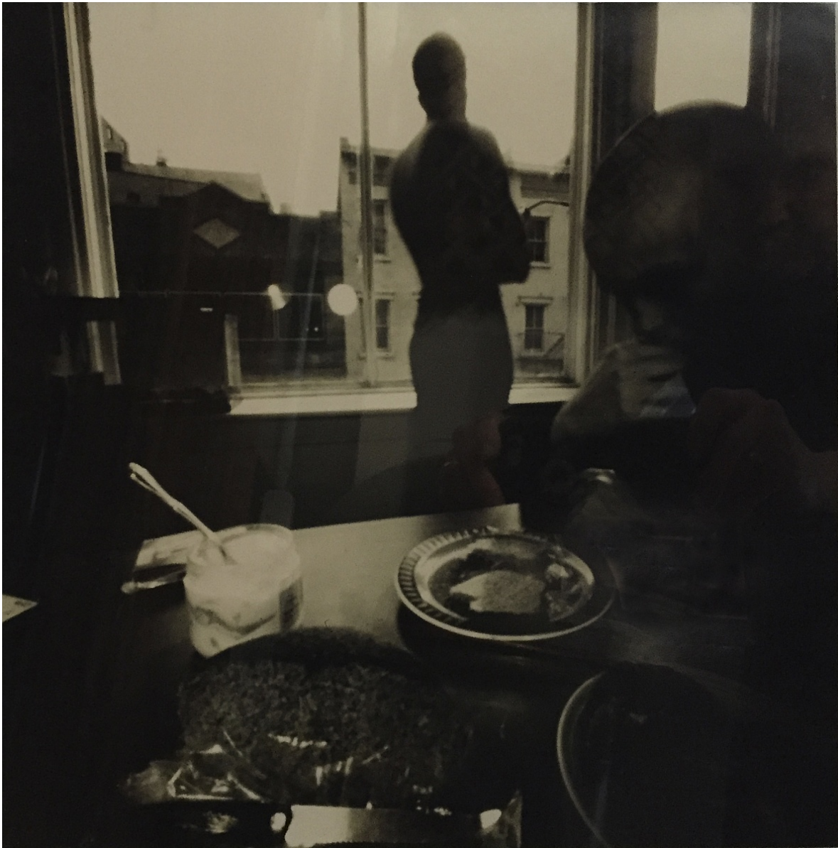
Barbara Ess Kitchen Table Couple Black and White photograph. Signed verso 11 1/2h x 11 1/2w in