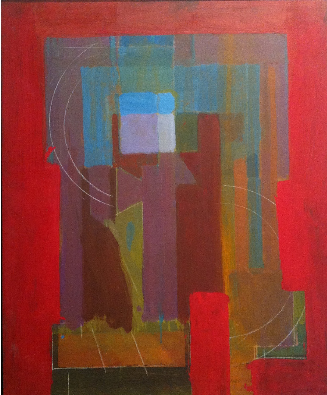
Earl Kerkam Untitled (E1076) , undated Oil On Canvas Board 24h x 20w in