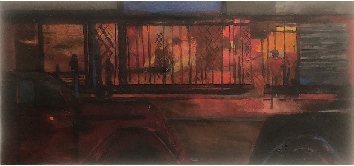
Bill Rice storefronts oil on canvas 24h x 50w in