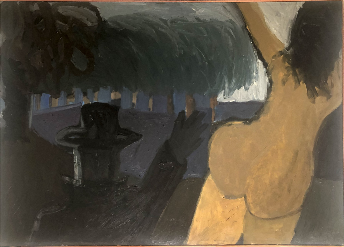
Bob Thompson Good By Come Back , 1959 oil on canvas 50h x 69 1/2w in