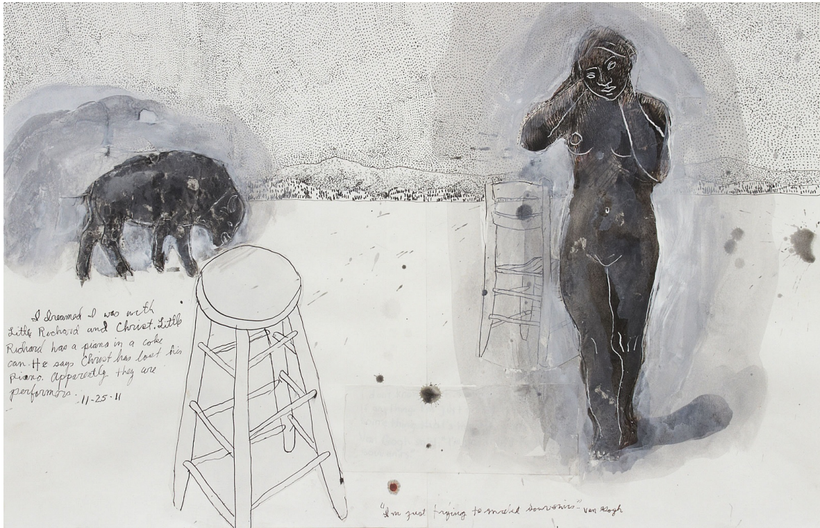
Chuck Bowdish Woman with Bison , 2012 mixed media and collage on paper 17h x 26w in