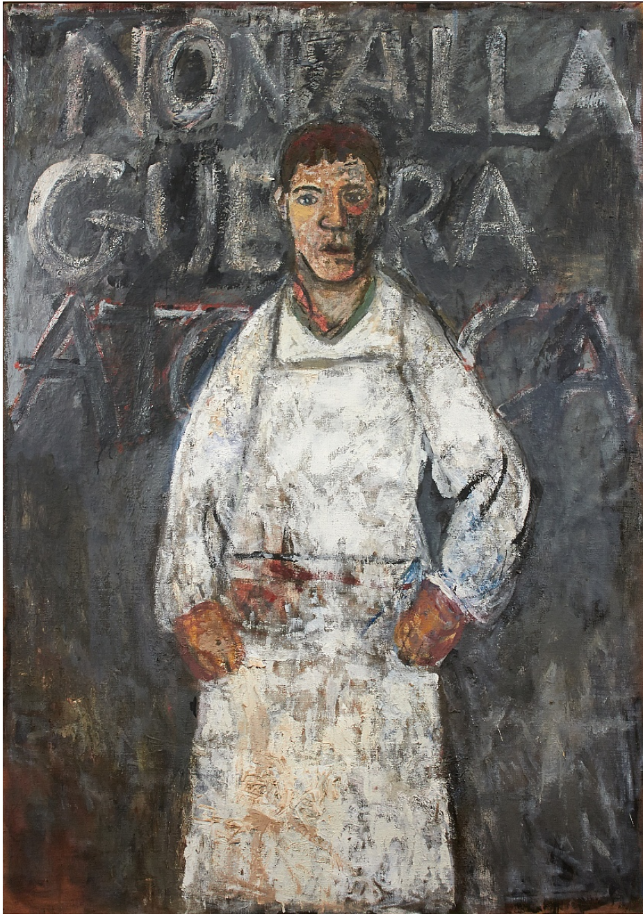
Gandy Brodie Butcher Boy , c.1957 oil on board 56h x 40w in