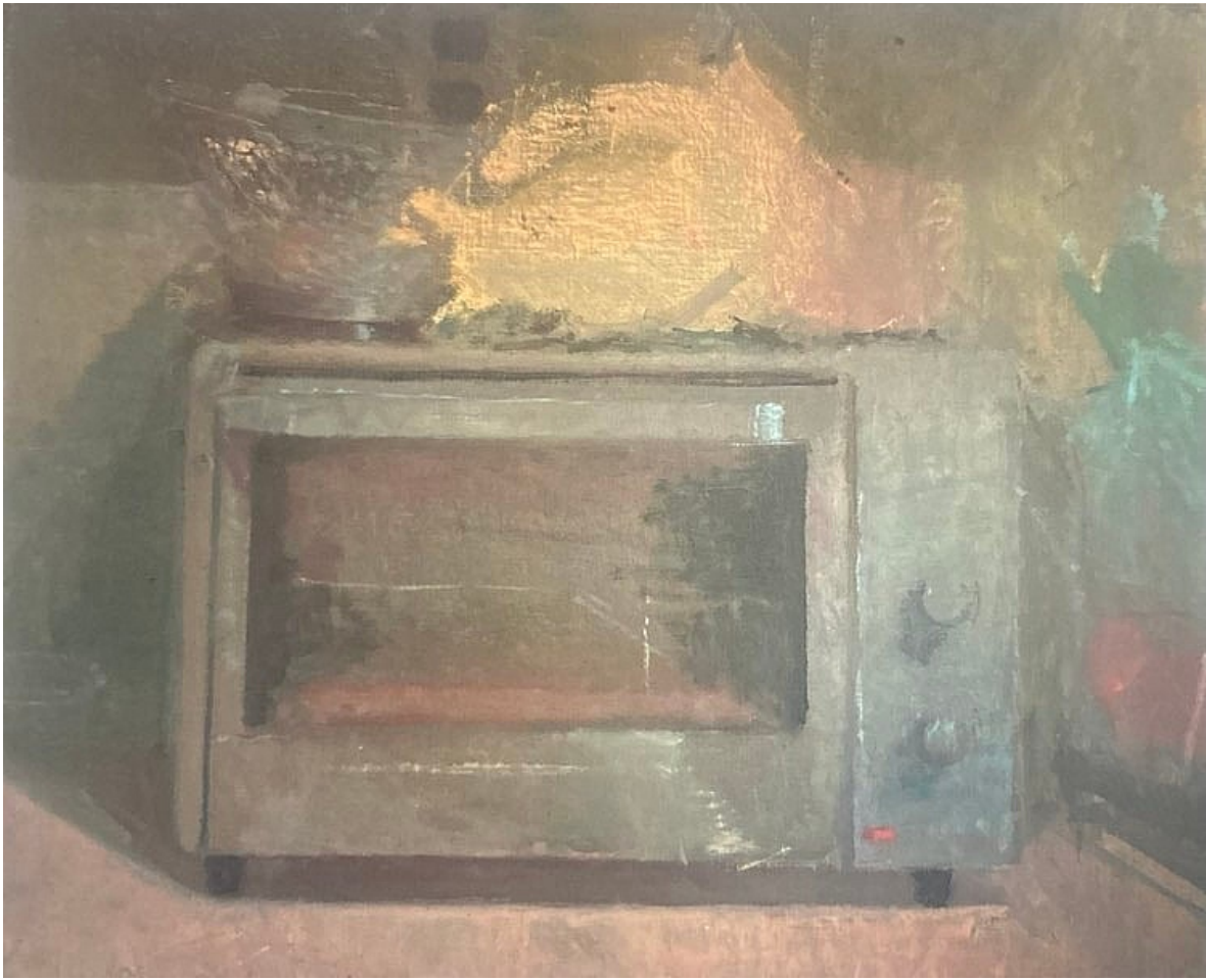
Abigail Dudley Toaster , 2022 oil on linen 24h x 18w in