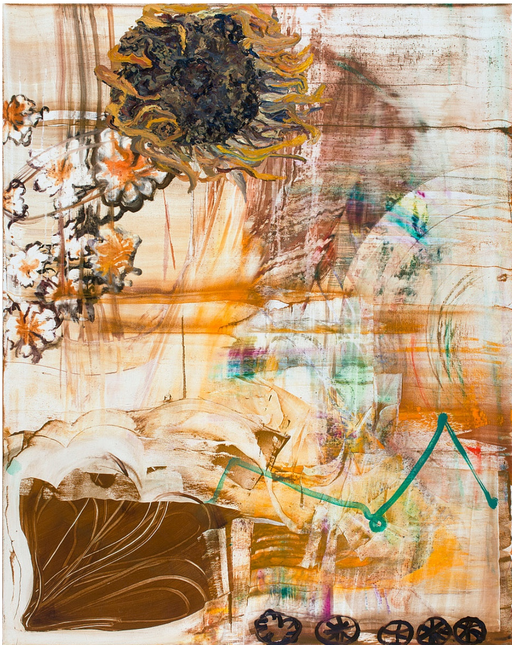
Jeane Cohen Sunbaked , 2021 oil on canvas 60h x 48w in