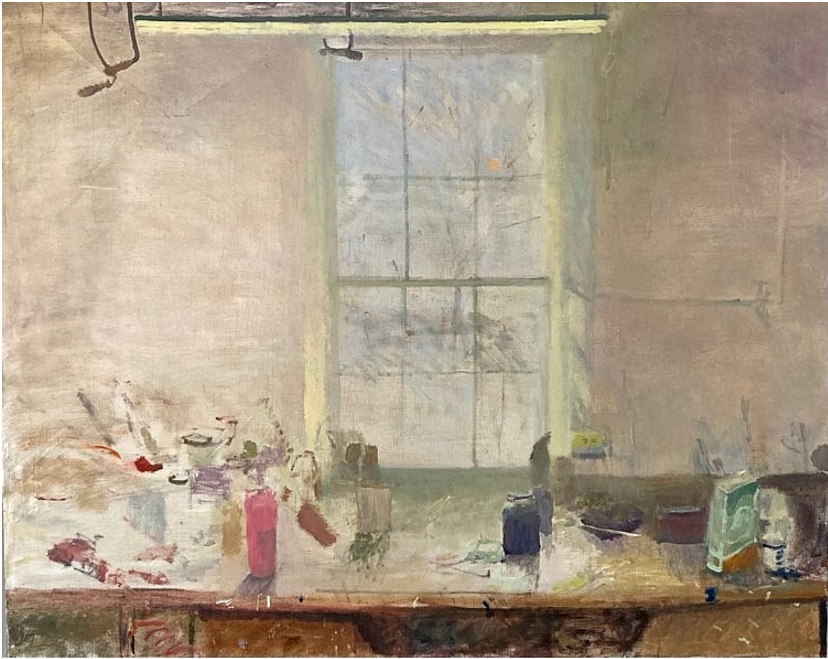
Abigail Dudley Worktable , 2022 oil on linen 32h x 40w in