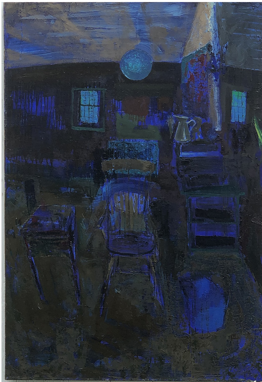
Gideon Bok Dark Winter , 2021 oil on canvas 45h x 33w in