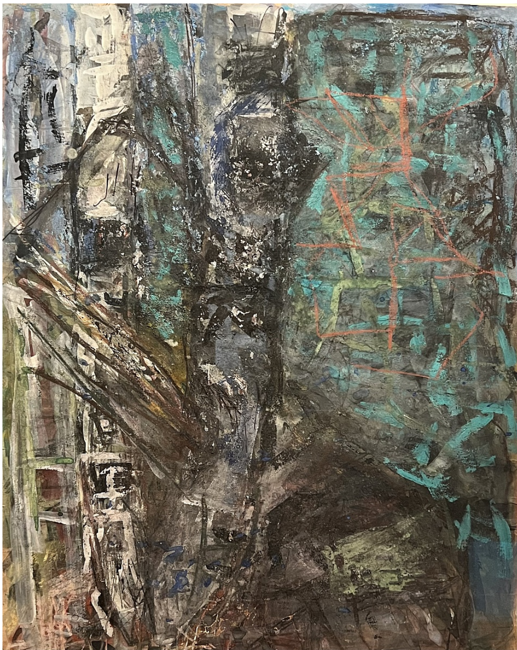
Gandy Brodie Birches , c. 1968 mixed media on paper 28h x 22w in