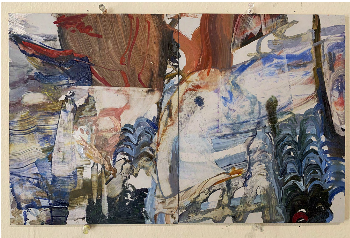
Jeane Cohen Heavens (diptych) , 2020 oil on panel 10h x 16w in