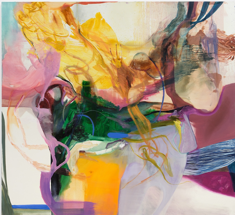
Grace Carney girlgirlgirl , 2022 oil on canvas 66h x 72w in