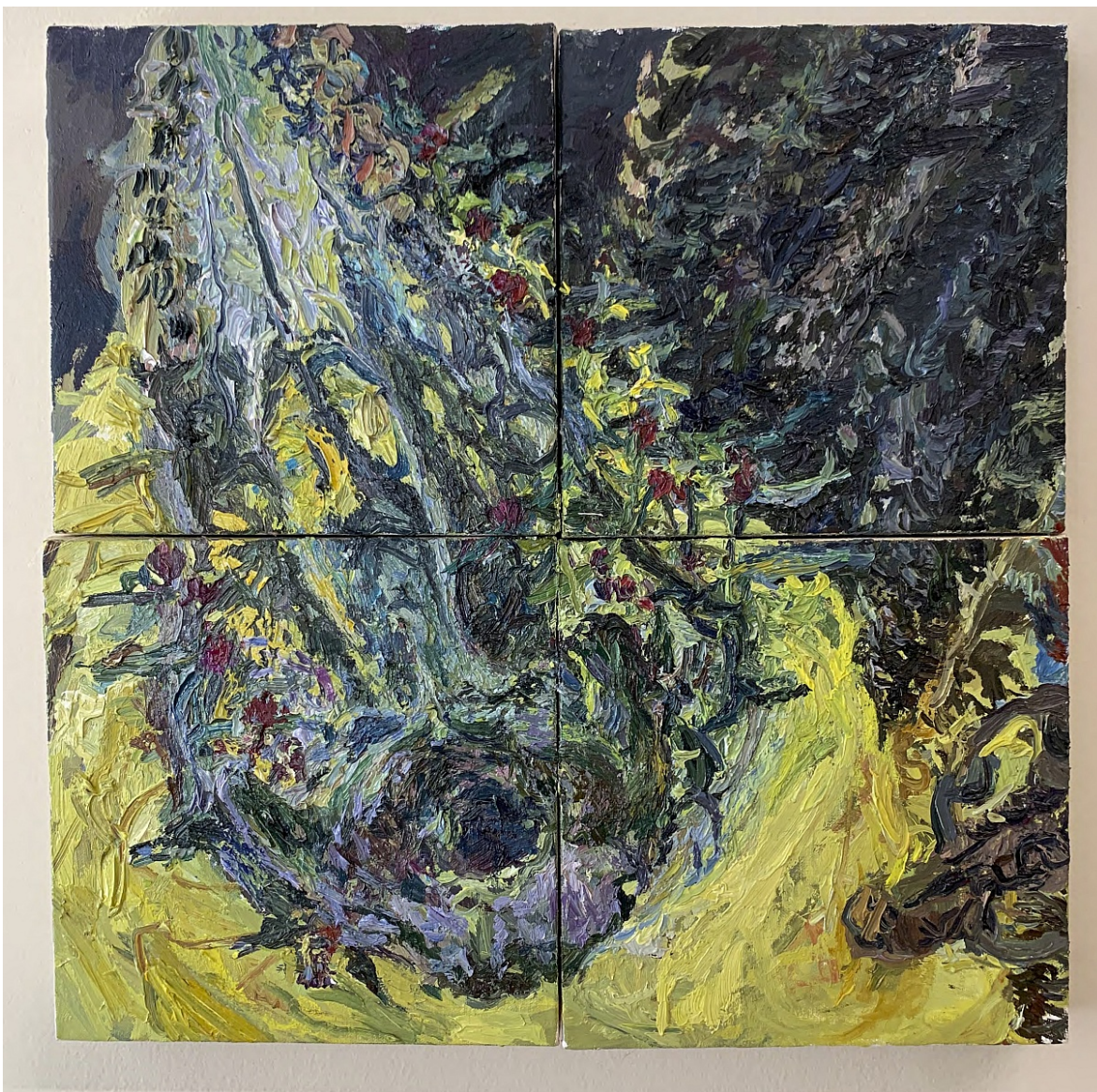
Jeane Cohen Moose Crown and Rodent Skull , (tetraptych), 2020 oil on canvas 20h x 20w in