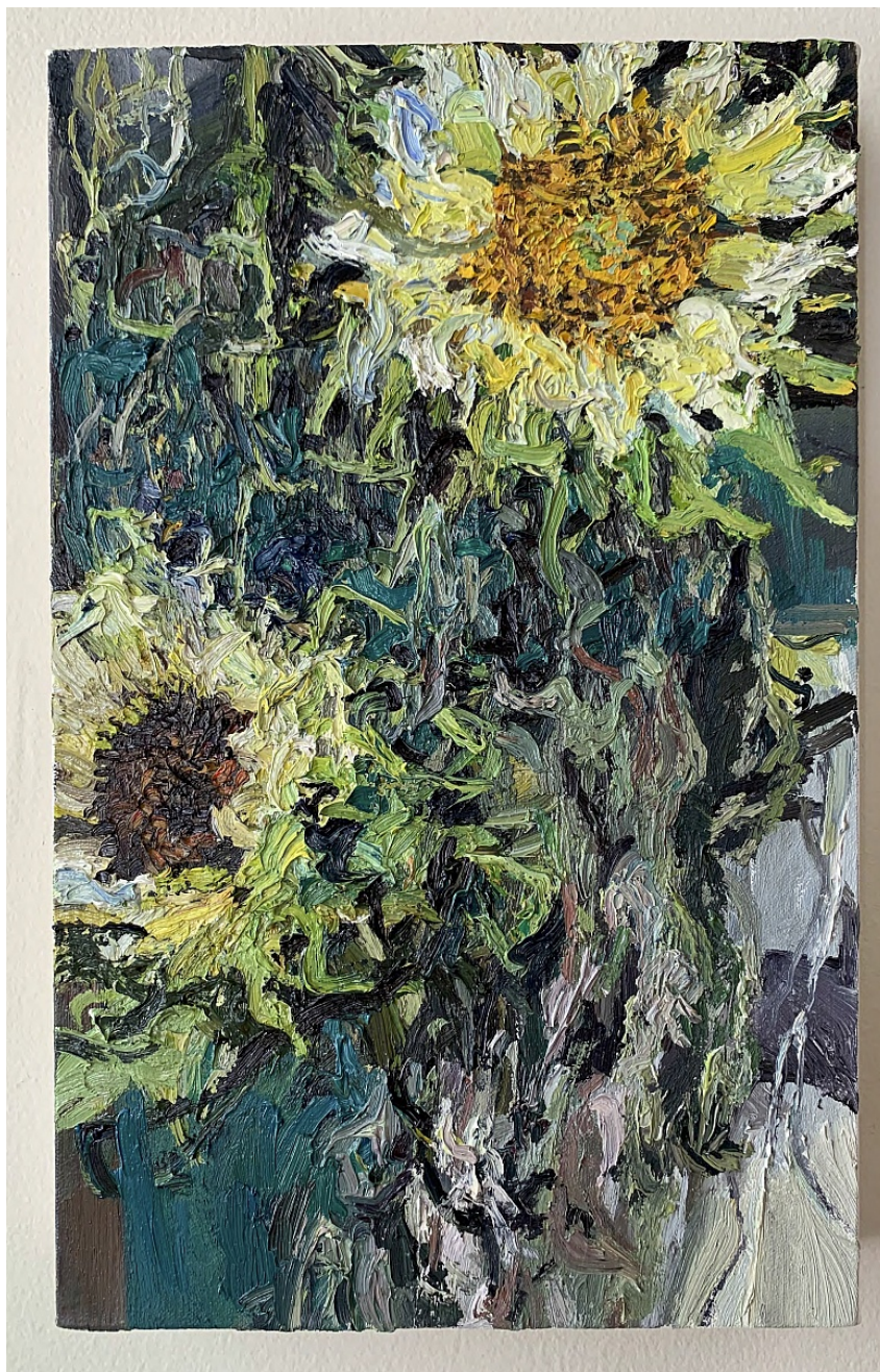
Jeane Cohen Flowers and Dueling Ponies , 2020 oil on canvas 20h x 16w in