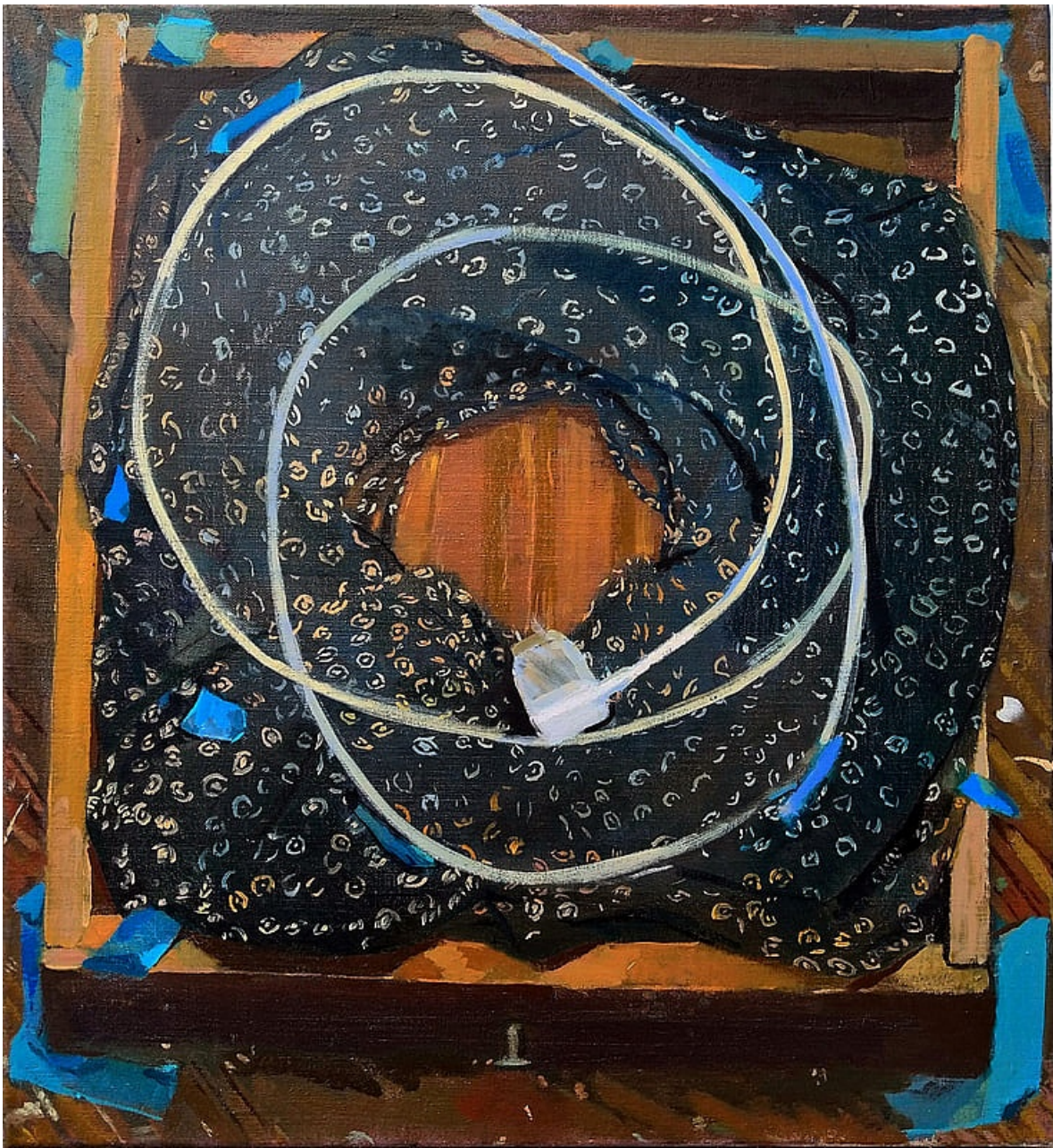
Abigail Dudley Astra , 2020 oil on linen 23h x 23w in