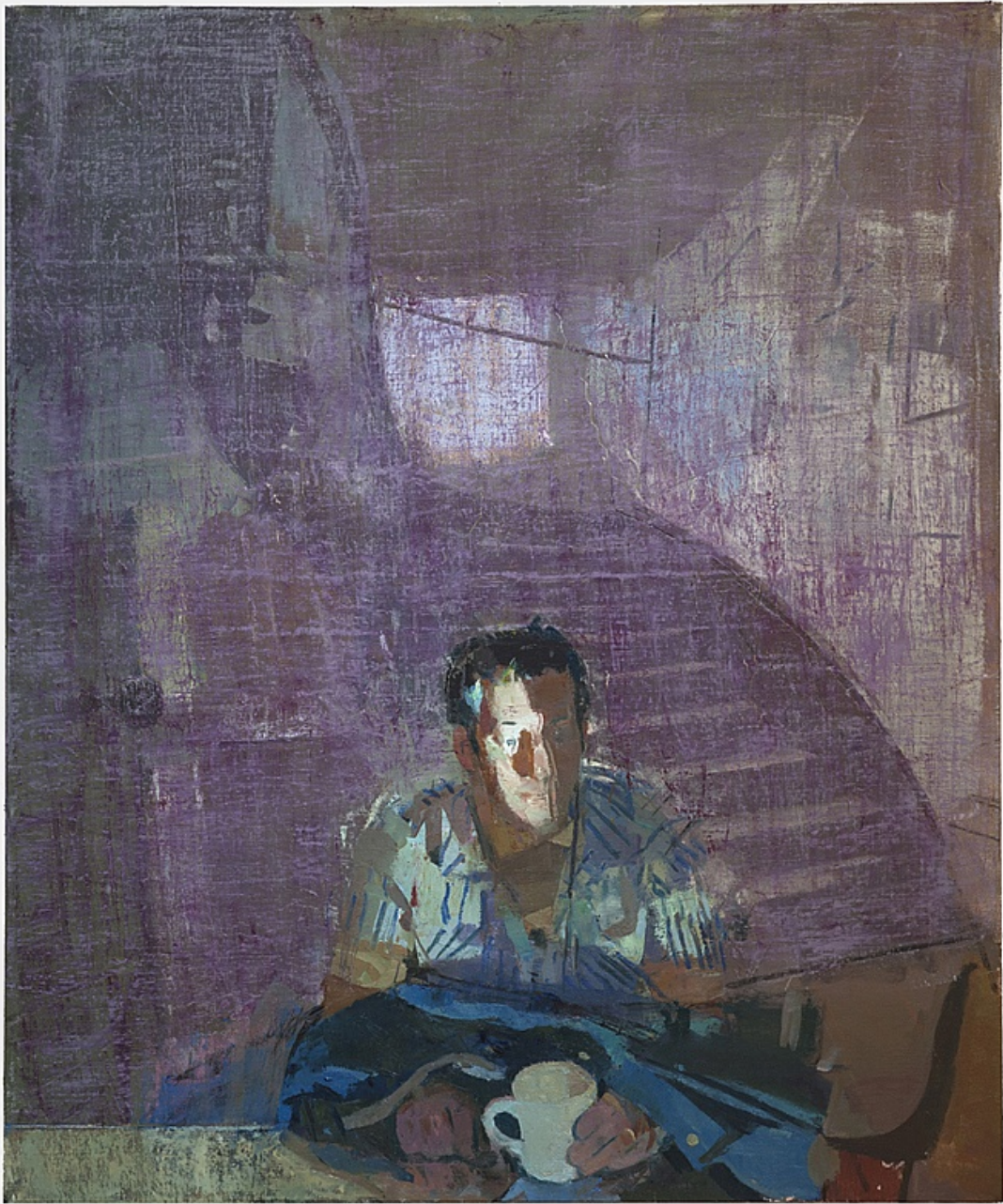
Sangram Majumdar Portrait Projected , 2011 Oil On Linen 50h x 42w in