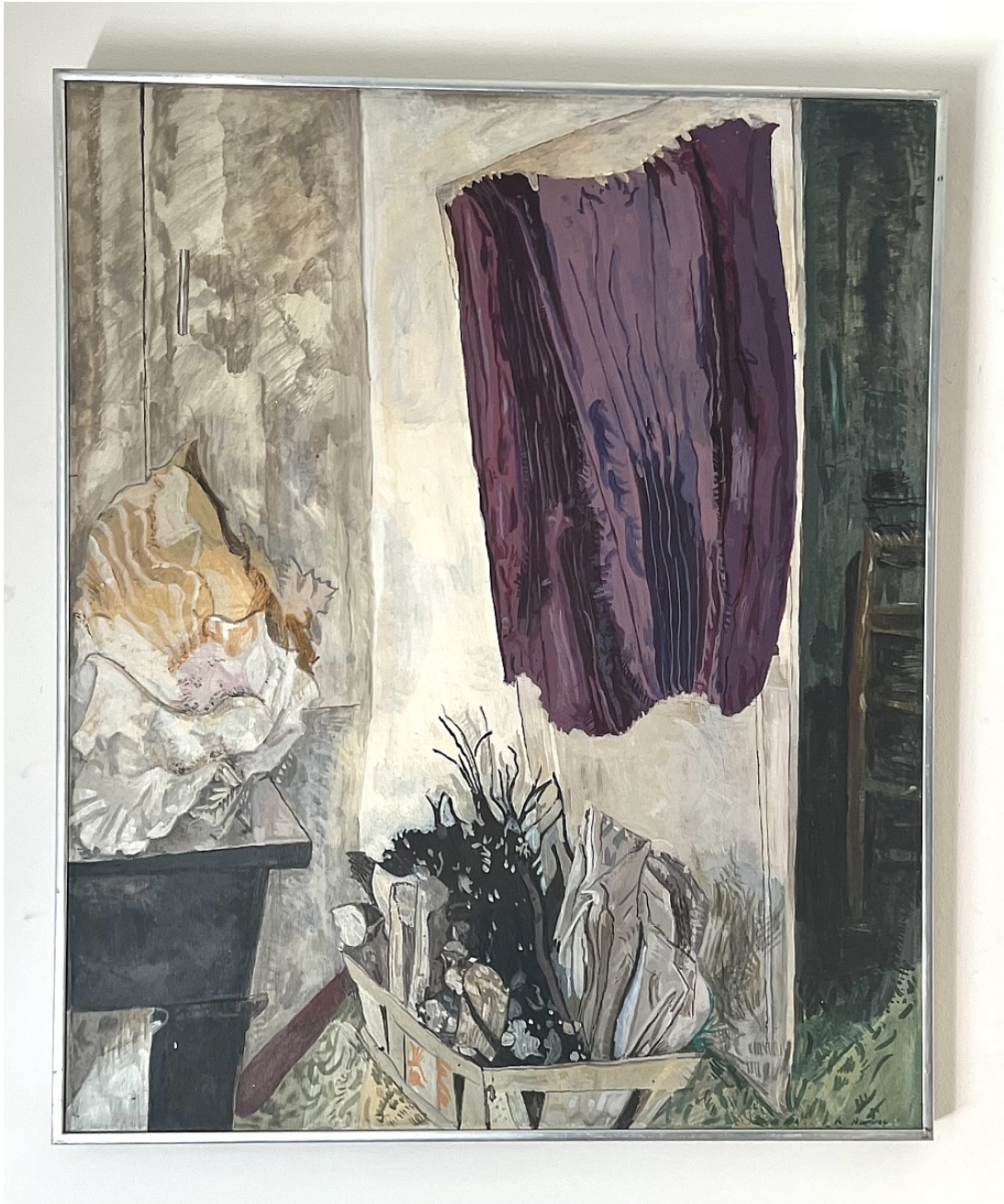
Anne Harvey Purple Cloth and Firewood , c.1960s Oil On Canvas 30 1/2h x 24w in