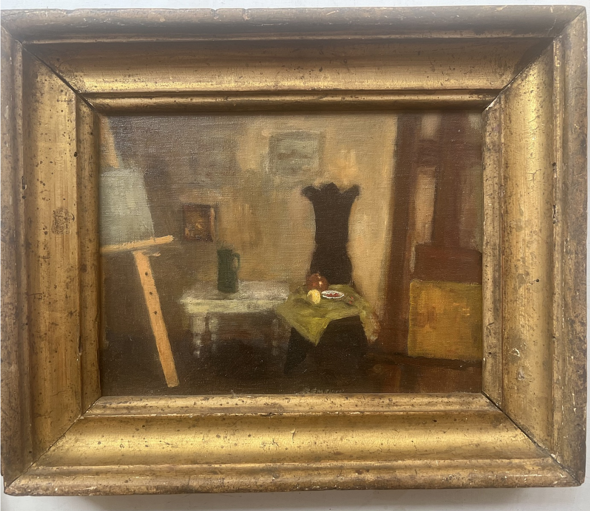
Seymour Remenick Studio oil on masonite 12h x 15 1/2w in