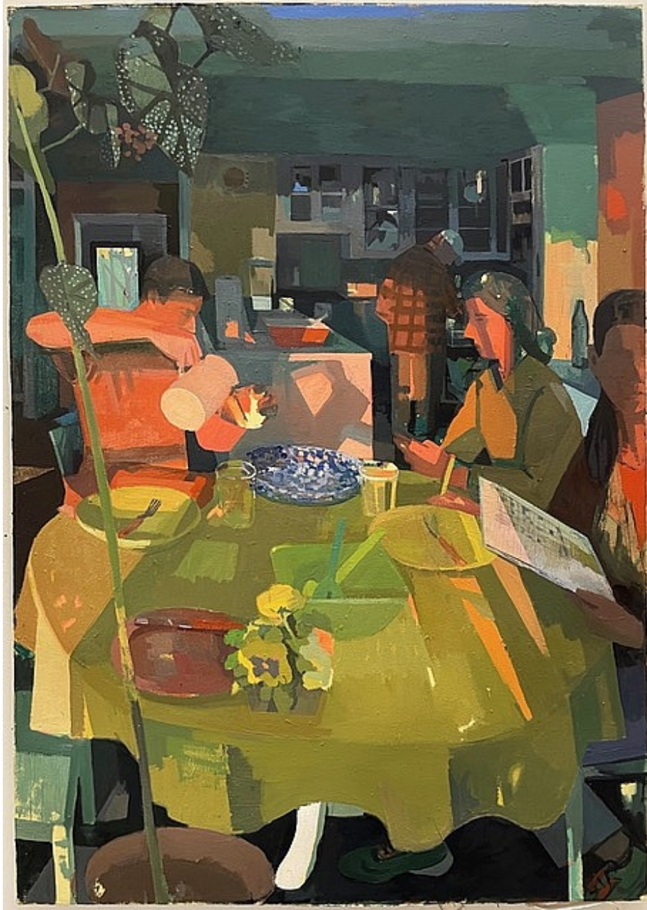
Susan Lichtman The Family After a Meal , 2023 Oil On Canvas 67h x 47w in