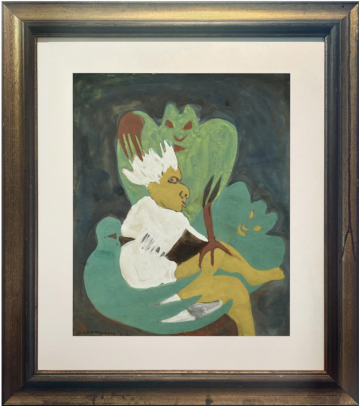
Bob Thompson Untitled (after Goya's Esto si que es leer?) , 1962 gouache on paper 21 1/4h x 18w in