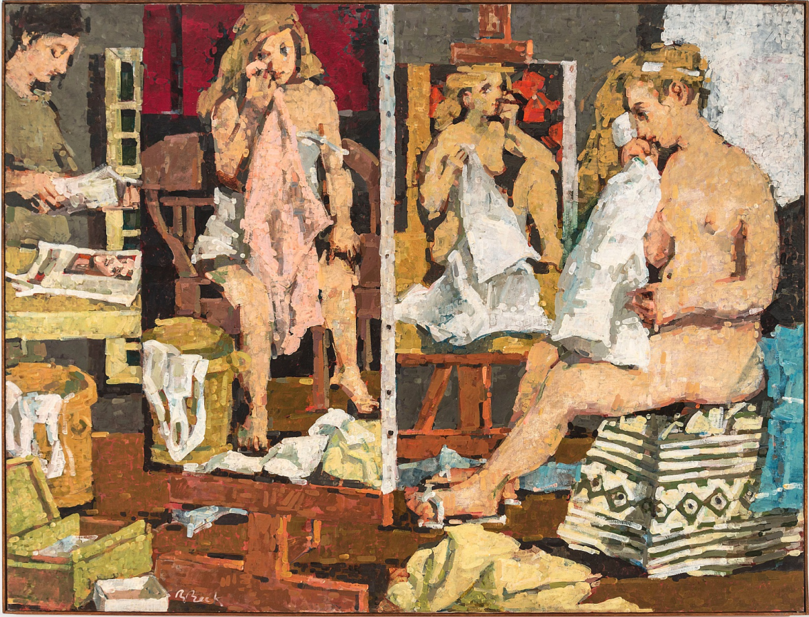
Rosemarie Beck Studio with Magdalen , 1964 Oil on linen 52h x 70w in