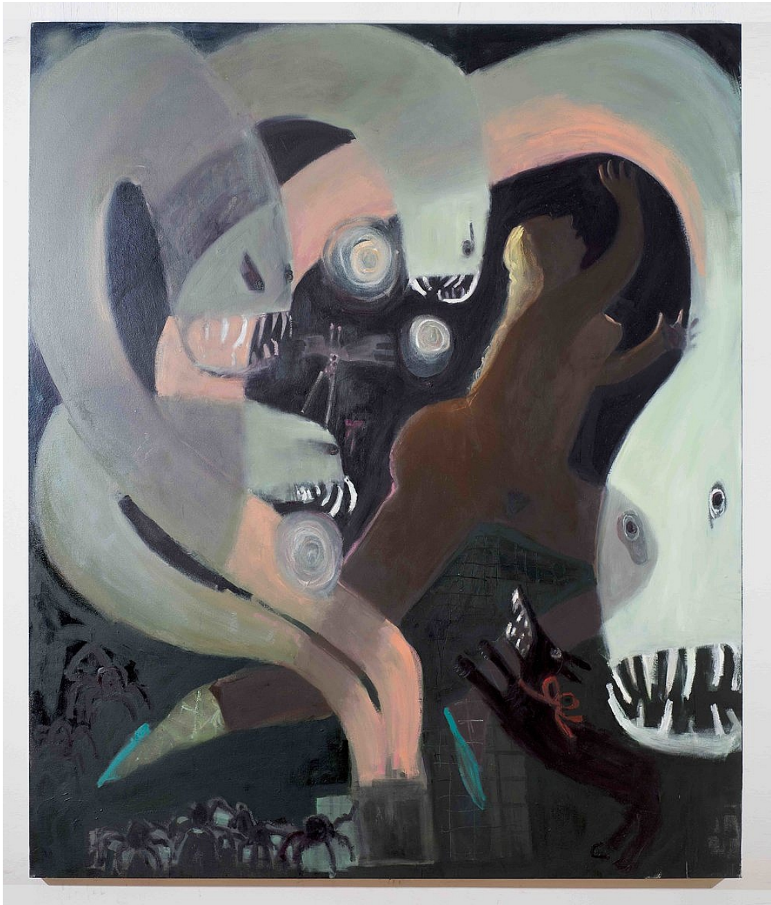
Kyle Staver Pandora's Box , 2014 Oil on canvas 68h x 54w in