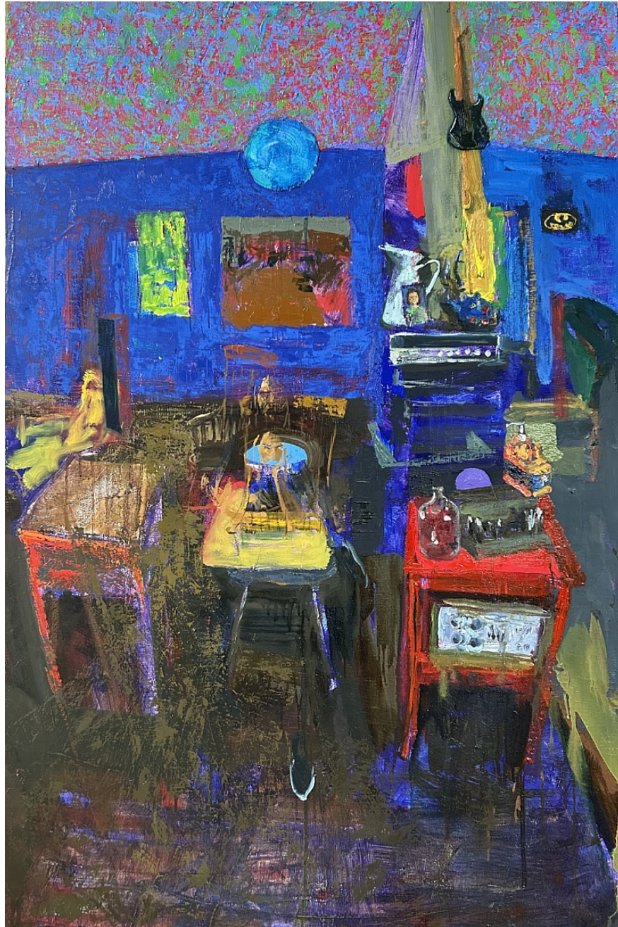
Gideon Bok Ada Cobalt , 2023 Oil on linen 54h x 36w in