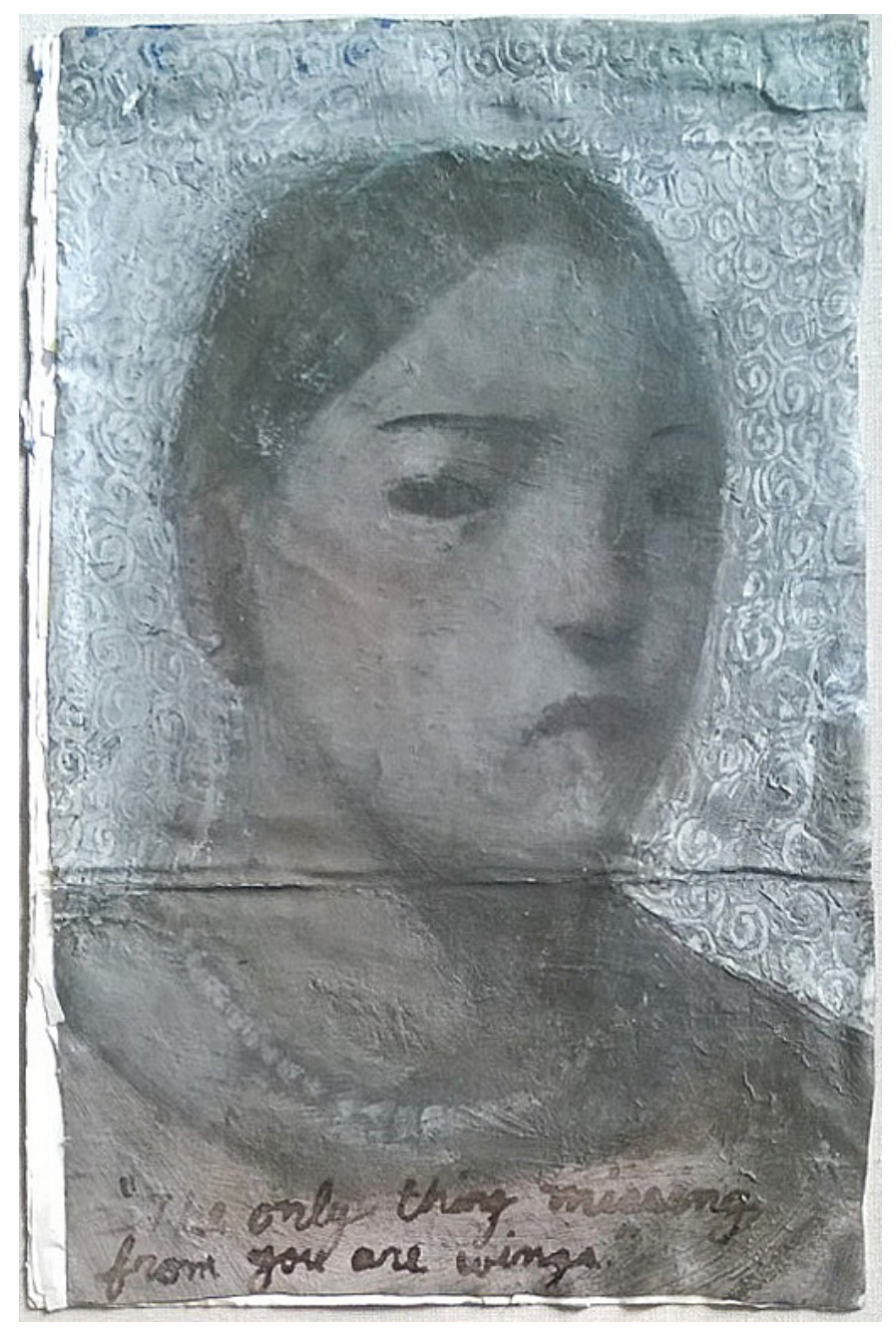
Chuck Bowdish The Only Thing Missing From You Are Wings, 2004 mixed media on notebook paper 14h x 9 1/8w in