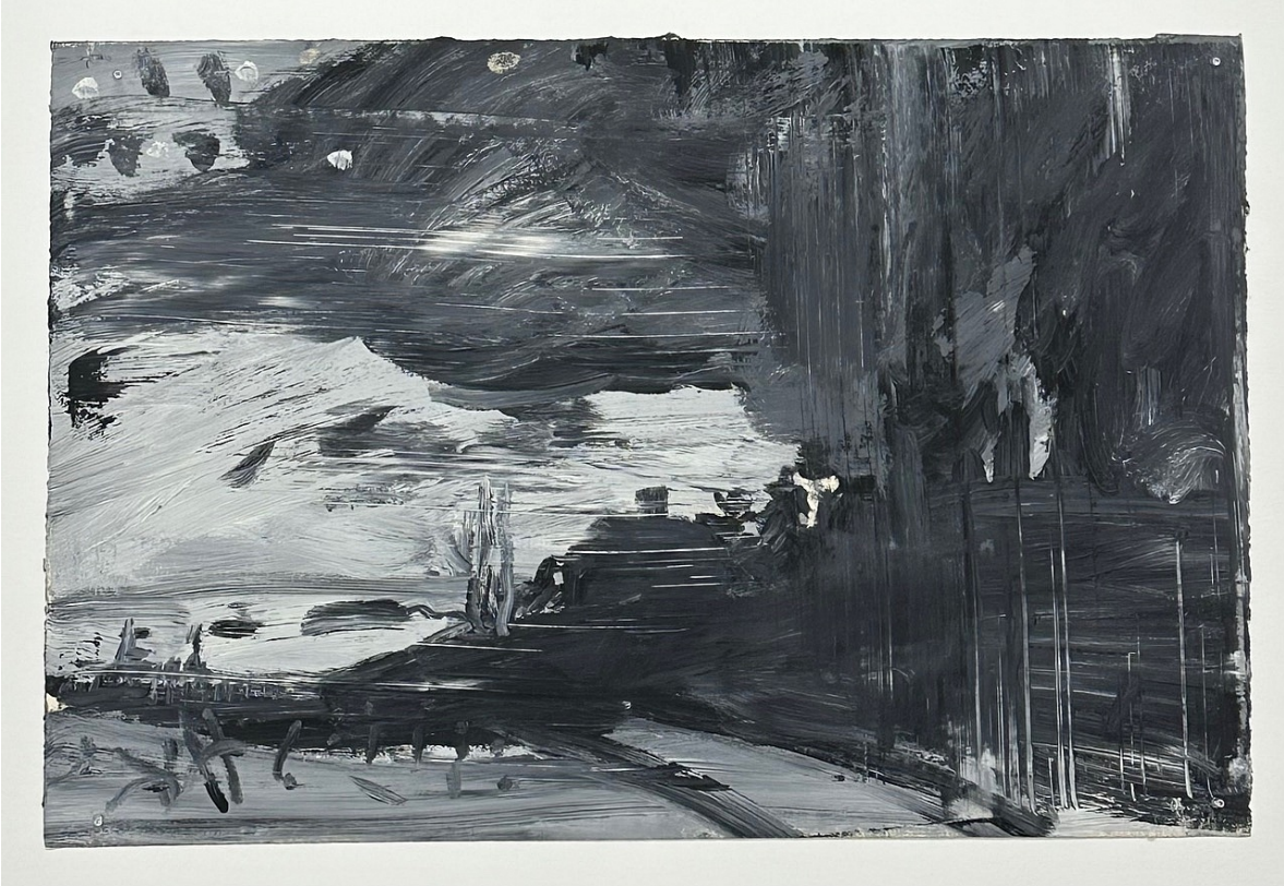
Gregory Botts Iona Landscape, Nova Scotia #2 , 1984 oil and wax on bfk paper 28 1/8h x 42 3/8w in