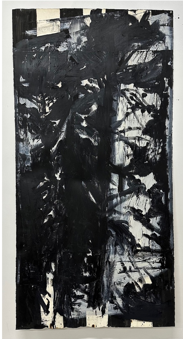
Gregory Botts Tree at Lagoon, 1984 oil and wax on bfk paper 84 1/2h x 42 3/8w in