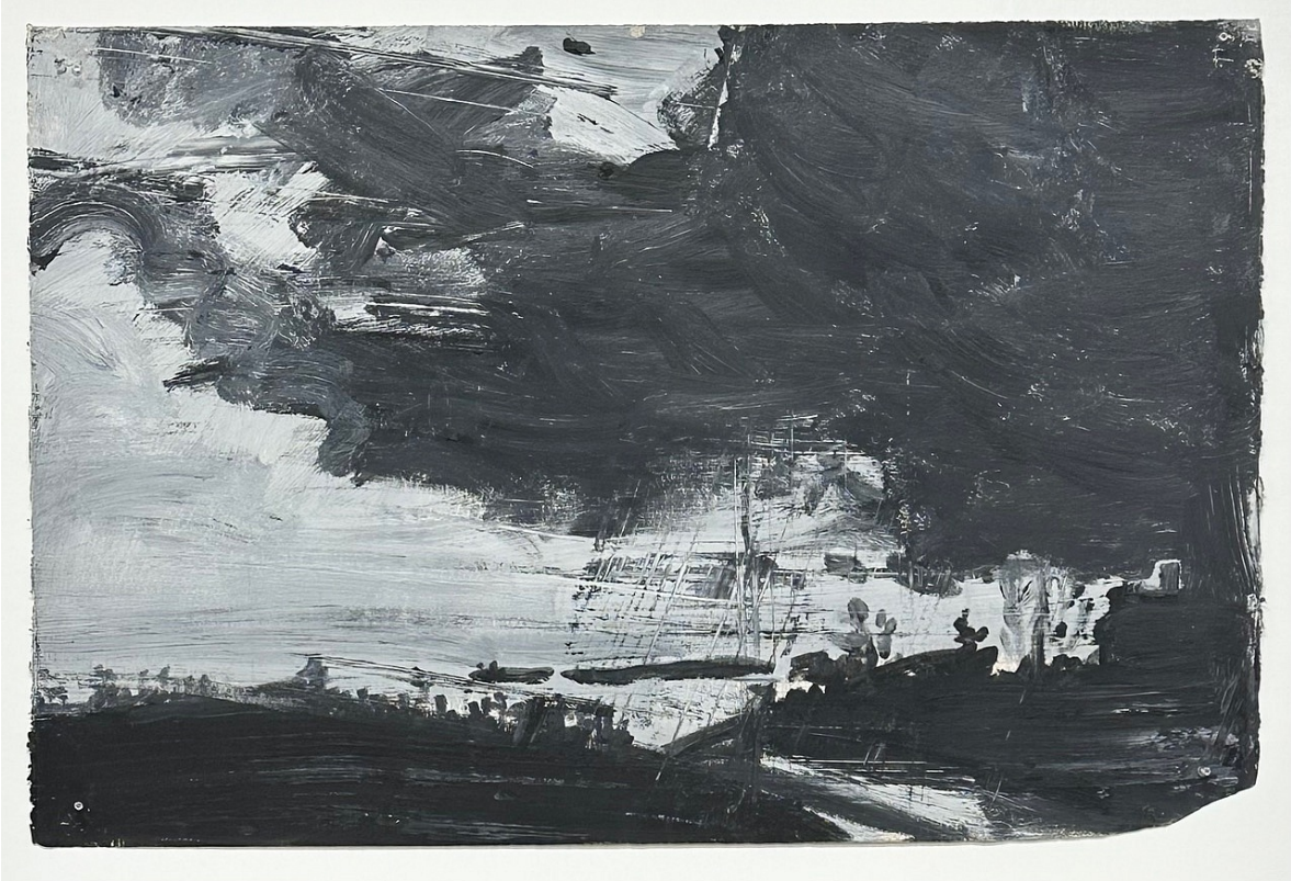
Gregory Botts Iona Landscape, Nova Scotia, 1984 oil and wax on bfk paper 28 1/2h x 42 3/8w in