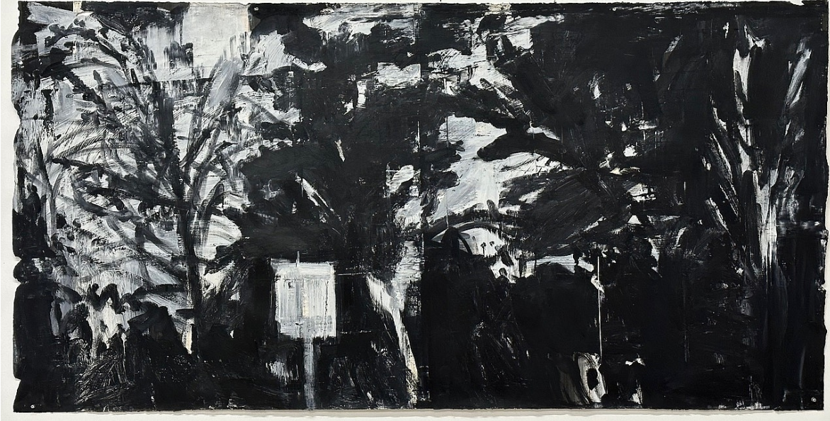
Gregory Botts View into Magic Forest , 1984 oil and wax on bfk paper 42 3/8h x 84 1/2w in