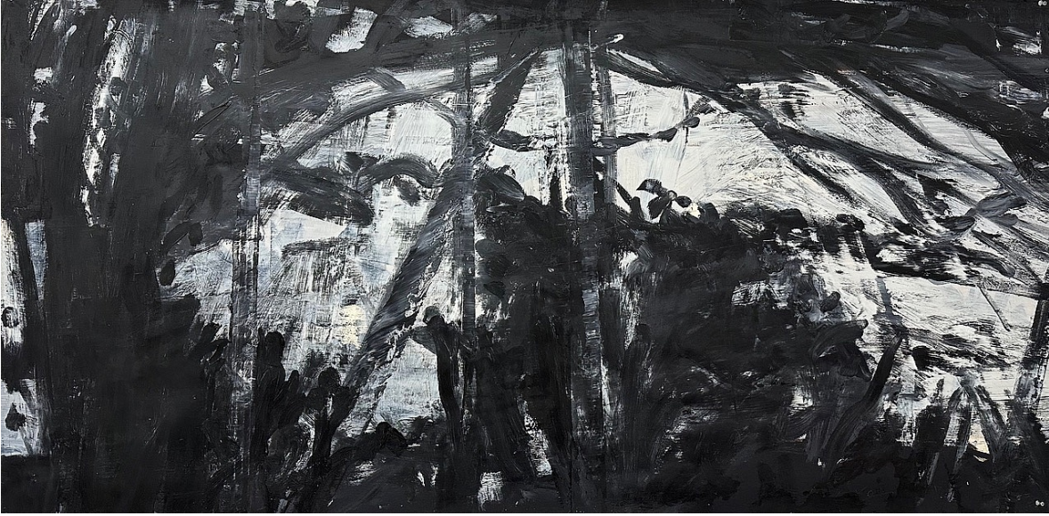
Gregory Botts Maguey and Eucalyptus at Coal Oil Point, 1984 oil and wax on bfk paper 42 3/8h x 84 1/2w in