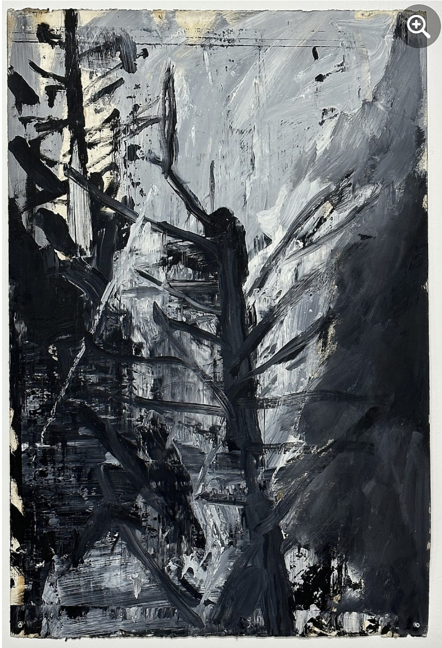
Gregory Botts Nova Scotia Deer Spirit , 1985 oil on paper 42h x 30w in