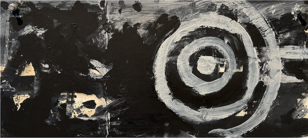
Gregory Botts Lagoon and Circles , 1984 oil and wax on bfk paper 7 1/2h x 16 3/4w in