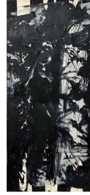
far north distant west Jan 27 - March 2, 2024

Steven Harvey 208 Forsyth Street, NYC, 10002 917-861-7312 info@shfap.com www.shfap.com