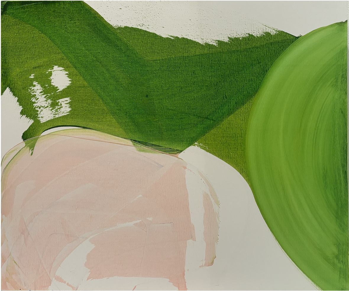
Andrea Belag TG-25 , 2023 Oil on linen 22h x 26w in