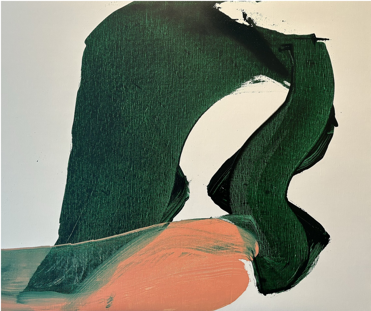
Andrea Belag TG-23 , 2024 Oil on linen 22h x 26w in