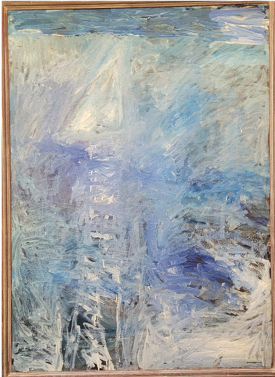
Gandy Brodie Boat in the Bay , 1957 oil on masonite 58h x 42w in