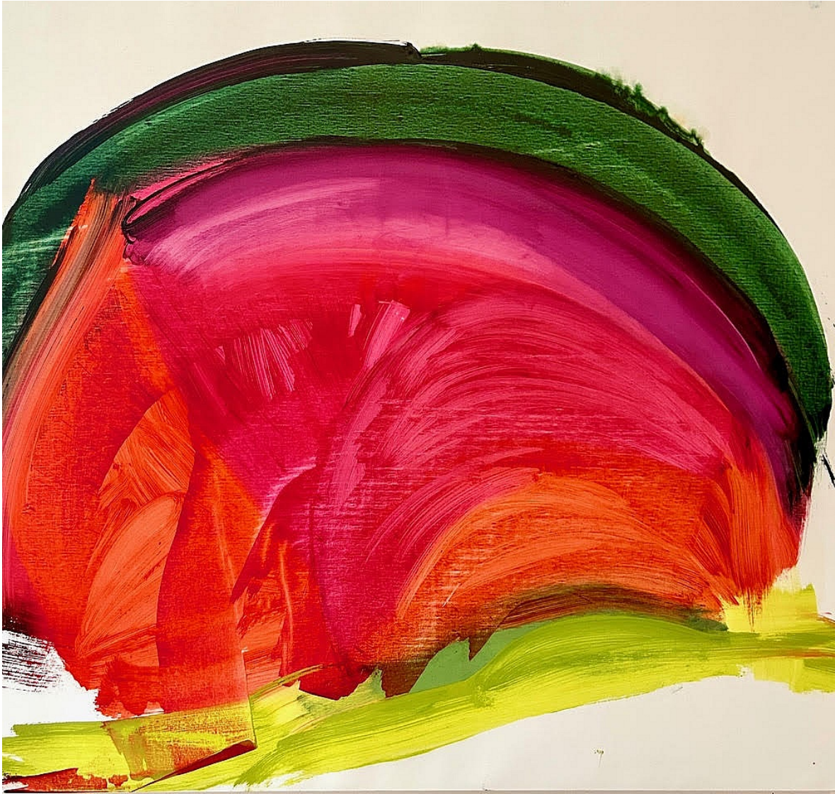
Andrea Belag TG-37 , 2023 Oil on linen 32h x 36w in