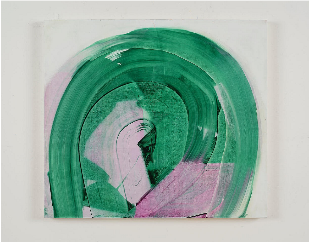
Andrea Belag TG-35 , 2023 Oil on linen 32h x 36w in