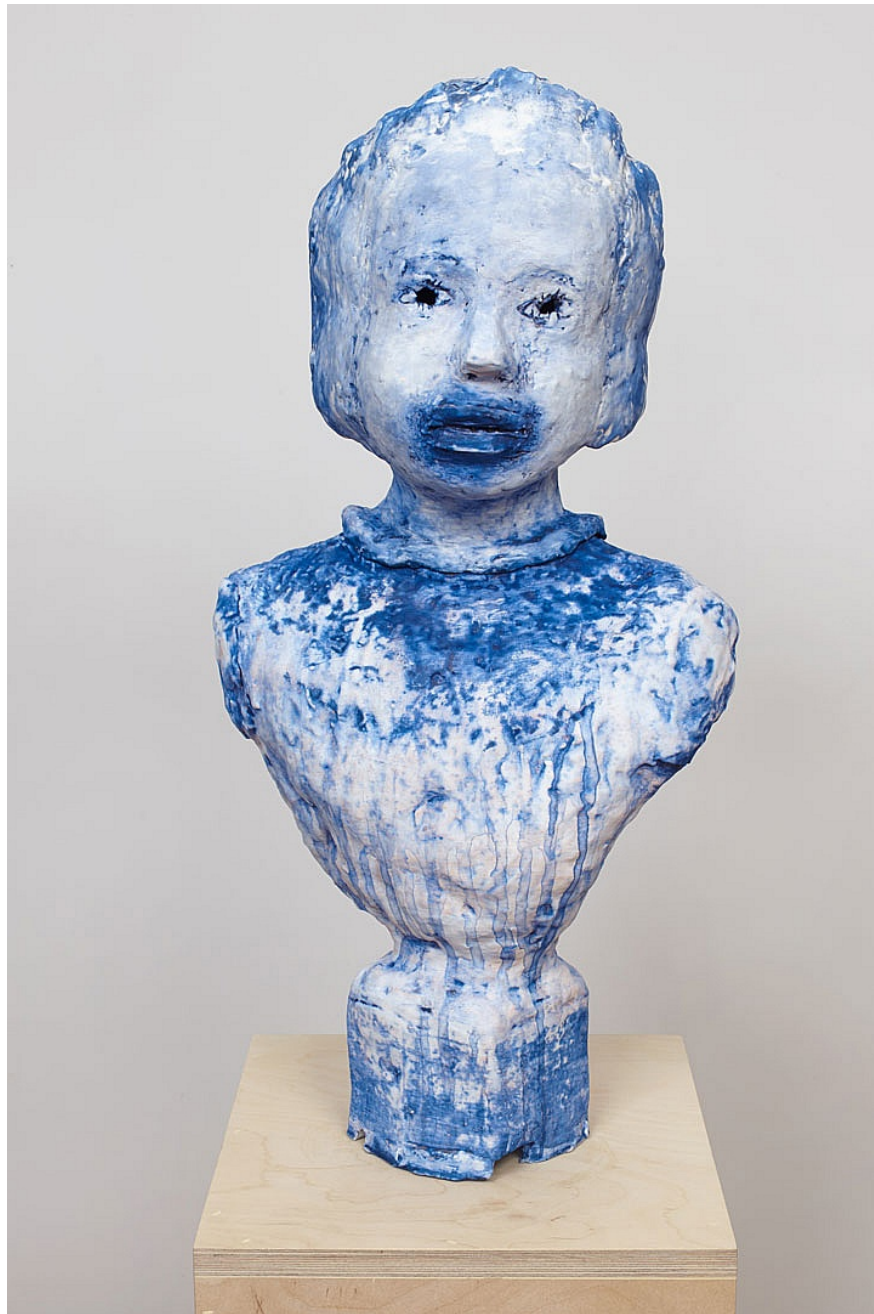
Elise Siegel Portrait with Cobalt and White Underglaze 25h x 13w x 8 1/2d in