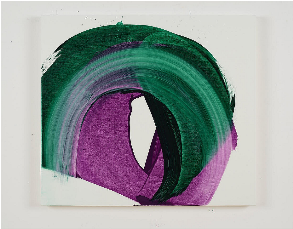
Andrea Belag TG-39 , 2023 Oil on linen 32h x 36w in