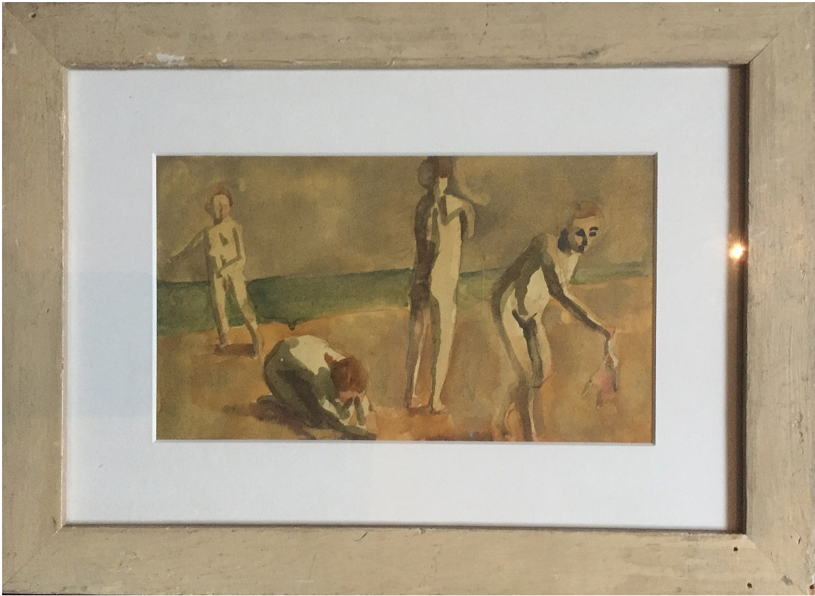
Chuck Bowdish Four Kids, April, 1997, 1997 Watercolor 8 1/4h x 11 1/4w in