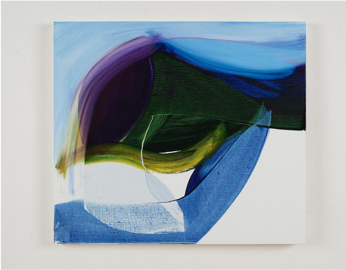
Andrea Belag TG-36 , 2023 Oil on linen 32h x 36w in