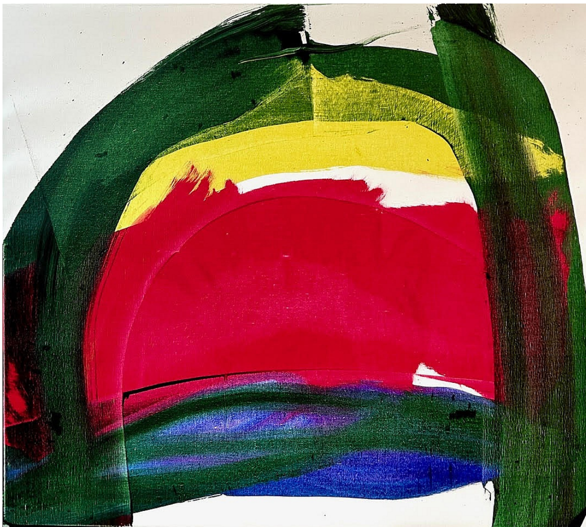
Andrea Belag TG-34 , 2023 Oil on linen 32h x 36w in