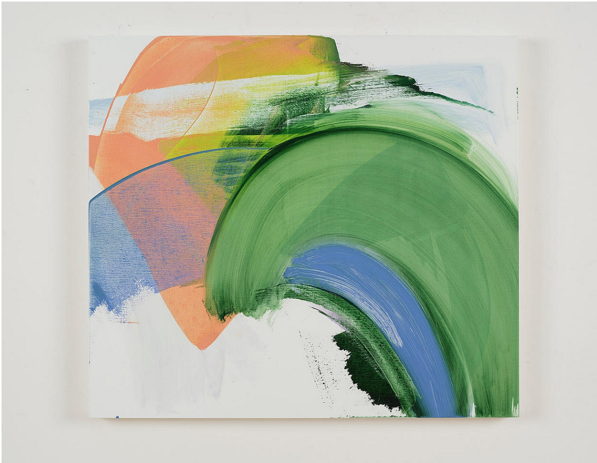
Andrea Belag TG-38 , 2023 Oil on linen 32h x 36w in