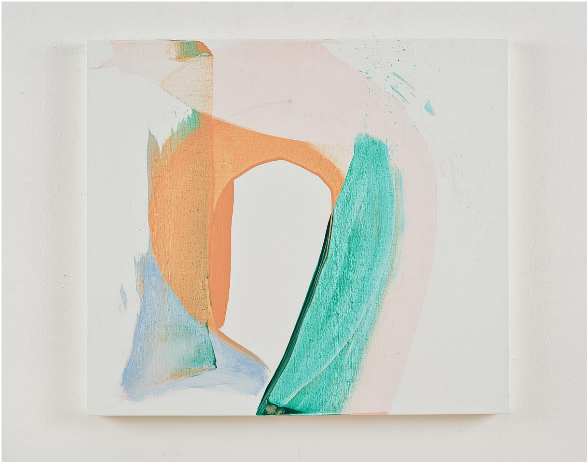
Andrea Belag TG-31 , 2023 Oil on linen 32h x 36w in